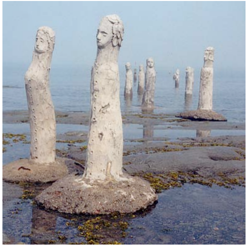
Figure3: St-Laurence River

the same winter landscape for 360 degrees: the human being is but a small part of this world. However, the inuksuk provides human scale and a feeling of comfort. Even if their forms mean different things, these figures provide a sense of familiarity, safety, and hope to most Canadians. The new territory of Nunavut understood this when it included an inuksuk in its flag and its coat of arms, being for them the spirit of their people that will guide them now and in the future.