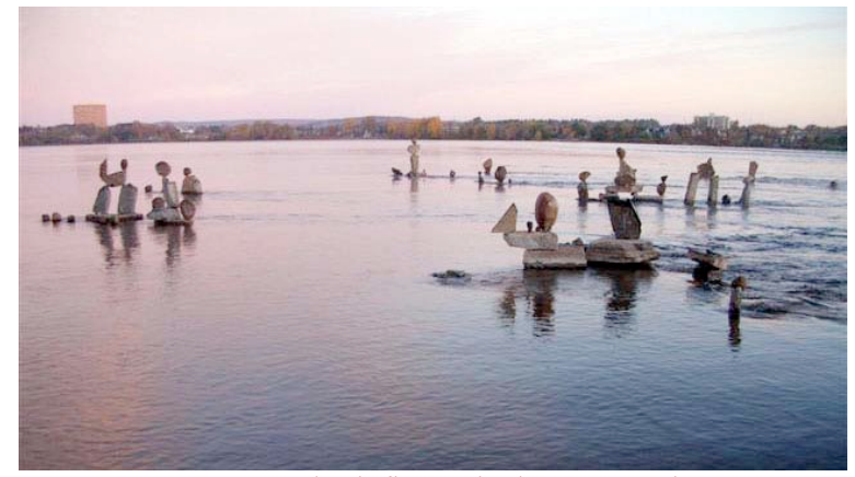
Figure 4: Inuksuit figures in the Ottawa River.

An artist in Ottawa, the capital of Canada, is also inspired by the stones he finds along the shores of the Ottawa River. His creations are more in a vernacular inuksuit style. The sculptures are by necessity temporary because wind, rains and the rapids become stronger in the autumn, and the figures eventually disappear as a result of the forces. However, the cycle resumes in the spring with the re-appearance of new figures. They are so popular that people will visit at sunrise or sunset to witness their peculiarity. Having discussed their meaning and impressions with visitors, the artist maintains photographic records of his installations and comments of the many admirers.