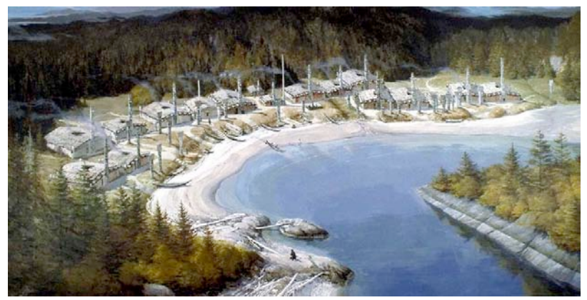
Figure 1: "Ninstints" Original acrylic 28_" x 57" © by Gordon Miller

"bear a unique or at least exceptional testimony to a cultural tradition or to a civilization which is living or which has disappeared." This site commemorates the living community of Haida people and their relationship to the land and sea, and offerings to their oral traditions. This site has great importance because of its integrity as a Haida village, dating back more than 2,000 years. While no longer inhabited, the three main totem poles types in their original setting are still evident: those that protected the village, with their symbolic sculptures representing the values attached to the community; the main poles of the houses that served in part as structural support while representing the values of a family; and, mortuary poles.