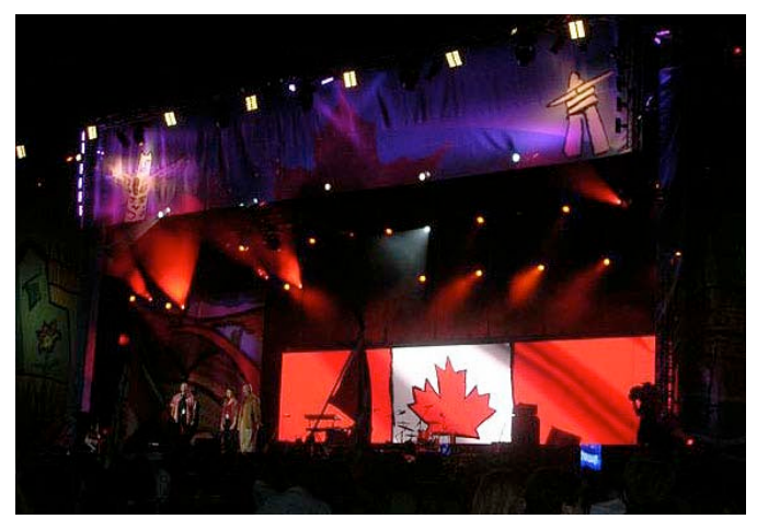
Figure 5: Canada Day in Ottawa.

Finally, we might say that the spirit of place represents the universal concept of the relationship between humans and nature. The respect, peace, equity and friendship that is similarly embodied in this spirit, can then become part of national symbols, a natural, if not rational, phenomenon. Humans often create these symbols without any attachment to forms having national meaning. Take for example the Canadian flag. It is apparent in the vivid red maple leaf which occurs naturally in the autumn in most provinces across the country; the blood of the people that fought to make this country free for all; all set on a white base representing the omnipresent snow. In an image from Canada Day celebrations in Ottawa in 2006, the Canadian flag shares its importance, and the stage, with the two symbols that we have been discussing - totem and inuksuk - over the past while.