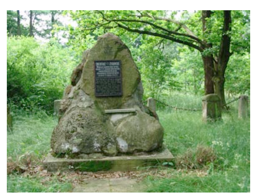
Figure 4. The monument to the martyrdom of Jews.

great effort into erecting the monument to the martyrdom of Jews. It was the first time an object like this was erected by a Pole without the support of any Jewish organization" (Bartlomiej 2007).