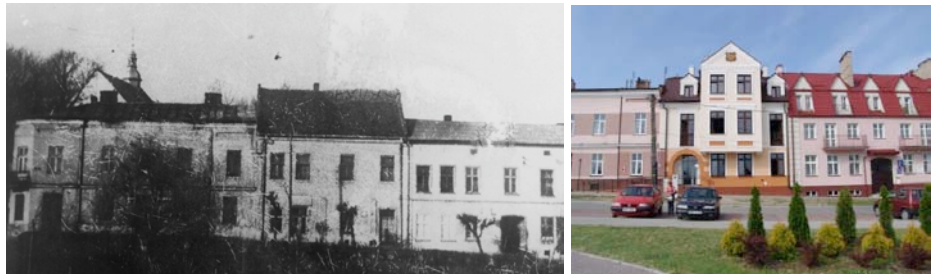
Figure 1. The building of Sokol Gymnastic Society

members who were allowed to pay by installments. The last installment was paid in 1934 and two years later, the IIIrd district of Krakow organized a convention of Sokols in Radomysl At the time, the building had one storey, a gable roof and an elevation with four axes. An irregular composition of narrow windows added specific charm to the building. It is said that Sokol also owned a building to the left whose elevation was so narrow that there was only one window. The building housed a theatre room. Unfortunately, there are no documents to confirm this and scrutiny of iconographic documents reveals that this segment of the building was in fact an integral part of the adjacent object. Sokol was an important element of urban space. It certainly integrated local people and encouraged them to organize meetings and demonstrations. The building was pulled down in the early 1990s and the remaining gap was an ugly sight. The plans to rebuild and restore Sokol Gymnastic Society seemed fantasy at first. It was only after Poland had joined European Union and funds had appeared that the project called 'Restoration of the building of Sokol Gymnastic Society to meet the needs of the Centre for Culture, Tradition and Tourism in Radomysl Wielki together with a tourist and recreation route' was developed. Local authorities cofunded the project and the building was ready for use in 2008.