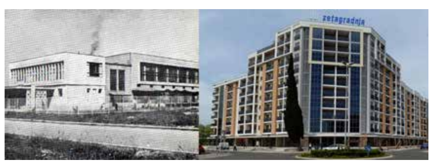
Fig. 7: The disappearance of industrial heritage: the old dairy factory in Podgorica becomes a residence-business zone (Retrieved May 15, 2016, from http://www.skyscrapercity.com/showthread.php?t=868232&page=10(left); http://www.fujitsuklime.com/zetagradnja-podgorica (right)).

The most radical re-urbanization and, at the same time, the most successful privatization on the territory of Montenegro is related to the segment of the central coast of the Boka Bay, i.e. the transformation of the military shipyard Arsenal in Tivat into the nautical-tourism complex "Porto Montenegro"<sup>36</sup>. The Maritime-technical Shipyard "Sava Kovačević" was established in 1889 as a maritime Arsenal for Austro-Hungarian navy. In 1921 it became a part of the Navy of the Kingdom of Serbs, Croatians and Slovenes. Following WWII it became a part of the Yugoslav Navy. The shipyard was engaged in the repair of ships and submarines, construction of small ships and military pyrotechnics. It had 1,000 to 1,300 employees and it represented the basic development force of Tivat in the second half of the 20th century.<sup>37</sup> However, only in 2007, when it was privatized<sup>38</sup> and when it finally became "a part of the urban tissue" with a 2 km long and 2 m high wall, i.e. the fenced and inaccesible 30 ha of Arsenal space, did it stop to represent a space blockade which directed the development of this part of town towards the hinterland instead towards the coast.<sup>39</sup>