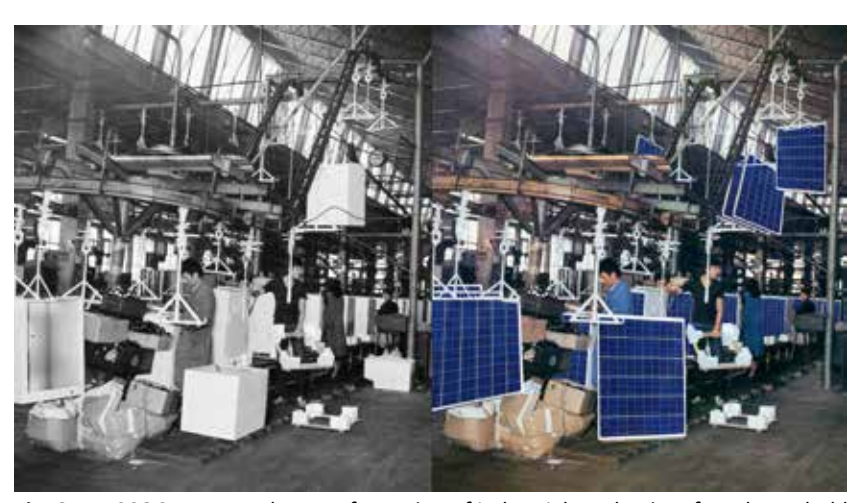
Fig. 6: MACCOC center – The transformation of industrial production: from household appliances (left) to solar panels production (right) (Presentation of OMA, Cetinje, September 2012, retrieved from Municipality of Cetinje).

2.4 Urban re-development – complete disappearance of industrial complexes and structures and formation of a new urban matrix, most frequently for residential or tourist purposes