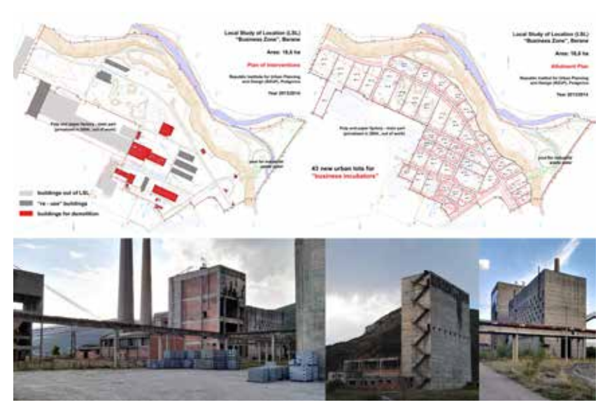
Fig. 1: "Re-parceling" and formation of new urban matrix with "Business incubators". (Local Study of Location (LSL) "Business Zone", 2013/2014, retrieved from Republic Bureau of Town Planning and Designing ad., Podgorica; Photo by B. Lutovac).

be used again, and 12 to be demolished (due to extremely bad condition of the facilities). Newly formed lots vary in area, depending on the existing facilities and infrastructure (the total of 43 lots, the area ranging from 900 m2 to 6,450 m2), where it is possible to build structures for business purposes only (basic purpose)<sup>25</sup>, the floors including basement, higher ground floor, first floor (maximum height up to 12m). (Figure 1)