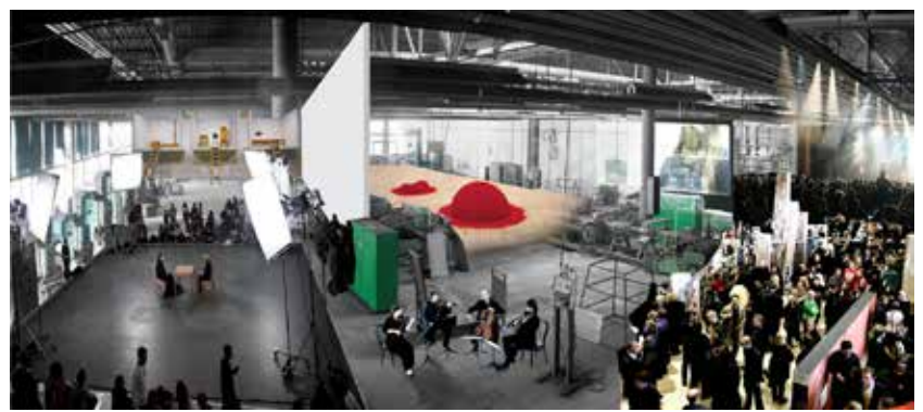
Fig. 5: "New Obod" vs. MACCOC center: industrial space turned into the space of artistic production (Presentation of OMA, Cetinje, September 2012, retrieved from Municipality of Cetinje).

The revitalization strategy of this vast industrial complex actually leans on two basic elements: on the one hand, the engagement of world famous names in the fields of art and architecture (Marina Abramovic, Rem Koolhaas), and on the other, the variety of contents from cultural to industrial production (new technologies) which are compatible and based on the principles of self-sustainability.<sup>34</sup> However, following the public presentation of the Master Plan in Cetinje in September 2012, which was attended by high representatives of the Montenegrin government and members of diplomatic circles, as well as the artist Abramovic and the authors of the Plan, no significant steps in its realization have been made since.