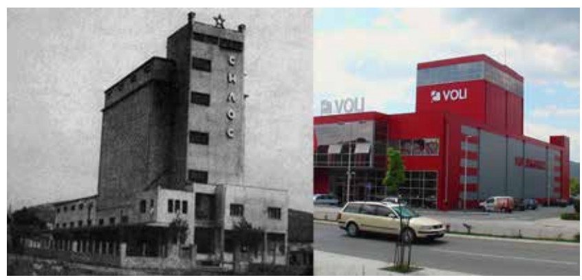
Fig. 2: The old silo in Niksic, 1935 – The new envelope and unsuccessful "remarking" of the town landscape (Left photo by Enciklopedija Jugoslavije, tom 2. (1956), Zagreb: Leksikografski zavod FNRJ, p. 462; Right photo retrieved June 10, 2016, from http://www.ramel.me/page.php?cat=5).

cyrillic "CUJOC"), unfortunately, has not been made use of. Instead, it was replaced by decadent uniform materials which bear no meaning. The new, "brand red" vertical in the town landscape successfully "competes" with the dome and the bell tower of the church dedicated to Saint Basil of Ostrog, which is in its close vicinity. Despite the fact that this example might be characterized as "a successful business investment" in the architectonic-spatial planning sense, especially at the level of the town landscape, the new look of the silo has actually devastated the urban space of the town. (Figure 2)