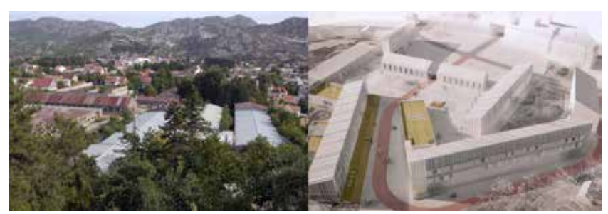
Fig. 3: "Old Obod" in Cetinje: before 2010 (left); 1st Award Urban Design solution for the University complex of the art faculties, 2008 (right) (Retrieved from The Catalogue of Competition Papers, Plavi dvorac, Cetinje, March 2009).

contain there following: Faculty of Fine Arts, Music Academy, student dormitory and joint facilities of the floor area of cca 8,600 m<sup>2</sup>. Given the fact that the current facilities had no significant architectonic value, it was possible to make more radical interventions on them. The winning bid proposed to retain a certain segment of the existing facilities and with the construction of the bypass road a fluid connection with the downtown has been achieved.<sup>32</sup> The realization of one segment of the complex started in 2010. However, due to the lack of financial means, its progress is quite slow and with uncertain deadlines. (Figure 3)