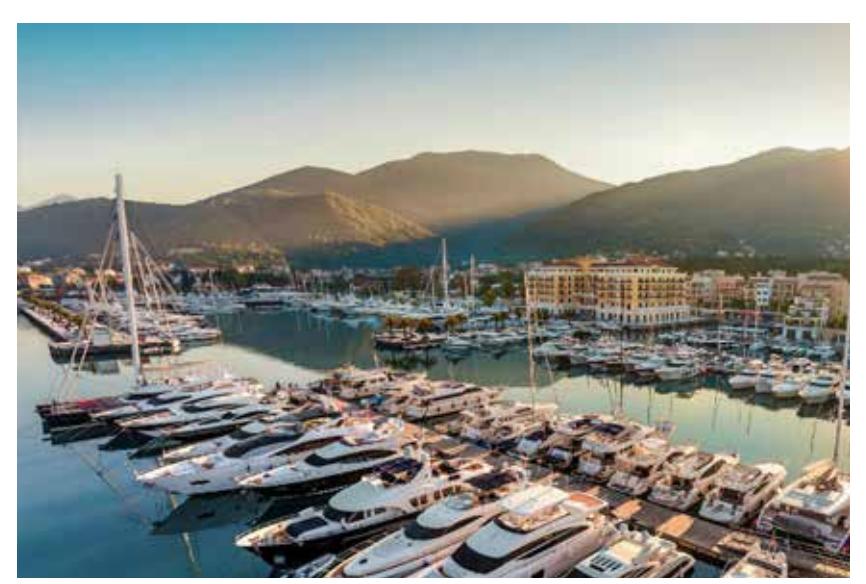
Fig. 9: "Porto Montenegro" – a luxurious nautical-tourism complex with the super yacht marine, 2016 (Retrieved May 15, 2016, from www.portomontenegro.com ).

At one of the jetties (Jetty 1), an Old Crane was preserved and it has become one of the "Porto Montenegro's" symbols. As part of "Porto Montenegro" there is also a valuable postmodernistic facility (a former military compound of the Yugoslav Army, 1989, arch. A. Djokic) which is used as the administrative headquarters.