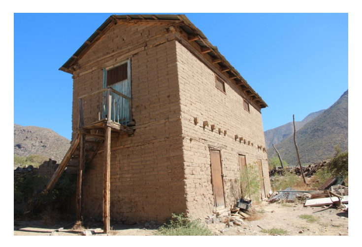
Figure 9. Rural two-floor house in Monte Patria. Case with mass and horizontal ladders. State after the earthquake of 2015

The earthen construction culture of the area may not presently appear threatened, but it is of main importance to reinforce the culture and preserve the information to ensure the permanence of the built heritage of the territory, which has so much to teach the world about anti-seismic strategies.