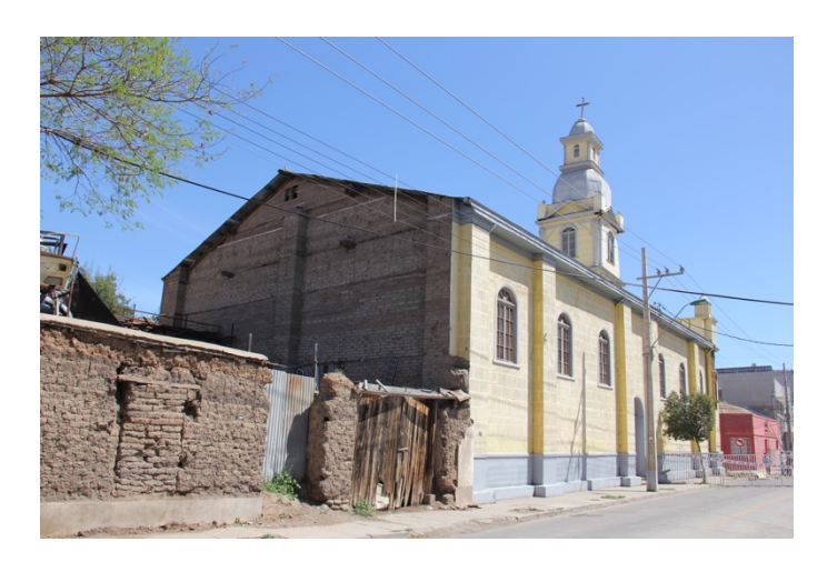
Figure 8. Corazón de María church in Ovalle. Case with mass, counterforts and horizontal ladders. State after the earthquake of 2015

Since 1570 until the present there have been over 40 earthquakes of large magnitude, seven of which have surpassed 8Mw. The first were recorded in 1604 and 1634 both in La Serena, of unknown magnitude but with terrible and devastating consequences. Papudo earthquakes that happened in1703 had a magnitude of 8.7Mw, Valparaíso in 1822 of 8.5Mw, Vallenar in 1922 of 8.7Mw, and the last in Canela in 2015 of 8.4Mw.