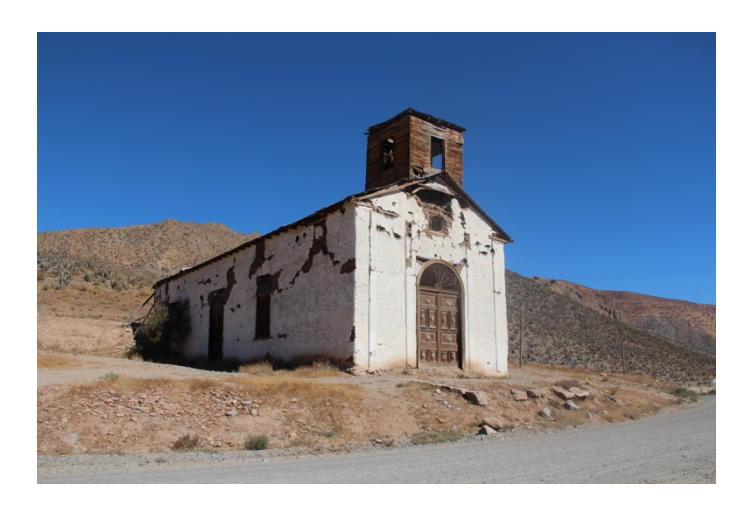
Figure 10. Rural abandoned church in Río Hurtado. Case with mass and horizontal ladders. State after the earthquake of 2015