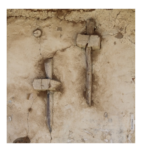
Figure 6. Trabas: Wooden pieces to join perpendicular walls in the town of Cogotí 18 (Credits: Amanda Rivera, 2016)