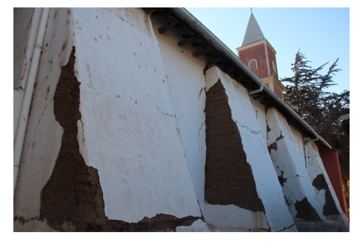
Figure 5. One of the few buildings with counterforts in the area. San Antonio del Mar church of Barraza built in 1795

Las trabas are specific wooden elements (Fig. 6) used to support the joining of other wooden elements of the construction, such as mezzanines and roof structures, with the outer adobe walls. Within the reinforcements are the most precarious devices and made with the smaller woods, which means less access to reinforcement resources. They can be found perpendicular to the wall, where the element crosses the wall and on the inside is attached to the structure of wood or mezzanine. Or when it is the same roofed wood or between the floor that crosses the wall and it is hooked with a piece of wood of a smaller section to avoid its displacement These trabas have also been observed in diagonal positions, where an element independent of the wooden structure is arranged as a square and is hooked in the same way by a wood of smaller section in both outer points. This system is of great vulnerability, especially when the pieces of wood are exposed, they are in permanent exposure to water and xylophages, which generates their frequent rotting and finally, added to the absence of maintenance, its disappearance in the reinforcement system.