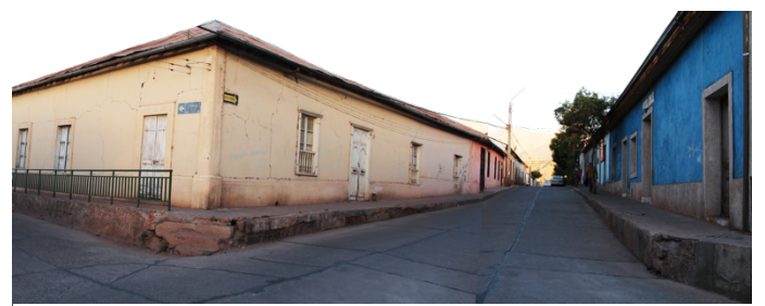
Figure 1. Continuous façade at the urban area of Combarbalá after the 2015 earthquake.

Around the second half of the 18th century, because of the improvement of mining and farming activities, the territory became more populated, with about 200 years of the Spanish presence in Chile and two centuries of earthquake activity.