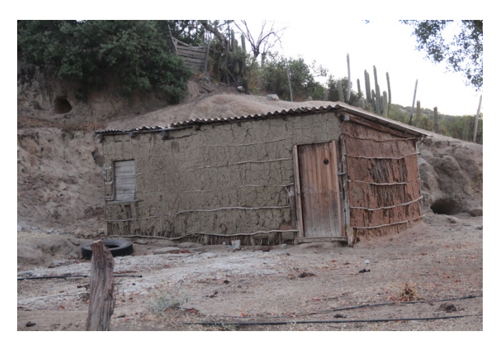
Figure 2. Quincha of the "Norte Chico" with medium size branches as structure.