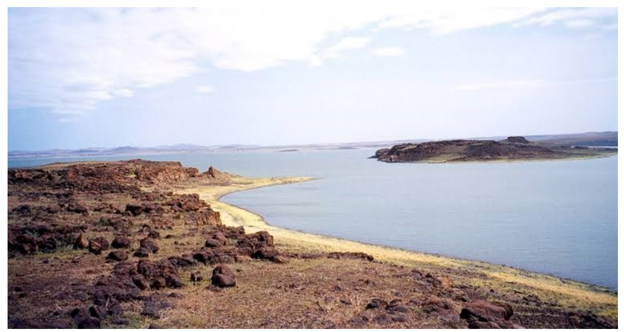
Figure 4. Lake Turkana South Island