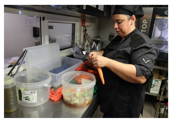
Figure 3. Separating the waste to be identified and weighed, in Tertúlia Algarvia

Sofia Fonseca explained how food security is an essential aspect of resilience. In 2021, 40% of the total food produced in the world ended up wasted (WWF-UK, no date). Causes of food waste include unsustainable production and consumption practices in developed countries; inefficient production and preservation practices, lack of infrastructure in developing countries; and disconnection with nature and the food production process in both cases. But there is more to food waste than wasted food. There are economic, social, and environmental aspects to be considered. The ICOMOS International Charter for Cultural Heritage Tourism 2022, in Principle 7, indicates that all cultural tourism stakeholders must take action to mitigate, reduce, and manage climate impacts. Culturally sustainable and responsible tourism can be a force for good in transforming customers' behaviour to more nutritious and safe diets with a lower environmental footprint by adopting and implementing the principles of the Mediterranean Diet.