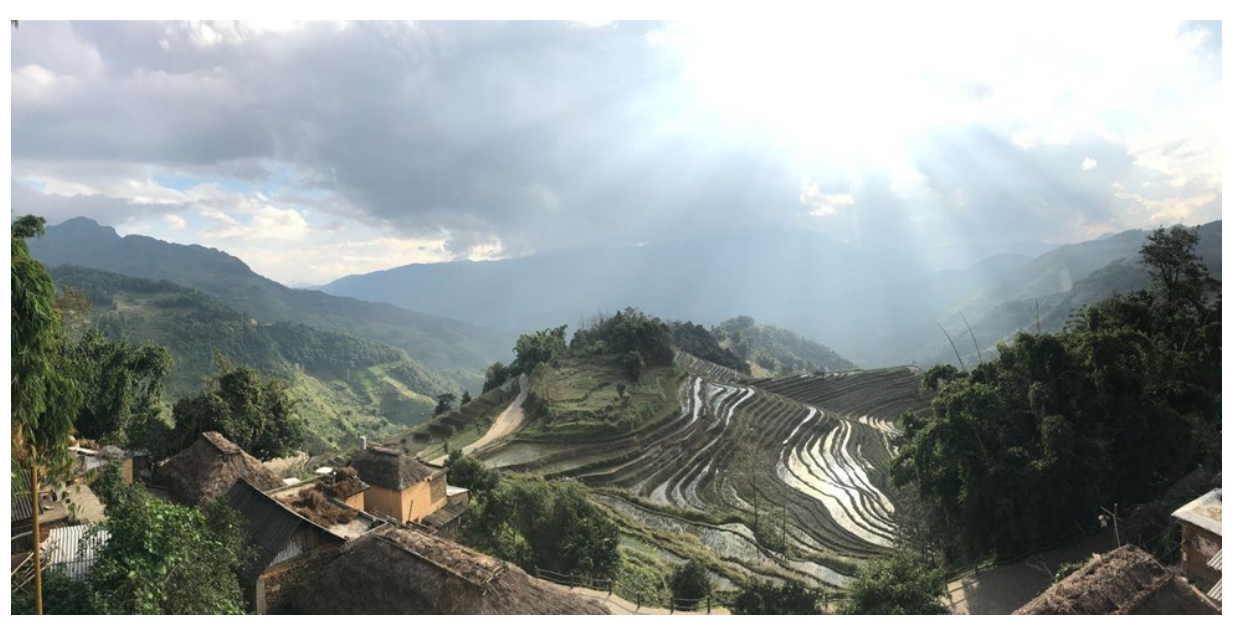
Figure 2. Honghe Hani Rice Terraces

However, the government's approach to the governance of the HRT needs to consider local residents' suggestions to ensure sustainable development. A total of 86 heritage site stakeholders were interviewed for the survey from November 3-10, 2019, and the interviews were all in the form of semi-structured interviews. A total of 70% of respondents felt that one of the significant problems was the loss of the agricultural population or the disappearance of traditional culture.