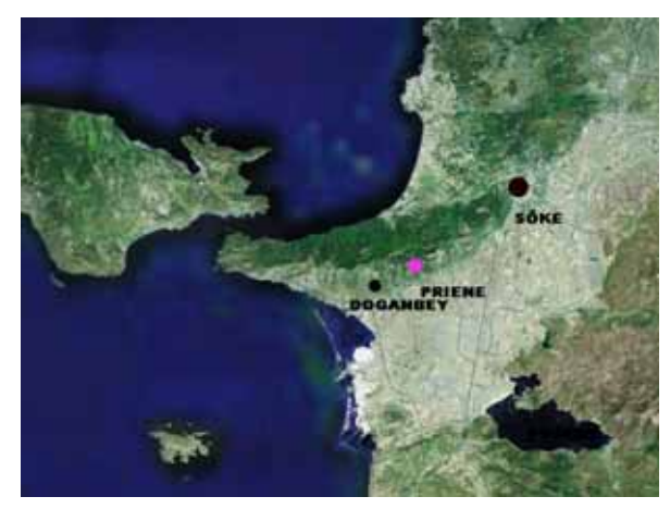
Map 2: Location of Doganbey between Priene and