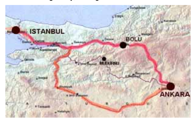
Map1:Location of Mudurnu between İstanbul and Ankara