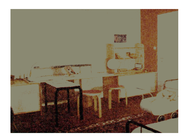
Figure 4. Girls' room (Kaunis Koti 3/1955, 22).