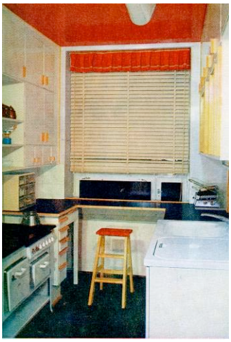
Figure 2. Red ceiling and blue floor in kitchen (Kaunis Koti 1/1954, 19).