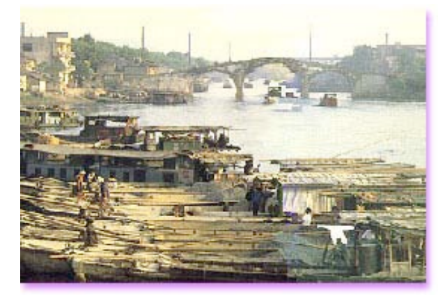
General Introduction to Grand Canal

Abstract. Although it's too early to announce the success of the Observation & Protection Stations-Network of Grand Canal, this network surely offered an example of the involvement of communities along the cultural routes. To protect the Grand Canal, World Heritage Candidate in China and the oldest and longest canal in the world, the Ruan-visan Heritage Conservation Foundation established this project in 2006, providing a positive force for the protection of the Canal and encouraging the communication between governments and the public, as well as the collaboration between academics and field workers. To keep the commemorative integration of the cultural route, the stationsnetwork tried to link different towns along the heritage route together, and protect heritage from bottom to top. The paper not only introduced the structure and work of this network; it also discussed the problems during the practice, such as the financial resources and the role of NGO.