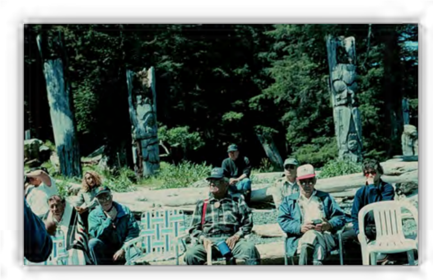
Figure 2 - Chiefs gathering near Totem Poles for consultation

The cultural resources at the site are very fragile. They cannot withstand any degree of human disturbance. Unsupervised visitors may inadvertently damage artefacts by touching them or walking on them. Supported by visitor entry fees, the Watchmen program was established to protect these sensitive sites, which is accomplished by educating visitors about the natural and cultural heritage of Gwaii Haanas . Comprising men and women, elders and youth, they also provide information about safety and the latest marine forecasts that come in by radio.