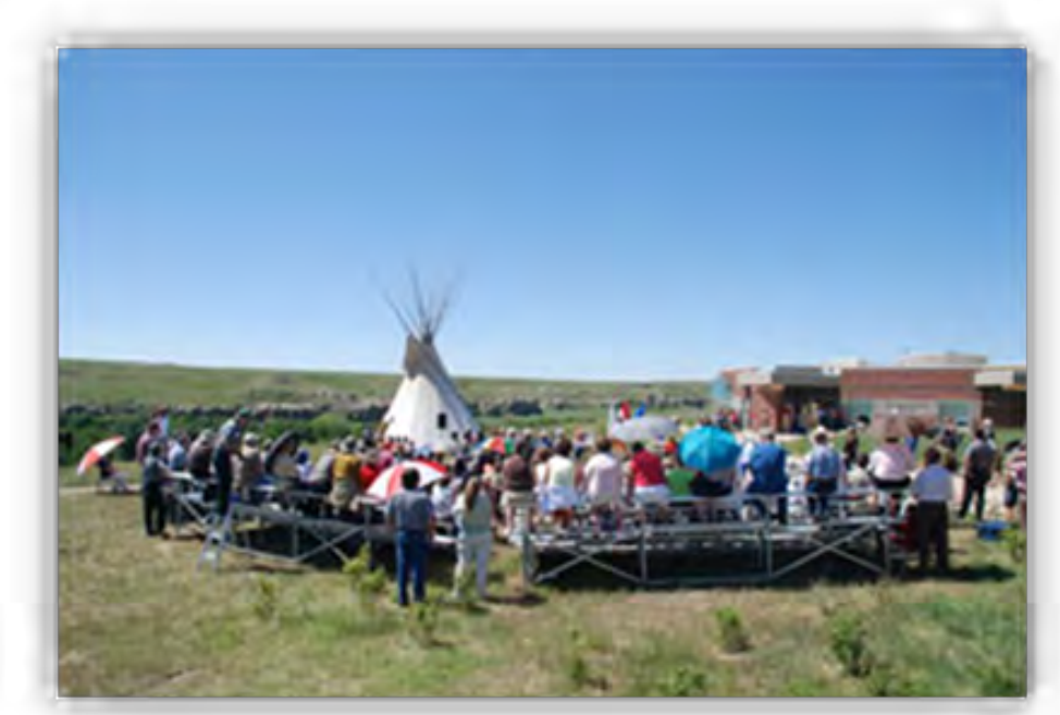
Figure 6 - Opening of the Writing-on-Stone Interpretive Centre in 2006

In September 2011, the boundaries of Áisínai'pi were expanded with a 1,000 hectare land acquisition by the province near the Milk River, to now give the site a total protected area of 2,700 hectares. Alberta Tourism, Parks and Recreation staff commented that: "We have recognized Writing-on-Stone provincially and nationally because of the significance of its rock art and to this day, Aboriginal Elders consult the rock art to commune with the spirits, receive power and direction in life, and learn of their future (Duncan)."