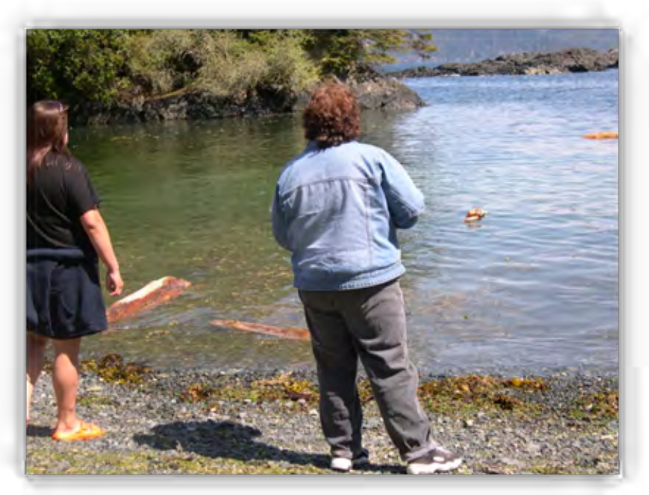
Figure 3 - Haida Nation members 'feeding the ancestors' near Sgang Gwaay

When a visitor comes to SGang Gwaay, he or she might be surprised not to find a museum or interpretation centre, nor information panels, models, or any means of protection (e.g. gates, fences, barriers). There is no