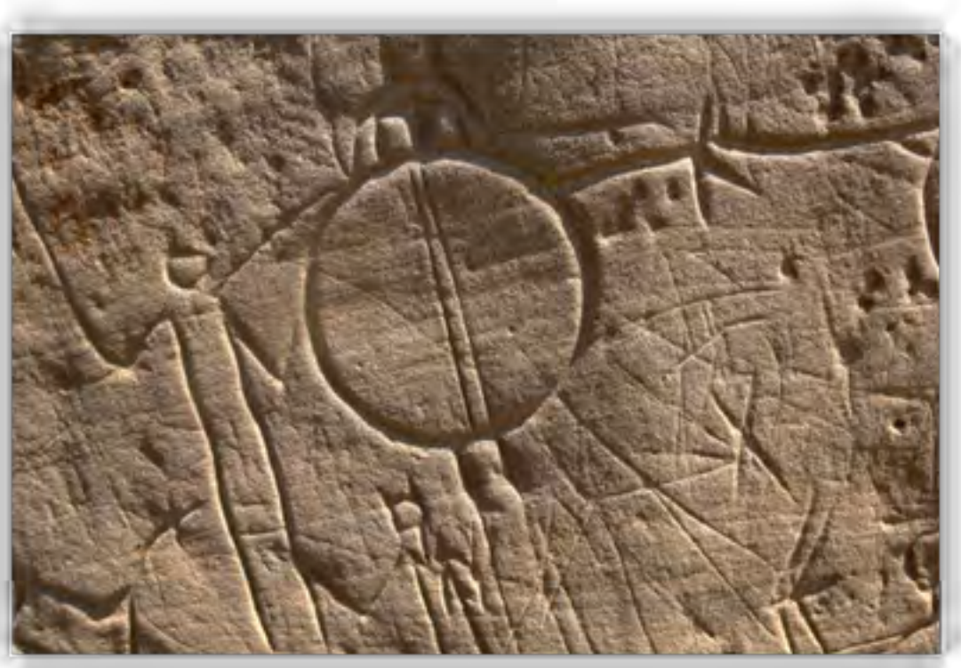
Figure 5 - Petroglyphs at Writing-on-Stone Provincial Park

The goal is to reach a meaningful balance that respects the rights of Aboriginal communities and the interests of all Albertans. In addition to respecting their constitutional rights, Alberta Tourism, Parks and Recreation values the unique perspective that Aboriginal communities offer. Aboriginal communities are encouraged to participate in the development of regional parks planning.