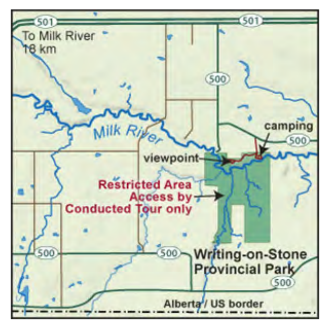
Figure 4 - Writing-on-Stone Provincial Park location

Spirit powers are associated with the rock formations and with the view towards the nearby hills, known as Kátoyissiksi . The rock art, from both pre-and post-Contact periods, is an expression of this meeting of the spirit world and the physical world. Elders consult the rock art to commune with the spirits, to receive power and direction in life, and to learn of their future. This connection continues to exist today among the Niitsítapi .