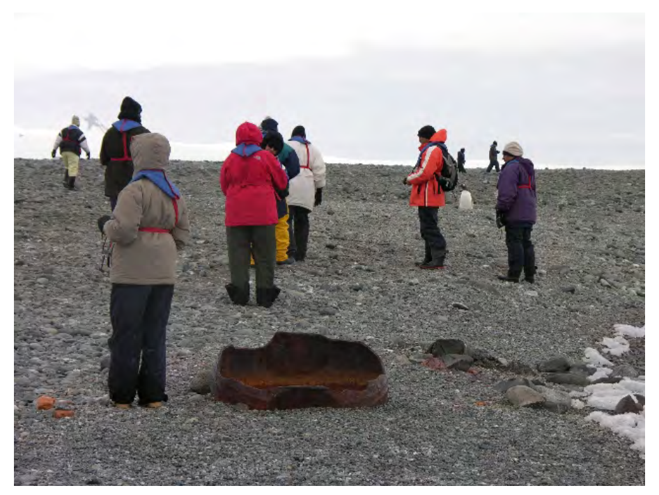
Figure 5. View of the archaeological sealer-whalers site and visitors in Yankee Harbour, Greenwich Island.

From this enumeration we can learn of different situations for different sites. Some of the sites where the presence of sealers has been confirmed are regularly visited by tourism (Yankee Harbour). Others can be easily reached although there are no official records of tourism (Hennequin Point). There are others