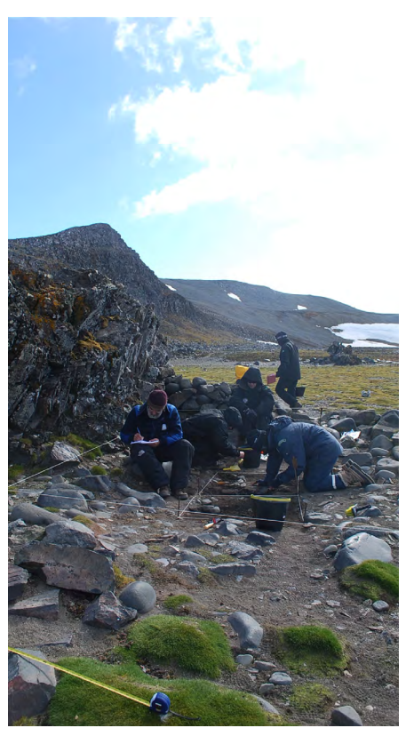
Figure 1. Archaeological excavation at Sealer 3 site by the Universidade Federal de Minas Gerais research group (Byers Peninsula, Livingston Island) Photo by A. Zarankin 2011

A first archaeological map of the distribution of the sites related to 19th century whalers and sealers on