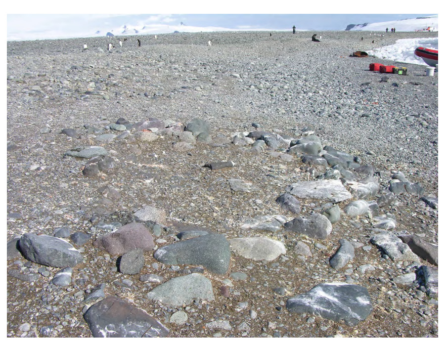
Figure 4. View of the archaeological sealer-whalers site in Yankee Harbour, Greenwich Island. Photo by M.X. Senatore 2006.

The aim of this paper is to contribute in the building of measures, which will articulate the preservation of those sites and the visit of tourists. We consider that