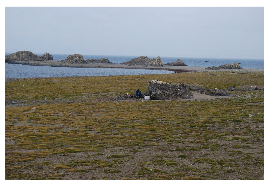
Figure 6. View of archaeological sealer-whalers site in Byers Peninsula, Livingston Island.

On the other hand there exist in the Shetland Islands many other places in which sealers' remains are highly probable but which have not yet been surveyed by archaeologists in order to determine their localization.