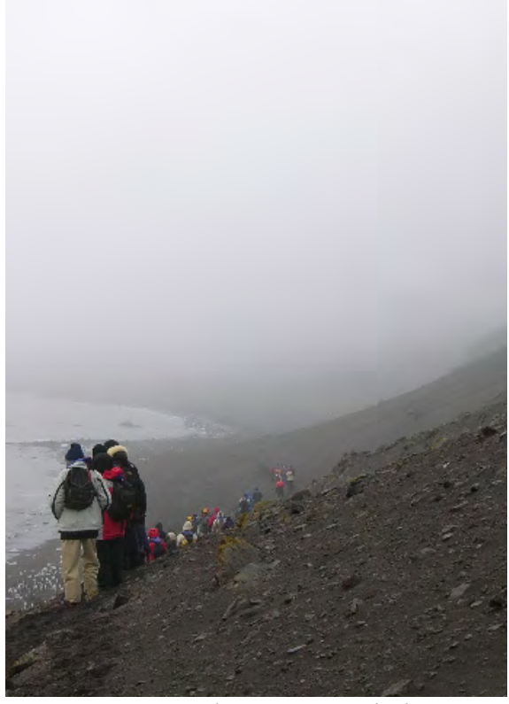
Figure 7. Tourism in Hannah Point, Livingston Island.

Is the problem solved by naming these sites as Antarctic Historic Sites or Monument? It is conceptually but not practically. Why? Because the Antarctic Historic Sites and Monuments reflect the official history, then the incorporation of the "invisible sites" would break into the strong version of Antarctic history, yet for practical purposes as Stonehouse and Shire (2010) stated this does not mean that they will be preserved unless appropriate preservation plans are provided. Moreover the general tendency defines historical sites or monuments as specific places rather than as areas. This becomes a limitation for the chosen historical sites themselves because many spaces around them bearing potential interest for future archaeological research are left uncared (an example of this are the thrash deposits associated to the huts). However, sealers and whalers' activities cannot be conceived as developed in a definite spot in the landscape: they cover areas. Bearing this in mind, some steps have been taken for