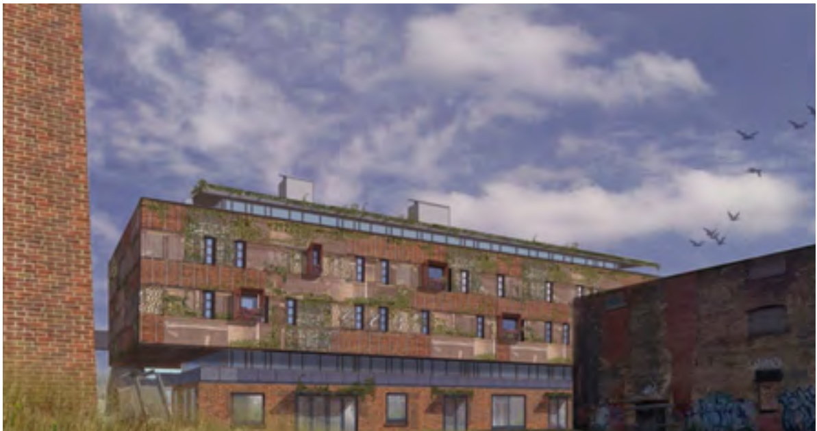
Figure 9. Rendering of Centre for Green Cities (DSAI)

In addition to the inherent benefit of its adaptive re-use focus, Evergreen’s sustainability objectives included aggressive site wide energy and water