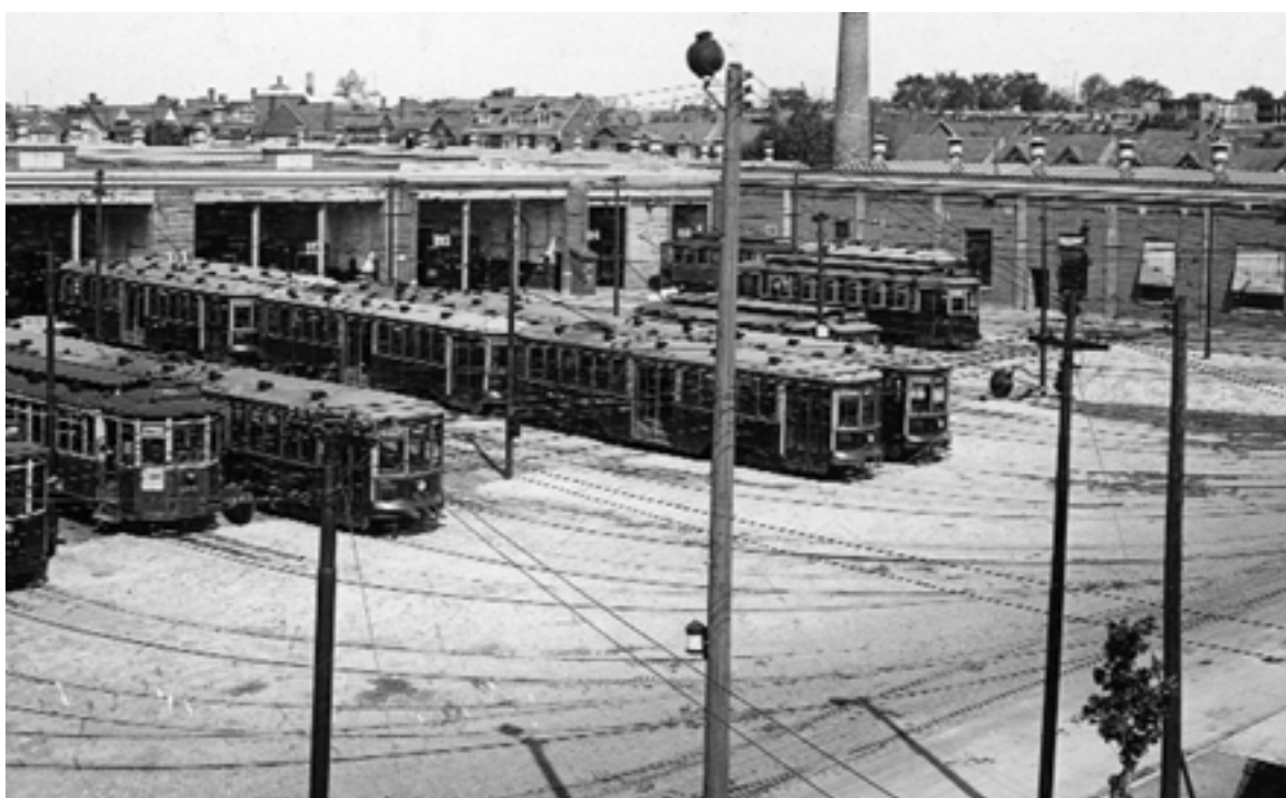
Figure 1. Historical view of the Barns

line along St. Clair Avenue. By the end of the third and final phase of expansion in 1921 and the completion of the fifth barn, the city had taken over operations and formed the Toronto Transportation Commission, later to be known as the Toronto Transit Commission (TTC). In the period that followed their initial development, the barns serviced 10 routes and 167 streetcars, providing employment for hundreds of workers. However, as the city continued to expand over the course of the 20th century, the location became less practical as an active transit hub, and by 1980 the use of the site had diminished substantially. By the middle of the 1990s, the site was declared surplus to the needs of the TTC, with ownership and maintenance responsibility for the site reverting to the City of Toronto.