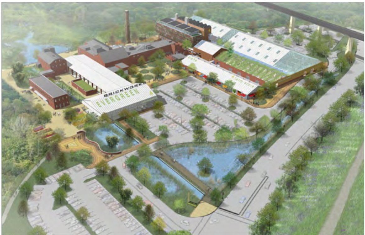
Figure 10. Overall Brick Works development proposal

Evergreen Brick Works is the winner of a 2008 Holcim