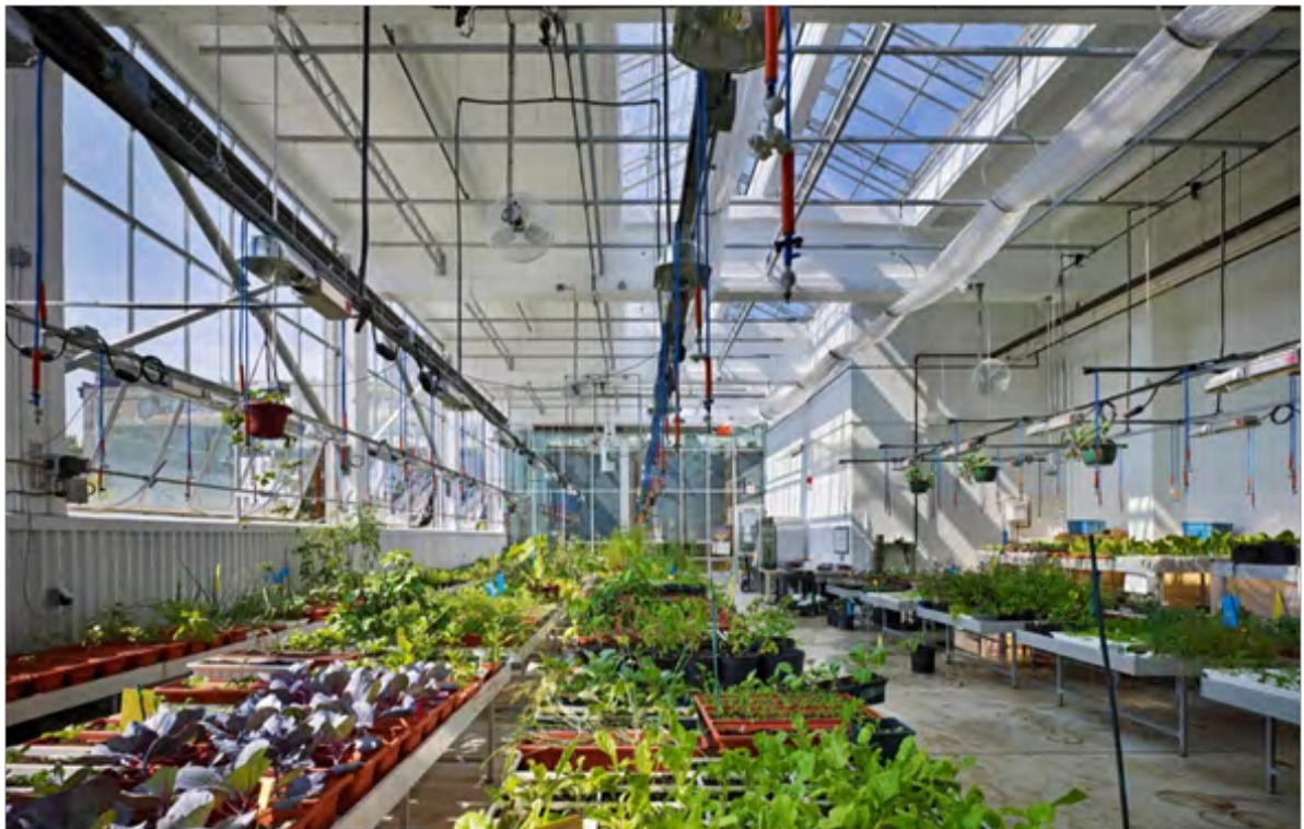
Figure 2. The Stop Greenhouse

The proposal from The Stop stimulated thinking about the redevelopment within an overall framework of community use, the arts and the environment, combining to create a new kind of community centre, and together with strong interest expressed through other aspects of the public engagement process, helped to ensure that sustainability became a major design theme as the project moved forward.