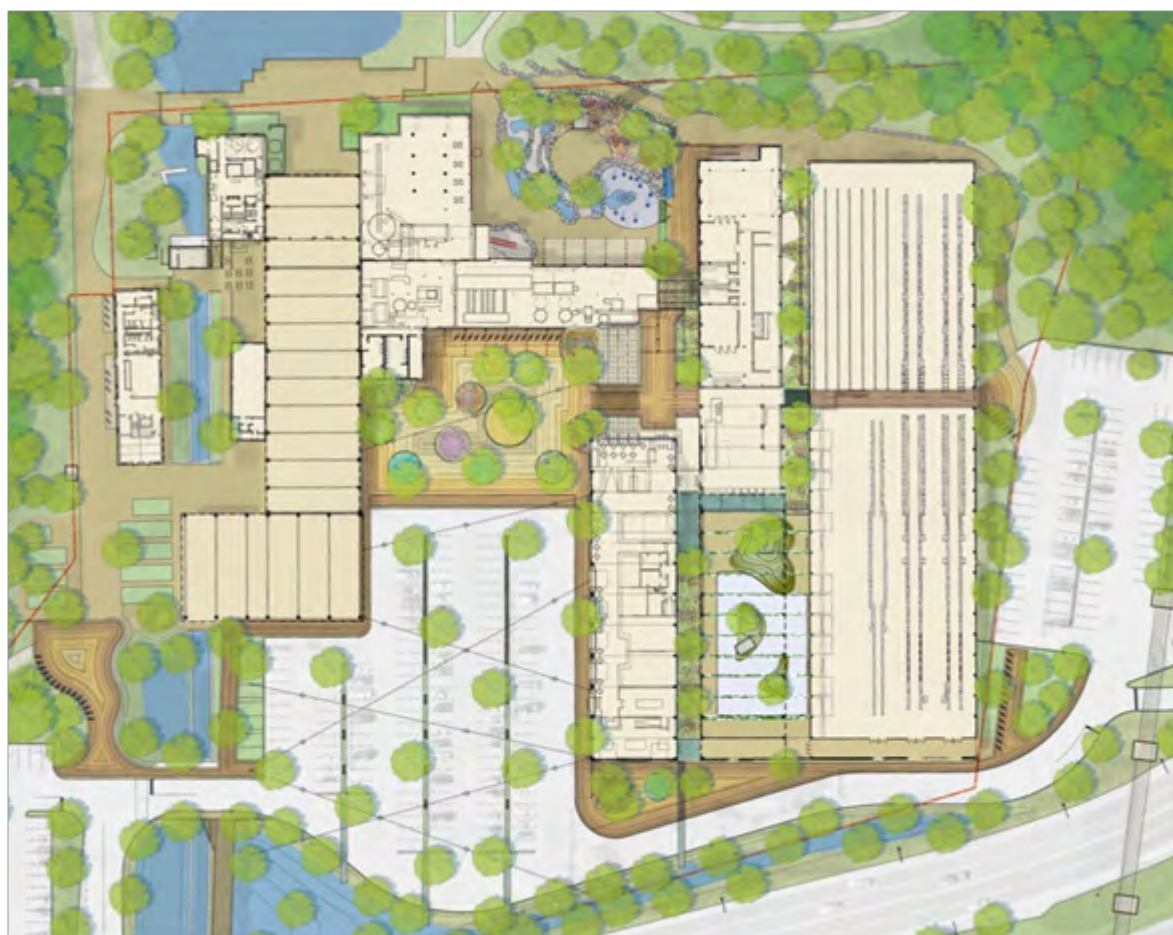
Figure 8. Overall Brick Works site plan

Given Evergreen's vision and our increasing collective realization that the greenest building is often the one that already exists, it seemed natural to ensure a design focus on adaptive re-use, rather than an emphasis on new buildings in a field of ruins, as had been suggested in an earlier master plan for the property.