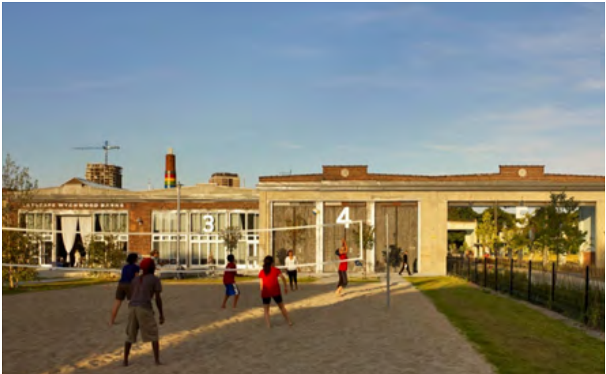
Figure 3. View from the park towards the west face

After much debate within the community and within City Hall, the project was approved as recommended. Municipal government funding was obtained for the development of the park, and Artscape was provided