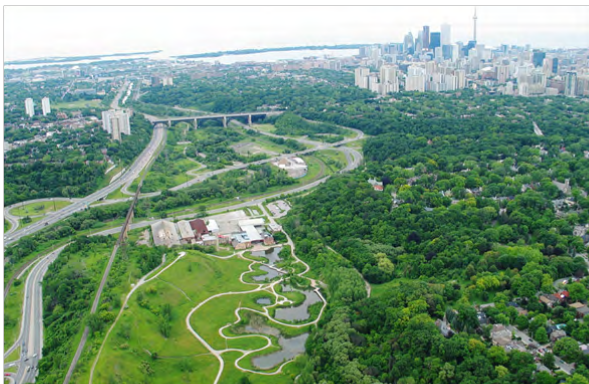
Figure 7. View of Brick Works in context of downtown Toronto

had established nation-wide programs like ‘Learning Grounds’, which seeks to transform the prison like surroundings of so many of our school yards into something more green, more sustainable, and certainly more educational. The organization’s founder and executive director, Geoff Cape, saw the potential in this collection of abandoned buildings to serve as a new home for Evergreen and like-minded organizations; to create a great meeting place, a kind of village on this site of splendid isolation in the midst of the city, where people of all ages could come together to explore the relationship between nature, culture and community, and the future of our cities, and where the project to rejuvenate the factory site itself, could serve as a demonstration of a way forward.