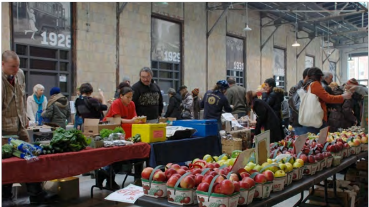
Figure 5. Farmers' market in the covered street

The artists' studios and live/work apartments are teaming with creativi-ty, the offices in the Community Barn are full of people thinking about how to make a better city, the children's theatre hosts capacity crowds to witness imaginative performances, the covered street plays host to events, conferences, parties and encounters only vaguely imagined during the design process, the farmers market has become a weekly neigh-bourhood institution, and the green barn produces fresh produce for distribution across the city and provides a forum for sharing food and discussion around health and well being and what it means to be living in one of the most culturally diverse cities in the world. The debates around the value of retaining these heritage structures in the midst of this lively neighbourhood park seem a distant memory – life has returned to these buildings and they have provided a unique and accommodating stage upon which the history of this community continues to unfold.