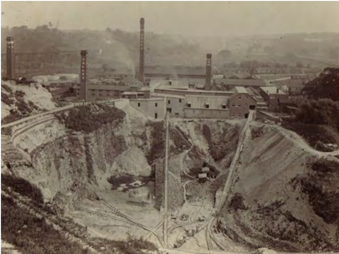
Figure 6. Historic view of quarry

The Don Valley Pressed Brick Company was established in the latter part of the 19th century on a ravine site in Toronto near the Don River, rich with the clay and shale essential to the making of high quality brick. To-day located in a floodplain at the confluence of Mud Creek and the Don River, the site was once thought to be covered with the mouth of an ancient