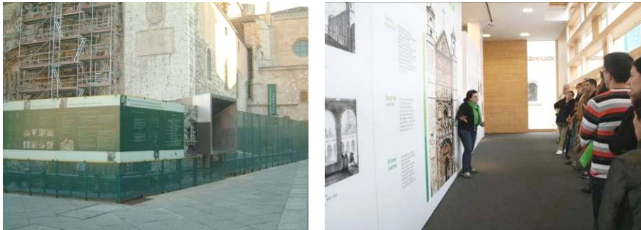
Figs. 4 and 5. Informative work area enclosure and the Interpretation Centre