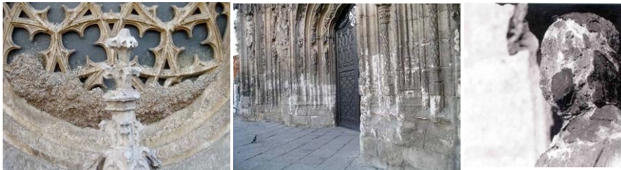
Fig. 3. Detail of pathologies of the façade: accumulation of pigeon guano, presence of salts due to spreading damp patches, loss of sculpted material

In the middle of the 20th century the façade was in a deplorable state of conservation. During the 60s and 80s interventions were effected on it, but time has served up a devastating verdict on them, since those actions caused new damage that hadn't existed up until they were performed, much of it caused by overconfidence in the chemical products popular at the time. To this must be added a whole series of easily identifiable historical problems, such as the erosion of mortar, deformations, appearance of fissures, breakages, construction pathology, the presence of damp, notable volumetric losses and loss of sculpted material, successive sandblasting and collapse, condition of patinas, exposure of surface salts, pathologies of a vegetal or animal origin, algae, fungus and lichens, microbiological agents, alterations to the original material, protections and dressings, products producing alterations, the presence of cement mortars, wedges of different materials, staples, rusts, stitches, reconstructions, etc. (Fig. 3). All these factors that have affected the building over a prolonged period of time have given rise to the deplorable state that the façade was in when the cultural restoration project began.