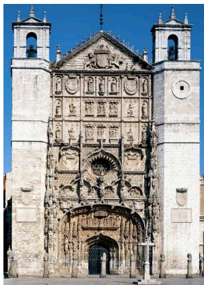
Fig. 1. Detail of the San Pablo church façade

of Burgos, chaplain and confessor of Isabel I, the Catholic Queen, who reconstructed the convent and the lower half of the main façade in the Hispano-Flemish gothic style at the end of the 15 th century with designs by the architect Simon of Cologne. The Duke of Lerma and the preachers completed the present façade and church (Fig. 1) in the first two decades of the 17 th century. During the War of Independence (1808-1814) the Napoleonic troops seriously damaged the complex, just as the Disentailment of 1835 later brought about the toppling of the already battered convent premises. In the 20 th century the church suffered a fire and several restorations. (Fig. 2)