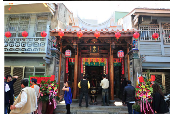
Figure 2. Shop houses and temples in Tainan's street.