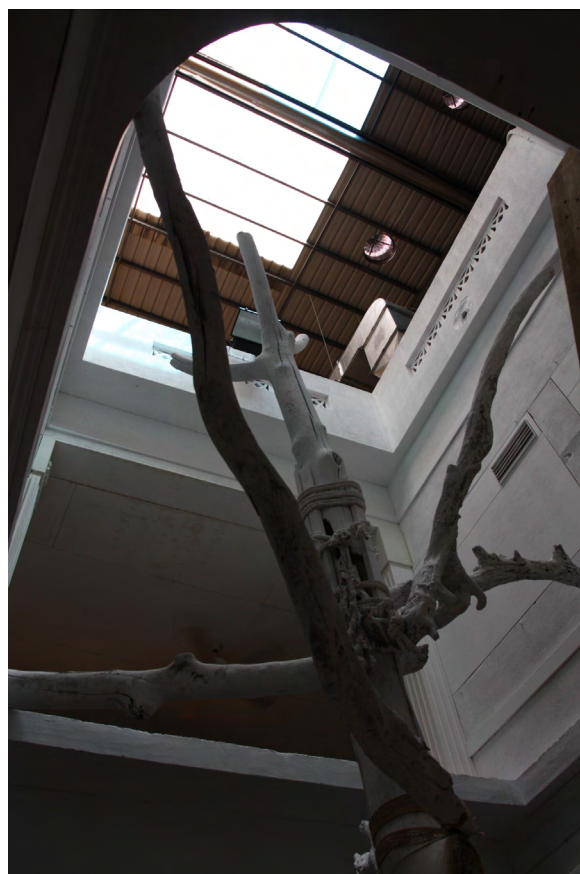
Figure 3. Cases of the “Old House with New Life”