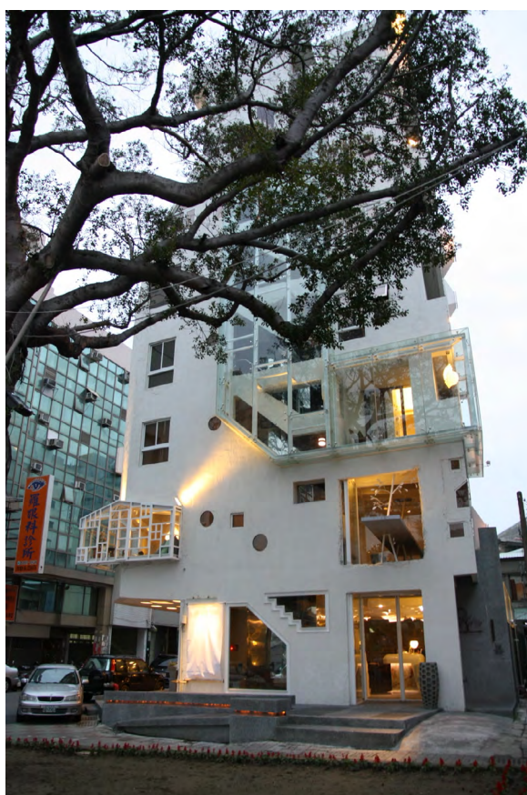
Figure 6. One case of "Old House with New Life"

Since the promotion of the "Old House with New Life" concept by FHCCR in 2008, an amazing design method that intervened with the old house became a new pattern for space reuse. Moreover, Tainan's unique city atmosphere formed a special kind of spatial atmosphere. In the process of spatial development in Taiwan in the 1990s, the "Eslite Bookstore" took Taiwan by storm through its simple Taipei metropolitan style. Hence, the "Eslite Bookstore" was developed into a specific type of consumer identity and cultural identity. The "Old House with New Life" concept formed with Tainan City as the basis has gradually been transformed into a reformed space in appearance, which has been extended to other cities. Compared to the "Eslite style" that features the commercial and elite characteristics, the "Old House with New Life" conceived in the south has had the chance to return to the "ensconced" essence of life. After this cultural project became a growing trend, it was more important to rethink about the fundamental spirit.