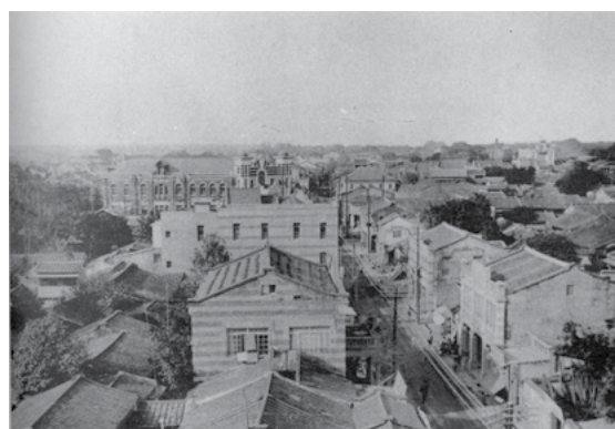
Figure 1. Tainan's street scene during the Period of the Japanese Occupation.

The expansion of the city beyond its former boundary had made possible the provision of new urban facilities and the development of a modern city. However, the employment of western gridiron road system with circles at nodal points did great harm to the existing urban fabric. Public buildings and the new generation of street houses were soon built according to the new city plan, leaving behind the main streets former urban fabric. Governmental buildings were built according to western classical architectural norms giving a sense of austerity, modernity, and ruling authority. In the meantime, quite a few churches were constructed in this period helping create a specific townscape in certain areas.