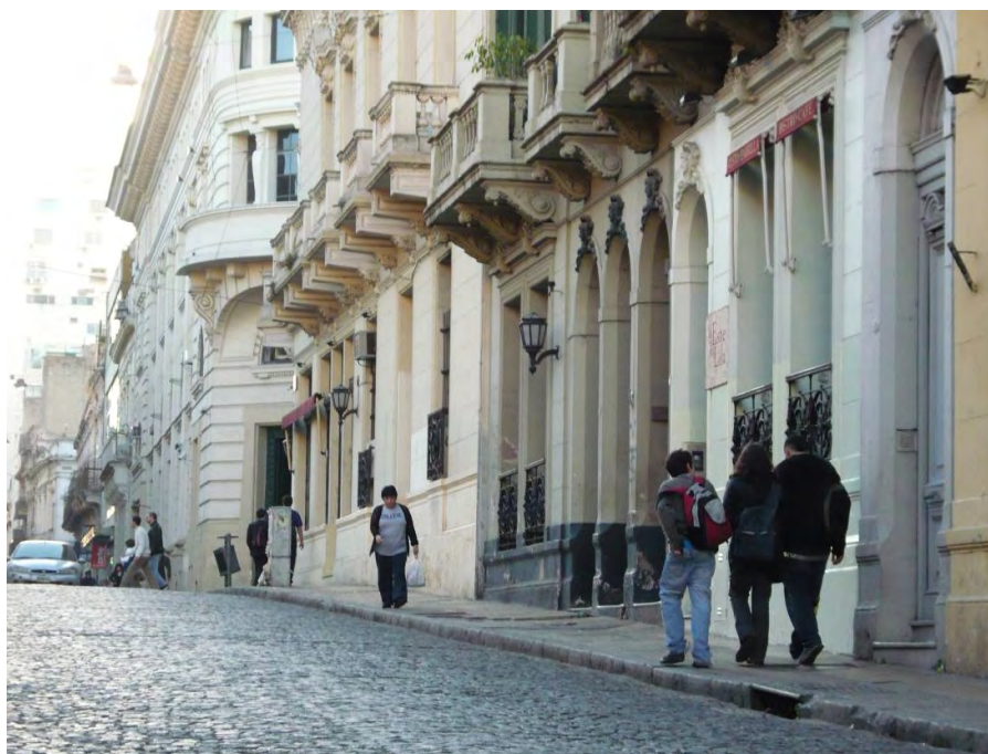
San Telmo Neighborhood