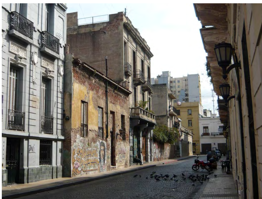
San Telmo Neighborhood