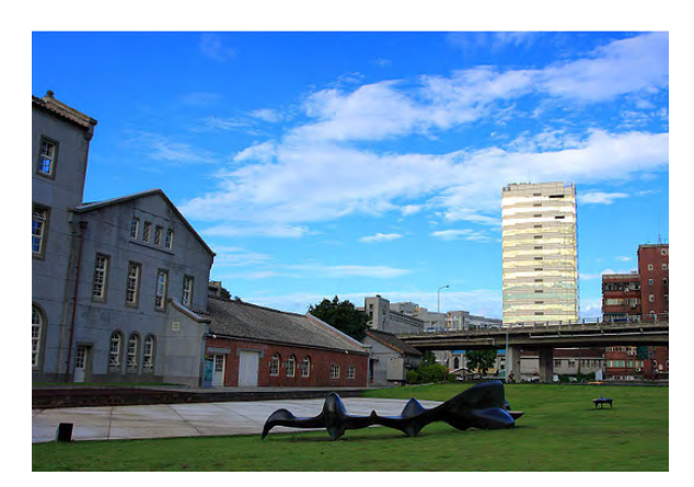
Figure 8. Present situation of Huasan cultural & creative park

The values and authenticity of an industrial site may be greatly reduced if machinery or components are removed, or if subsidiary elements which form part of a whole site are destroyed (The Nizhny Tagil Charter for the Industrial Heritage, 2003).