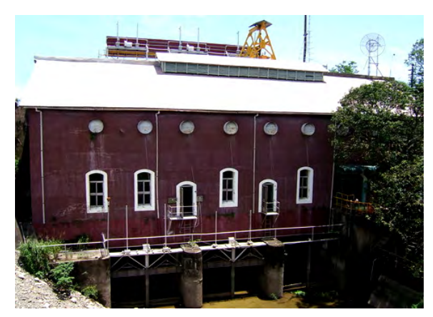
Figure 6. The hydraulic power plant is a "living" industrial heritages.