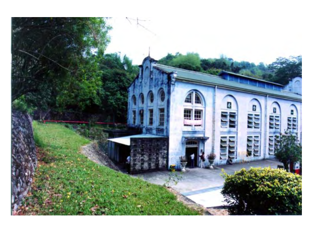
Figure 3. The hydraulic power plant in southern Taiwan

Besides, different policy in different time also influenced the industrial development of Taiwan. Before 1930s, it was influenced by the policy of "agricultural Taiwan, industrial Japan" that more emphasis on the sugar industry. After 1930s, the policy changed as "industrial Taiwan, agricultural southern east Asia", and the further and integral industrial developments were planned and carried out (Yeh, 1995). Besides the infrastructure, such as the roads, railways, power plants, tap water supply systems, the colonial government also invested different industrial factories. The sugar factories, breweries, rice husking factories, cement factories, can factories, and etc. were built. These factories would be functioned as the tools which exploited the natural resources of the colony, and the process of the modernization and industrialization would further extract the maximum economic resources of the colony. Before the end of the World War II, Taiwan had become the most important industrial base within the colonies of Japan.