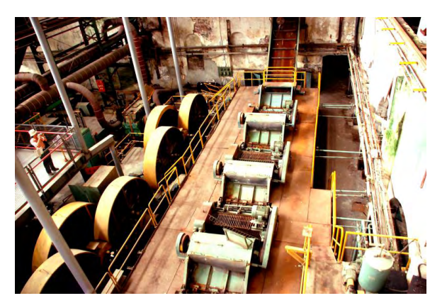
Figure 7. The Sugar Industry Museum in Ciaoto

Before the amendment of the Cultural Heritage Preservation Act in 2005, the buildings with heritage values would be only preserved by designation of the "monuments" or registration as the "historical buildings". The industrial heritages were not included as the main category. After the amendment, the industrial facilities, industrial landscapes, transportation landscapes, and irrigation facilities were finally included.