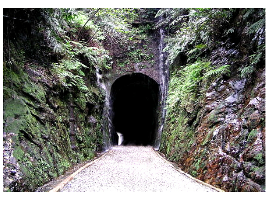
Figure 1. The train tunnel built by Liu Mingchuan.

Before 1860, Taiwan was still the traditional farming society inherited from China. The most important export goods were sugar, tea, and the camphor; others are the processing industries goods also from the agricultural sectors, such as leather boxes, straw mat, silks and satins. (Lin, 1997). After 1860, due to the reduced restriction of the international trade, besides the original light industries, heavy industries were also established (Taiwan Governor General Office, 1920). Another important change was the first governor of Taiwan from Qing Dynasty, Liu Mingchuan (reign 1885-1891), who introduced lots of the important industrial development, and was seen as "pioneer of the capitalism of Taiwan" (Yanaihara, 2005). In that period, lots of investment and construction carried out on different aspects, such as the defense, finance, aborigine, transportation and the industry (Chen, 2004). This is the first time of the large scale modern industrialization for Taiwan. Some of the buildings and structures were still preserved today, such as Shih-Chiu Hill Tunnel for train, and the ruins of Industrial Bureau of Qing Dynasty*. In 1895, Taiwan became the colony of Japan.