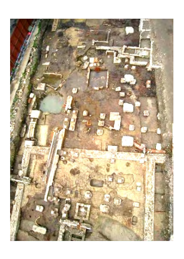
Figure 2. The machine Bureau vestiges of Qing Dynasty.