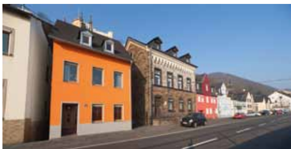
Picture 36 - unadapted colours disturb the harmony of the street near Koblenz (DE)