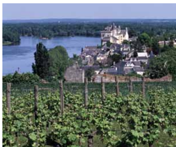
Picture 56 - the Val de Loire cultural landscape : a fusion between nature and culture, heritage river fronts and large vineyards areas over the hills of the river

This added value, conferred by taking into account cultural landscapes, requires networking among all the public and private decision-makers, as well as the involvement of the inhabitants and stakeholders. The Management Plan provides overall guidelines that couple commercial interests – and those of winegrowers in particular (merchants and producers) – with the objectives of safeguarding the cultural, environmental and landscape values of a territory, all goals defended by the inhabitants.