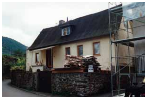
Picture 30 - Residential building of Family Müller in Oberwesel (DE) before renovation

To strengthen the dwindling settlements and in particular the village centres, an expansion of development areas should be avoided. To prevent increasing land and landscape consumption by new construction areas, settlement development should be focused on internal development. Measures to strengthen and enhance town and village centres may be the conversion of buildings, technical and financial incentives, the reorganisation or mere restoration of public spaces or different planning tools. These measures should be adequately framed by a creative planning process. The set of options for conversion of now void and functionless buildings is wide. The conversion of former agricultural buildings into private buildings (housing, private business etc.) or communally used buildings (village hall, museum, multigenerational houses, club houses etc.) and vice versa is conceivable. But, at least the characteristics of the former function, as well as the main features of the building should remain visible.