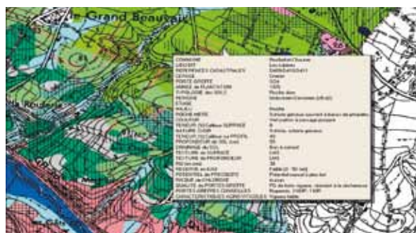
Picture 21B - Digital terroir atlas