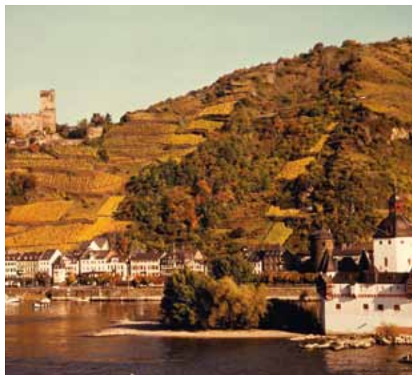
Picture 60 - A heritage landscape restoration project that is underway in the Upper Middle Rhine Valley