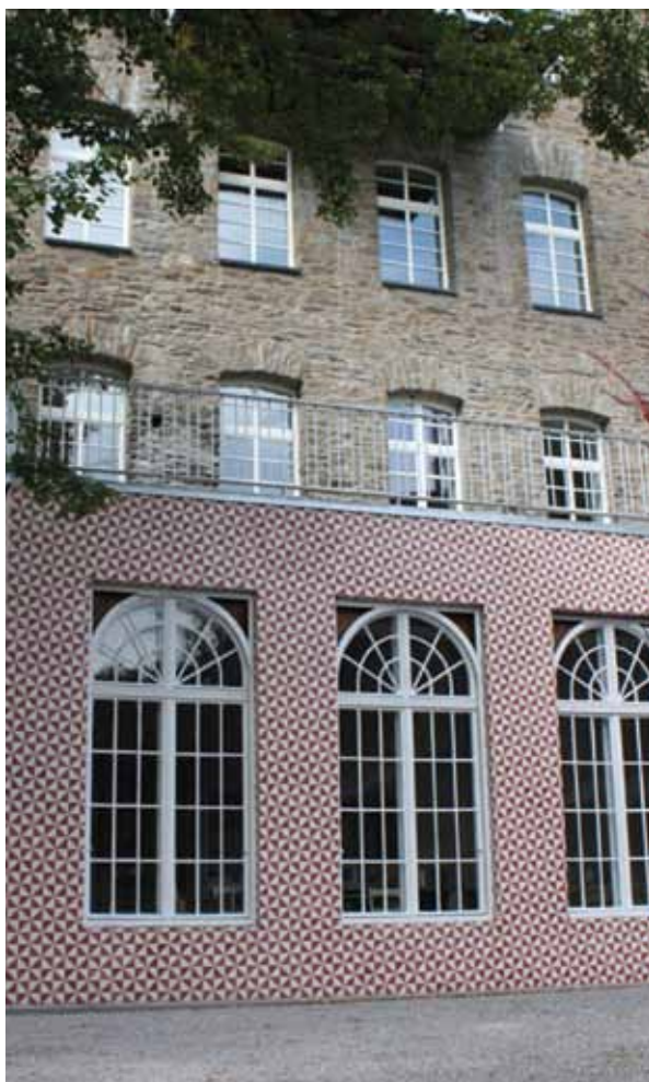
Picture 42 - Additional building of former slate mine building in Kaub (DE)