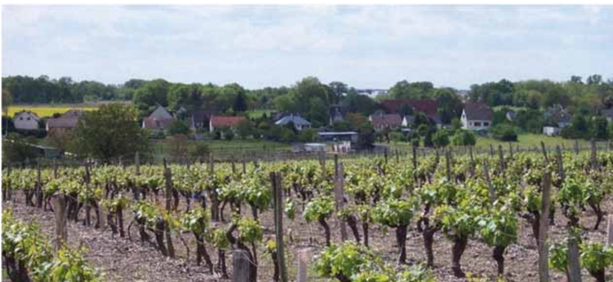
Picture 20 - Different usages contest with each other in Val de Loire (FR)

All the actions are made through collaboration between the Italian Ministry of the Environment, the Ministry of Culture, Corpo Forestale dello Stato, and private associations, with the aim of supporting those still remaining, generally speaking older winegrowers, and to encourage young people to start new winegrowing enterprises. Among the results are the "Guidelines for interventions on rural buildings and dry stone walls". At the same time, financial support schemes and training schemes were developed. Positive results can already be seen: Young people are coming back to the area and starting commercial activities there. In addition, the abandonment of the winegrowing landscape may at least be slowed down and in many cases even stopped and inverted.