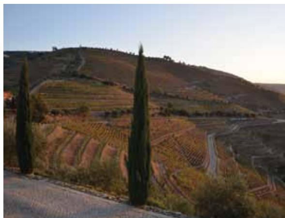
Picture 45 - The style of the Douro vineyards, with tarmac walls and roads, Douro (PT)

All these complications in mobility and accessibility