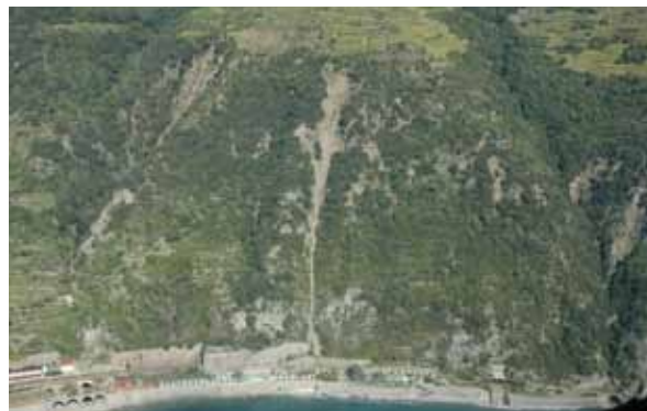
Picture 24 - Abandonment and resulting landslides are mainly located in the less accessible areas (IT)

Also, in recent years, a new type of awareness has emerged, according to new requests from the market and opportunities for public funding. Agriculture is becoming