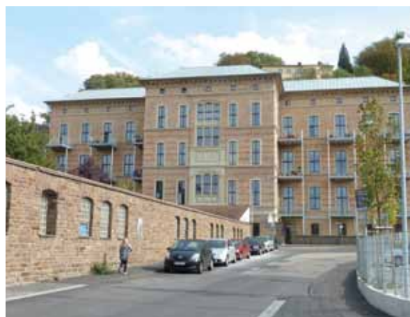
Picture 33 - Same building after conversion. Now 18 modern lofts offer modern living in old walls