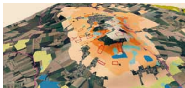
Picture 21C - An example for a GIS rendering: The terroirs of Savennières (FR)