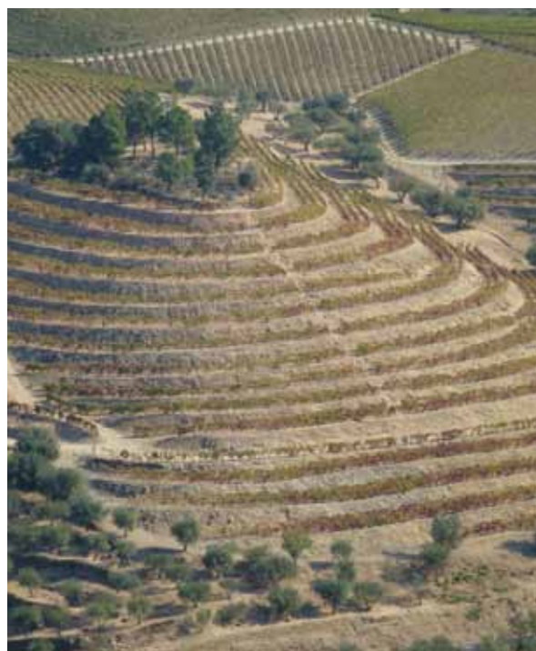
Picture 57 - Landscape architecture in the Alto Douro: optimising wine production

Finally, the major wine production regions (Val d’Orcia-Montalcino, Upper Douro, Tokaj, Val de Loire) do not have the same priorities as sites where wine production has a greater emblematic heritage value than a determinant economic value (Pico Island, Cinque Terre Park). In the first instance, landscape management will have to settle conflicts arising from the profitability of the winegrowing sector versus the requirements of heritage landscape conservation, whereas the key issue for the other sites will be to search for alternative agricultural resources to counter the abandonment of land use and of vineyards.