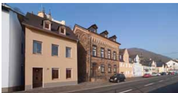
Picture 37 - In terms of colour less is oftentimes more (computer animation)

The overall impression of a building and its surroundings is not determined only by its structure, building material and colour. There are a lot of other elements, smaller and bigger ones, which contribute to the visual harmony of the whole.