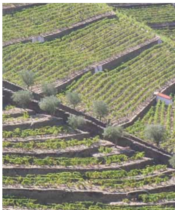
Picture 58 - Landscape architecture in the Alto Douro: a constant search for equilibrium between preserving a heritage landscape

These forms of governance, which differ depending on the economic stakes involved in wine production and in the institutional and administrative cultures, agree on one observation: the need to take into account the landscape heritage so it becomes the unifying thread that determines the economic future of such territories.