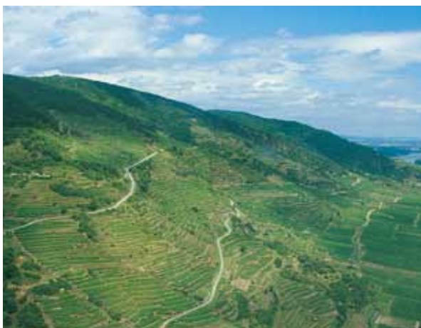
Picture 15 -The Loibenberg (AT) has stayed constant in winegrowing area since the 1970ies