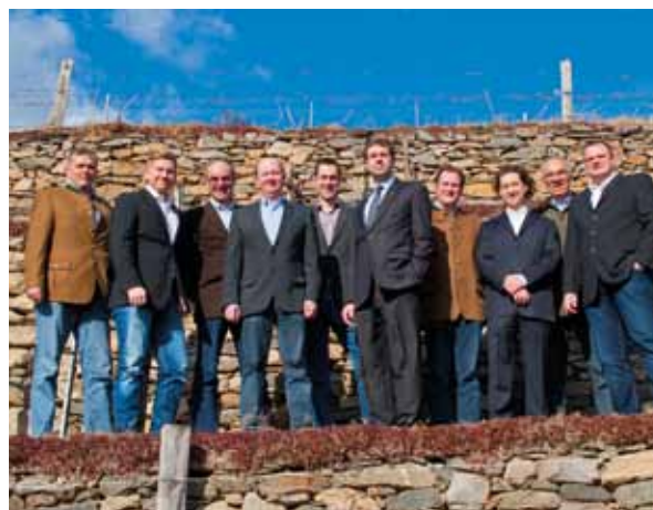
Picture 16 - The current board of Vinea Wachau (AT)