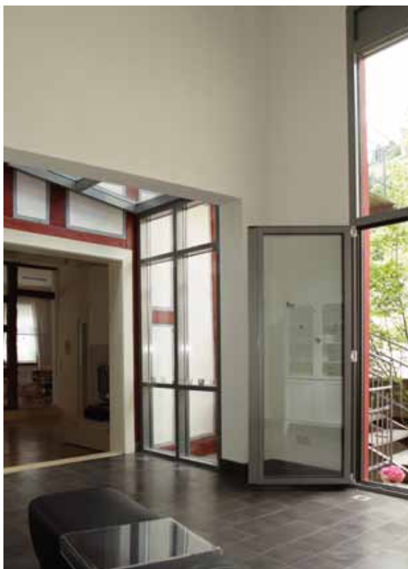
Picture 43 - Combination of old and new constructions in Bacharach (DE)

This good practice describes the preparation of a guide for the rehabilitation of the rural buildings in the Cinque Terre National Park. This form of heritage is one of the most threatened in the Cinque Terre National Park, due to various factors, i.e. the abandonment of agricultural activities, the transformation into second homes for leisure purposes and the loss of building skills. The park administration is pursuing a policy primarily aimed at safeguarding the terraced landscape, whose fragile balance has been compromised mainly by man's abandonment, and this project is part of the framework of the activities promoted by the park administration itself. The guide, based on preliminary research on the rural built heritage of the park, proposes technical solutions for appropriate repair and adaptation to modern needs. The guidelines were published at the end of 2006 and it is expected that they will become part of the park regulations. Coupled with the preparation of the guidelines, a pilot project for the integrated rehabilitation of a rural settlement in the mid-hills above Riomaggiore has been developed, aimed at testing the validity and applicability of the guidelines as well as at providing the park with accommodation facilities for the participants in the courses and workshops given by the University of Landscape and other related initiatives management by park administration.