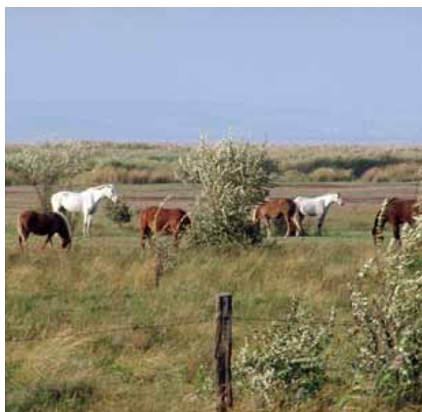
Picture 61 - The reintroduction of wild horses along the lakeshores of Fertö Neusiedlersee (Austria)