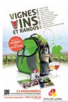
Picture 63 - As of 2005, the Interprofession des vins de Loire has been organising a weekend each year to explore vineyard landscapes. The routes are defined and coordinated by the vintners and welcome over 5,000 people, both inhabitants and visitors. Certain circuits are signposted and can be used all year round

We note a reinforcement of the mediation tools and the dedicated signposting strategies involving the inhabitants, who have become the ambassadors of their territory with respect to visitors. This local involvement plays a part in the renewal of the tourism offer: projects that link the exploration of the winegrowing heritage (vineyard landscapes, the constructed heritage, and know-how), the quality of accommodation and restaurants, and the networking efforts of professionals in tourism, winegrowing and the managers of cultural properties (châteaux, abbeys, museums, etc.).