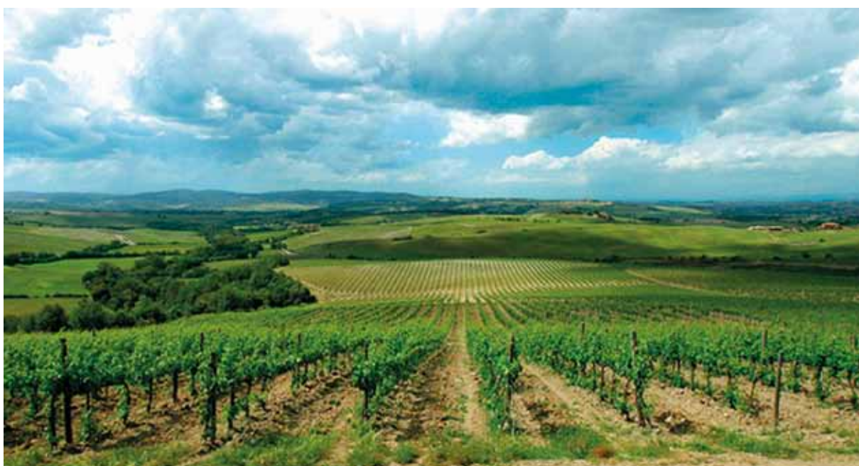
Picture 29 - Vineyards down on the hill of Montalcino