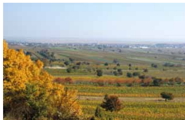
Picture 53 – Fertő– Neusiedler See (AT) inscribed in 2001