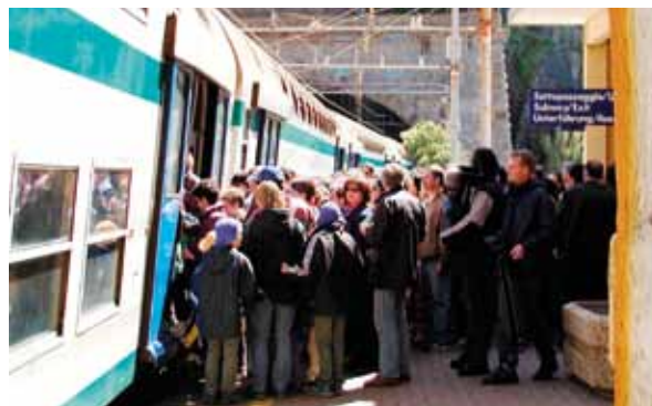
Picture 22 - Many tourists crowd the villages of Cinque Terre (IT) and the footpaths connecting them

These situations should be appropriately managed. While the local economic system has found new opportunities and has increased, the carrying capacity of these special environments should be analysed and evaluated, so that their integrity is not compromised.