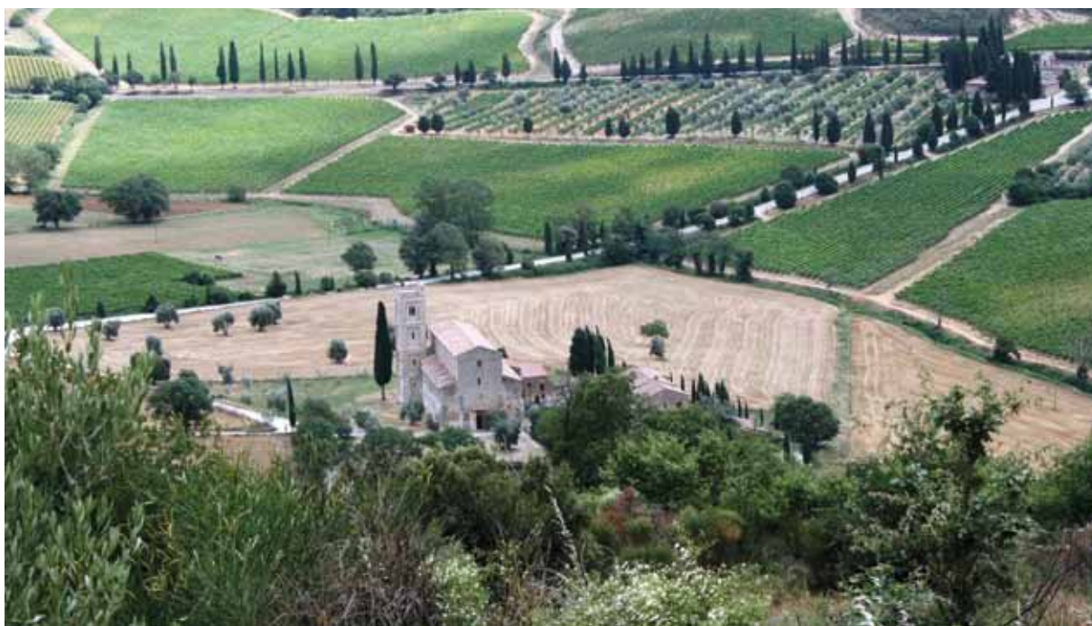
Picture 28 - Vineyards and olive groves around Sant'Antimo Abbey in val d'Orcia