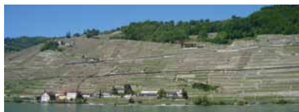
Picture 25 - The monocultural "wall" of the vineyards of Lavaux (CH): natural dynamics and settlement rules decrease the risk of landscape trivialization

much more a multifunctional producer of positive environmental externalities as farmers begin to understand the importance of organic farming and direct selling of their products as well as providing hospitality to visitors. All these ongoing dynamics could help to avoid risks of landscape trivialisation or desertification.