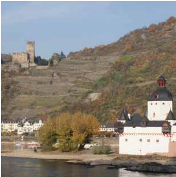
Picture 59 - Renewed cultivation of the abandoned vineyards at Kaub (Fortified castle of Gutenfels)