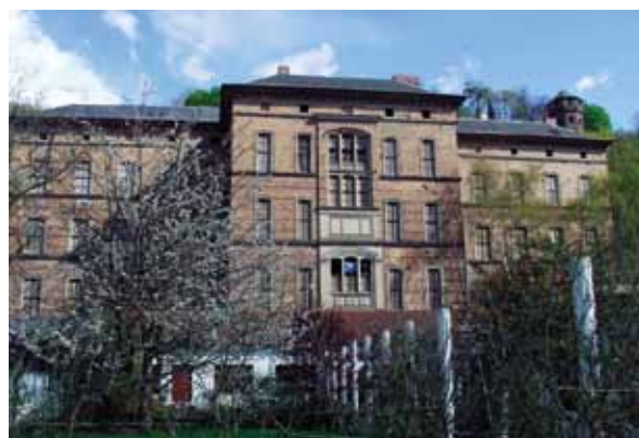
Picture 32 - Martin Gropius Building in Koblenz before conversion. Initially built as military hospital it closed down in 1988