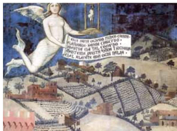
Picture 49 - The Allegory of Good and of Bad Government – Scenes from the frescos by Ambrogio Lorenzetti between 1337 and 1340 at the Palazzo Pubblico in Siena, Italy

What is the appropriate governance for a vineyard cultural landscape? The Val d'Orcia, which was inscribed on the World Heritage List in 2004, provides an exceptional testimonial in this respect. This agricultural hinterland of Siena – redrawn and redeveloped during the 14th and 15th centuries when it was integrated into the City-State's territory – allies the aesthetic qualities of a landscape with innovative agrarian systems. The allegory illustrates the effects of Bad government (famine, pillaging, violence, and poverty) and those of Good government (prosperity for the city, well-being, and harmony with nature). The paintings of the Sienese School that celebrated this landscape have come to exemplify the Renaissance, and they have had a profound influence on the way the landscape is regarded in Europe.