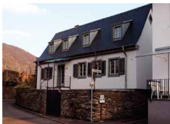
Picture 31 - Residential building of Family Müller in Oberwesel (DE) after renovation