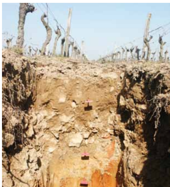
Picture 21A - Geo-pedological and mesoclimate studies to identify the vinegrowing potentials and constraints, at the plot scale