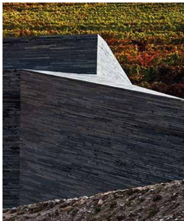
Picture 40 - natural material and modern shape are in harmony with landscape. Quinta do Vallado in Douro Valley (PT)

In many places, it is very important to find new roles for many old buildings, as well as to renovate them and give them imaginative forms of reuse. The Douro Architecture Prize was established in 2006, during the celebration of 250 years of the Douro Demarcated Wine Region, and is to be awarded every two years. Its subject is contemporary architecture, recently built in the Region, and aims to recognise outstanding examples built, effectively contributing to improving the constructive panorama of the Alto Douro region, so as to make architecture one of the most important components of excellence in the Douro cultural landscape. The objectives of the prize are to distinguish architecture work done since 2001 (when the Douro was inscribed in the UNESCO World Heritage list) as well as to improve contemporary architectural languages regarding heritage values, good integration of modern materials, the recovery of traditional forms of construction, renewal of public spaces, encouraging private owners to renovate their degraded façades and buildings. Finally, the aim is to promote, through qualified architecture, the Alto Douro as a tourist region and a cultural landscape that knows how to care for its heritage values.