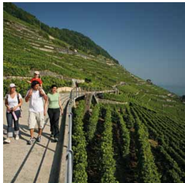
Picture 47 - The roads, facilitating the activity of the winegrowers, Lavaux (CH)

The purpose of these paths is to facilitate the exploitation of the area. The reorganisation of the plots aims to reduce the fragmentation of the land by merging the plots belonging to the same owner, in order to facilitate the activity. This operation, combined with the work linked to rural engineering, requires the establishment of a syndicate involving all owners of a given