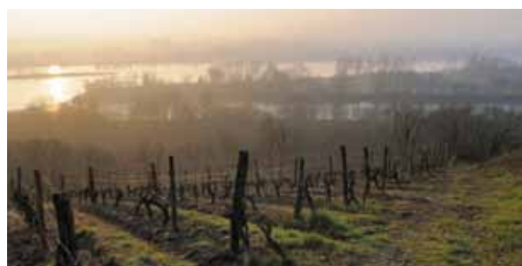
Picture 55 - La Coulee de Serrant: one of the famous expressions of the cultural landscape of Val de Loire

safeguarding it from urban sprawl or 'scattering', from agricultural abandonment and, above all, promoting environmentally-friendly cultivation practices as the guarantee of quality production. The ecological management of land, the architectural quality of buildings, and taking the landscape qualities of the terroirs into account have all become economic arguments used to defend a European winegrowing sector that is increasingly confronted by fierce competition from the winegrowing industry in the New World.