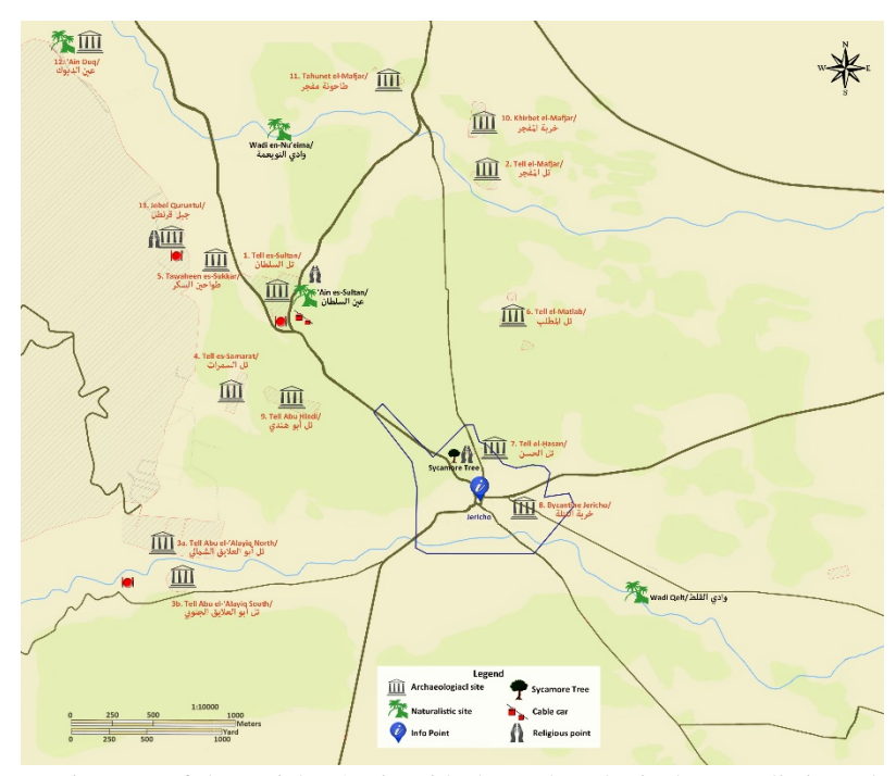
Fig. 2 - Tourist map of the Jericho Oasis with the archaeological, naturalistic and religious sites of the JOAP.