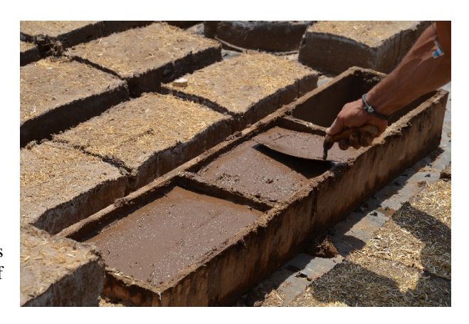
Fig. 15 - Making of mud bricks to be used in the restoration of Palace G.