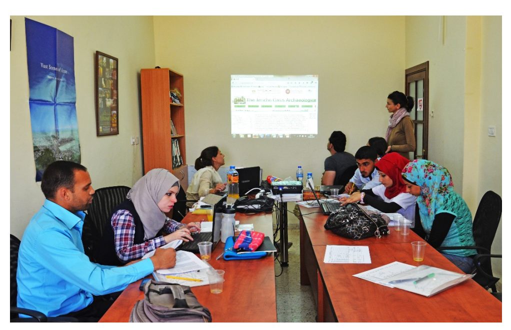
Fig. 6 - Students at work for JOAP panels realization.