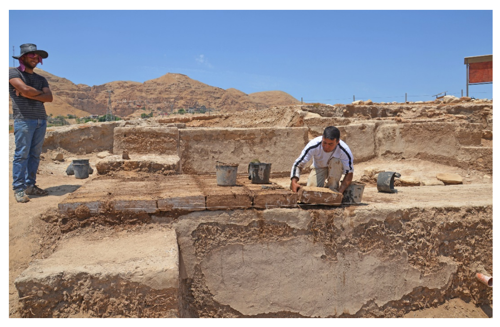
Fig. 21 - Training of a restorer laying bricks on the main wall of Palace G.