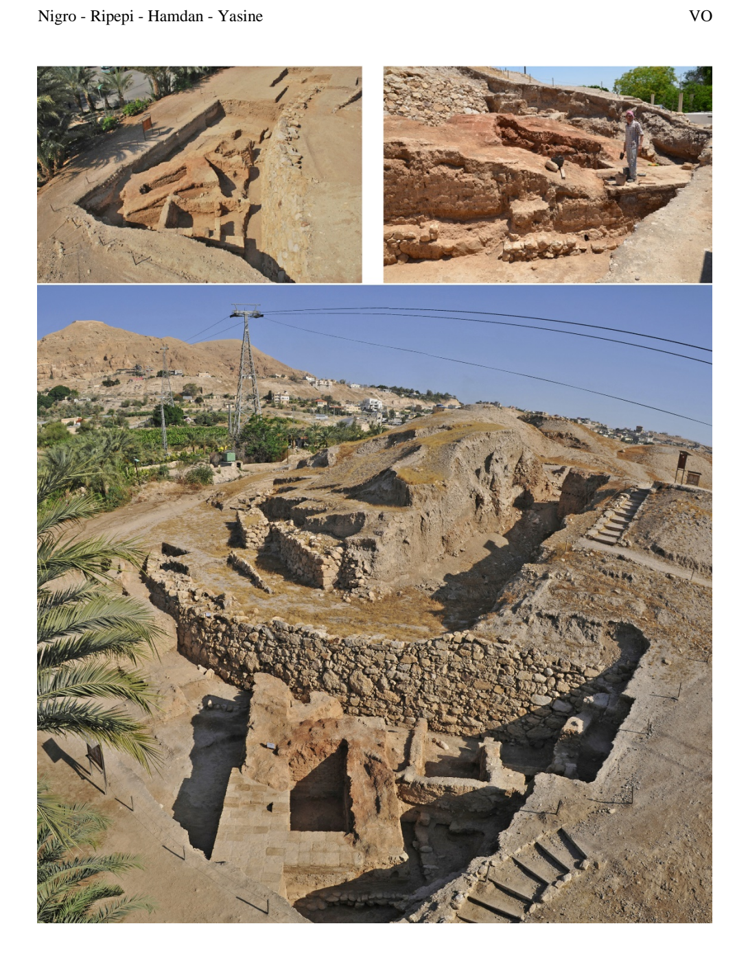
Fig. 14 - Tower A1 before, during and after restoration works.