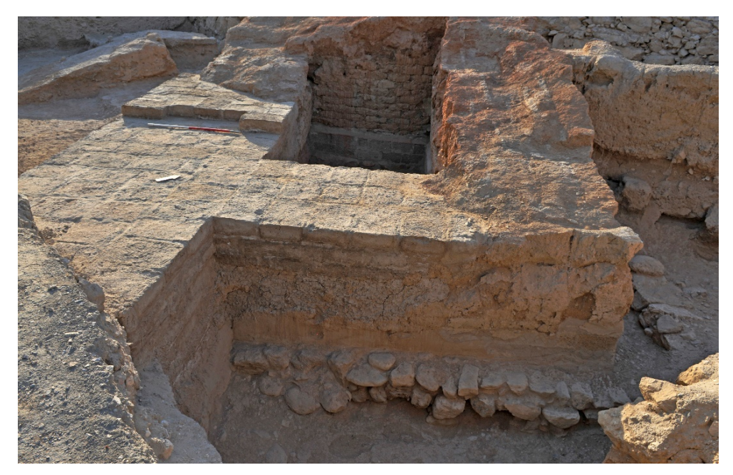
Fig. 18 - The sacrifice revetment layer around the basis of Tower A1.