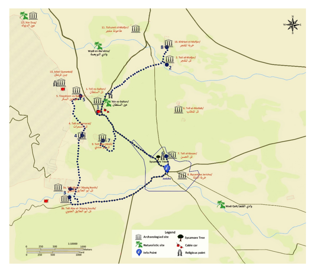
Fig. 11 - Archaeological Itinerary 1: "The Jericho Oasis in history". This includes: 1. Tell es-Sultan (JOAP n. 1); 2. Tell el-Mafjar (JOAP n. 2); 3. Tulul Abu el-'Alayiq (JOAP n. 3); 4. Tell es-Samarat (JOAP n. 4); 5. Tawaheen es-Sukar (JOAP n. 5); 6. Tell el-Hasan (JOAP n. 7); 7. Tell Abu Hindi (JOAP n. 9); 8. Khirbet el-Mafjar (JOAP n. 10).