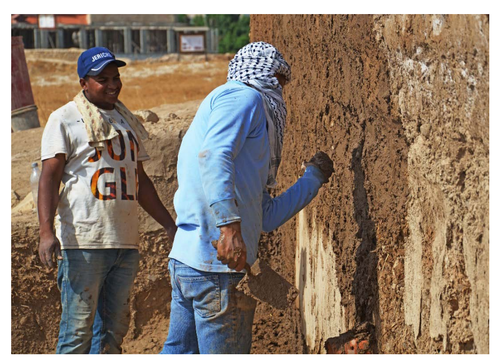
Fig. 23 - Specialized workers coating a mud bricks wall with traditional plaster.

The Jericho Oasis Archaeological Park - 2015 Interim Report