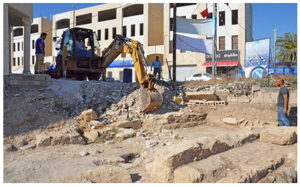
Fig. 8 - Cleaning works at Tell el-Hasan carried out in cooperation with the Ariha Municipality.