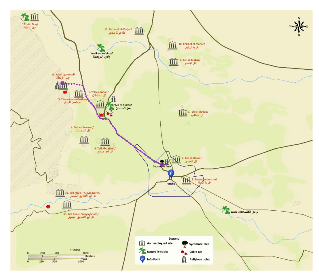
Fig. 13 - Religious Itinerary: "The walk of pilgrims". This includes: 1. Jebel Quruntul, Mount of Temptations and Monastery of Saint George (JOAP n. 13); 2. Sycamore Tree and the Russian Orthodox Museum; 3. The so-called "Fountain of Prophet Elisha" ('Ain es-Sultan) and Synagogue of Na'aran (JOAP n. 12).