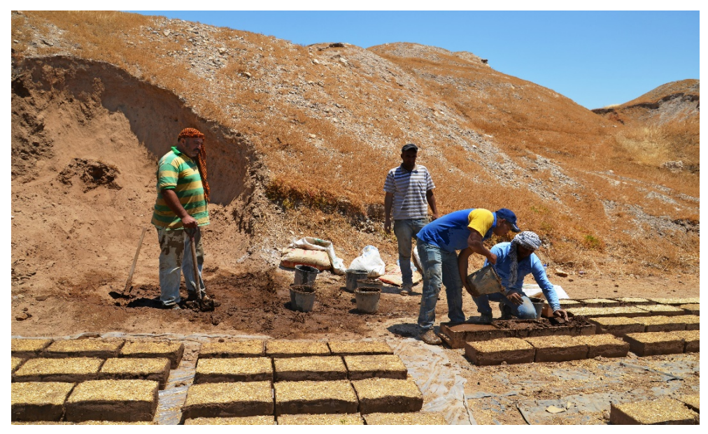
Fig. 28 - Mud brick architecture restorers during training.