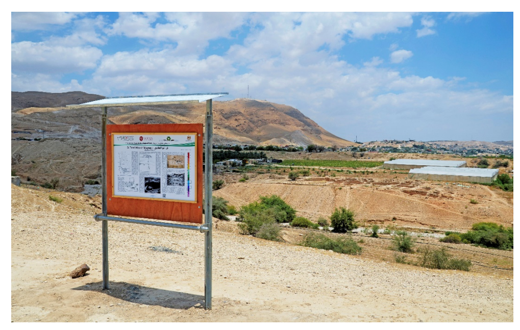
Fig. 7 - The panel at Tulul Abu el-'Alayiq overlooking King Herod's palaces.