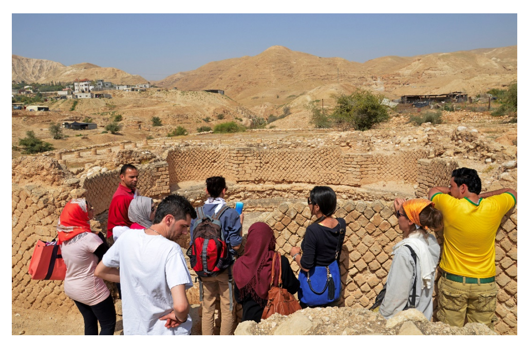
Fig. 3 - Students of the JOAP Guides School visiting Tulul Abu el-'Alayiq.

The Jericho Oasis Archaeological Park - 2015 Interim Report