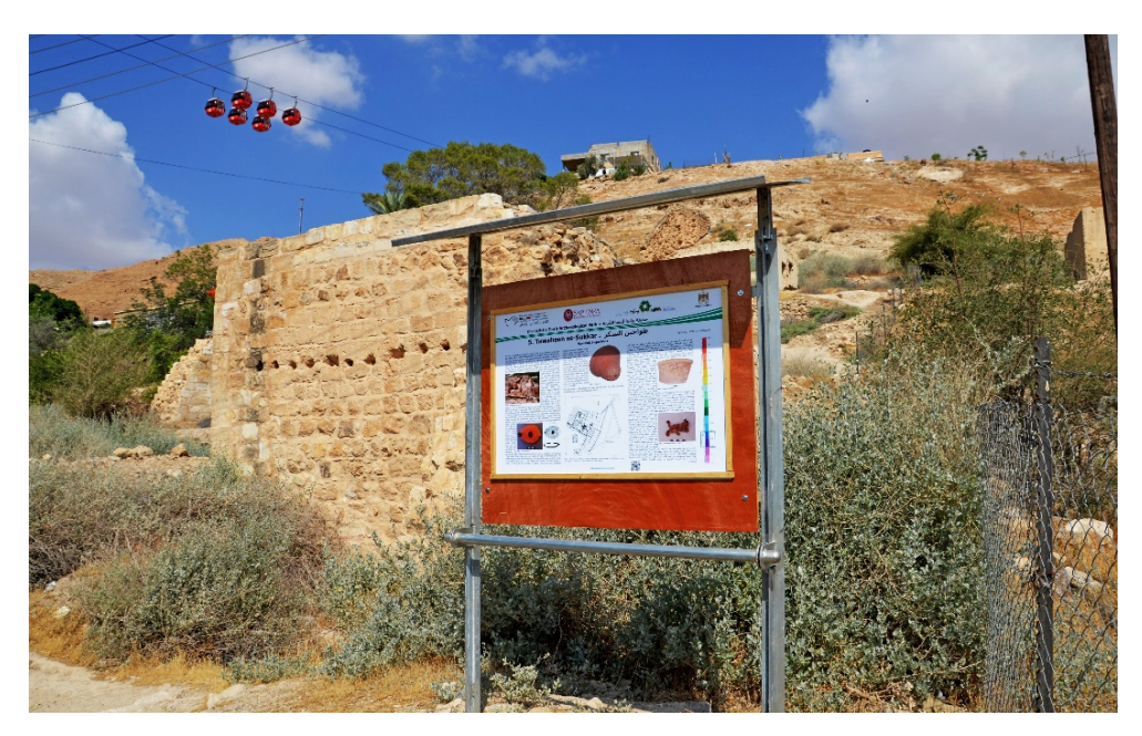
Fig. 10 - The explanatory panel installed in Tawaheen es-Sukkar.