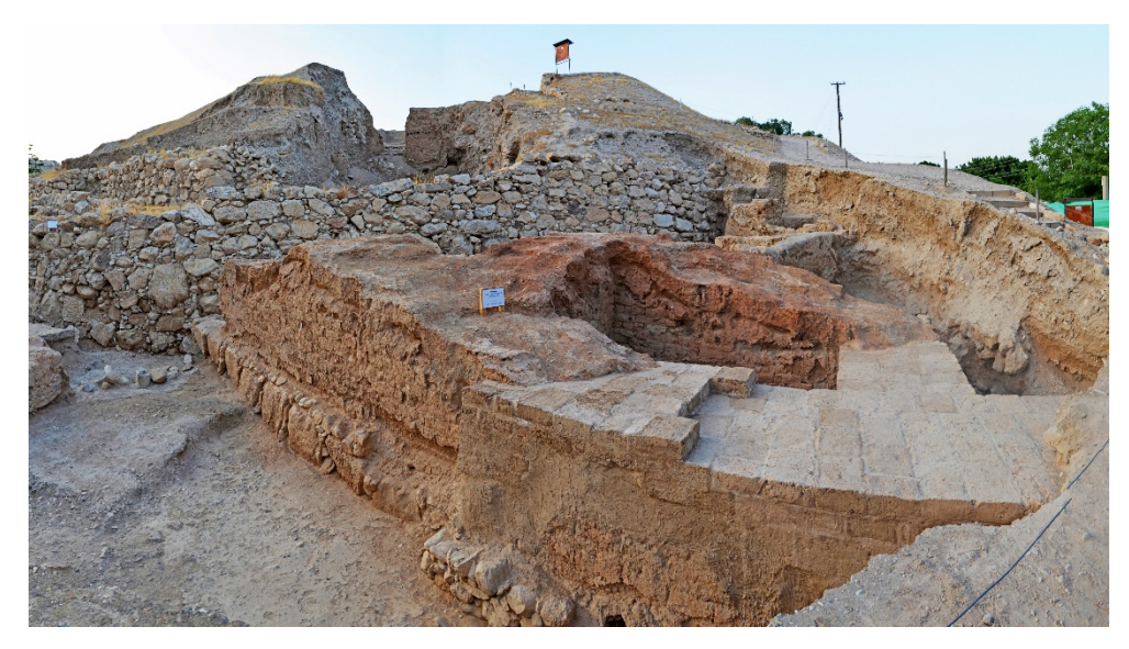
Fig. 19 - Tower A 1 after restoration with new tourist path and a signal giving its name and dating.

The Jericho Oasis Archaeological Park - 2015 Interim Report