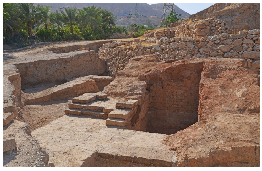
Fig. 17 - Bricks laid on Tower A1.