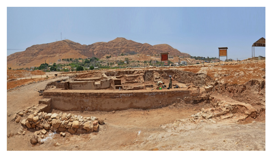
Fig. 20 - General view of Palace G after restoration works.