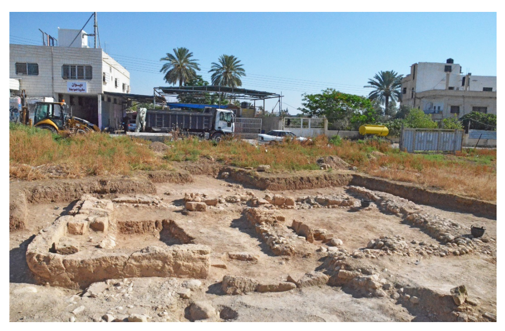
Fig. 9 - Tell el-Hasan, in the Ariha city center, after cleaning and rehabilitation works.