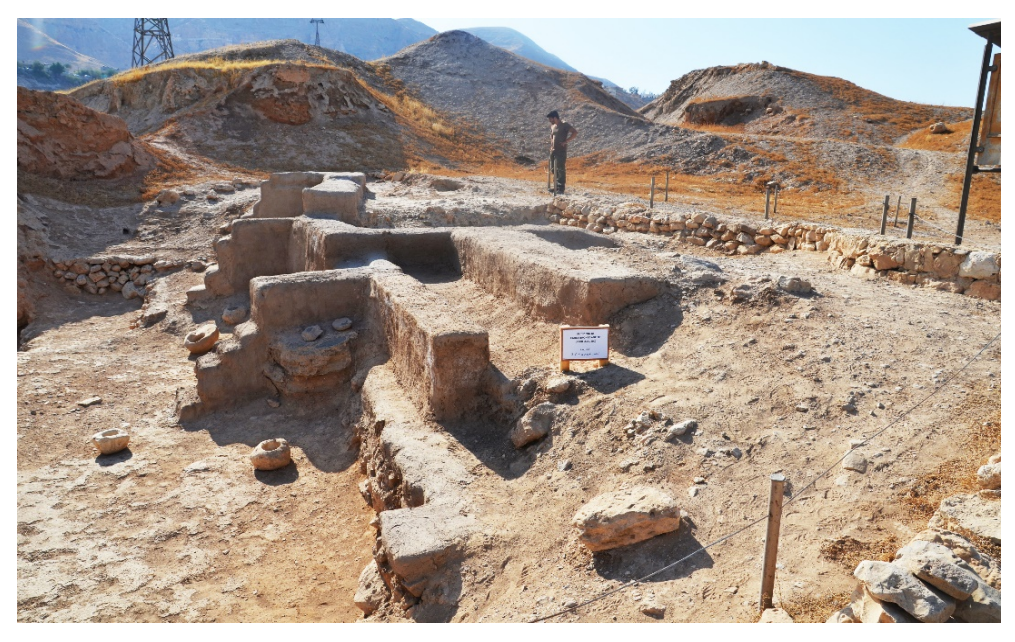
Fig. 25 - General view of Building B1 after rehabilitation with signal indicating name and dating of the monument.