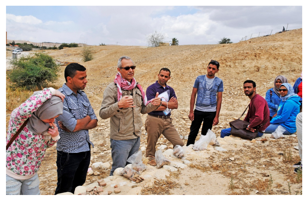
Fig. 5 - Study and classification of Chalcolithic pottery finds in Tell el-Mafjar.