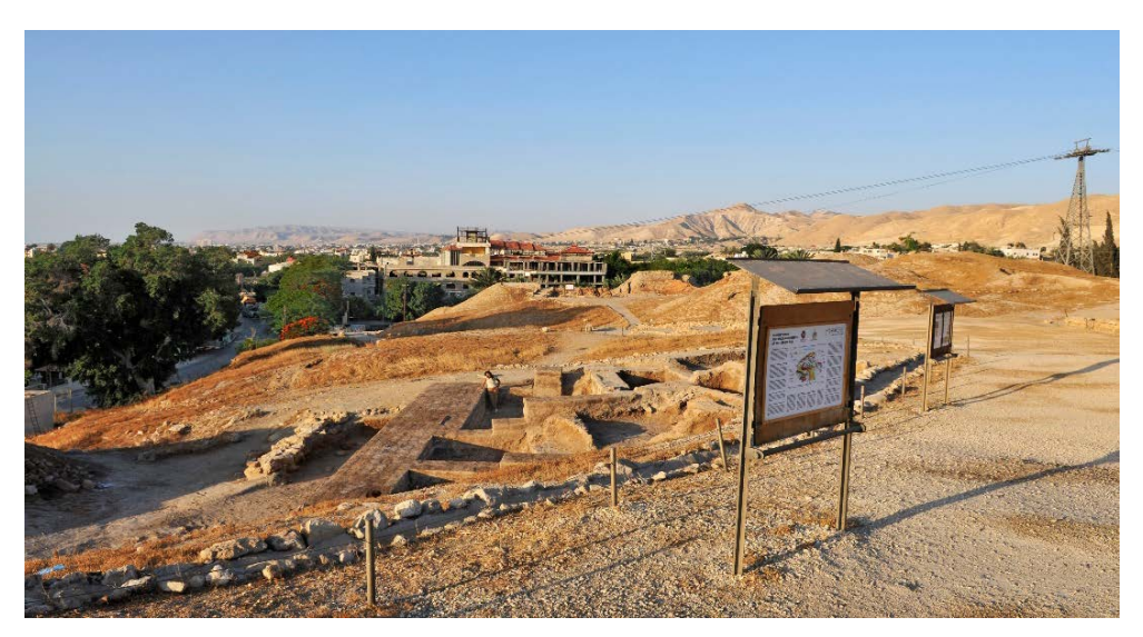
Fig. 24 - Rehabilitated area surrounding Palace G.