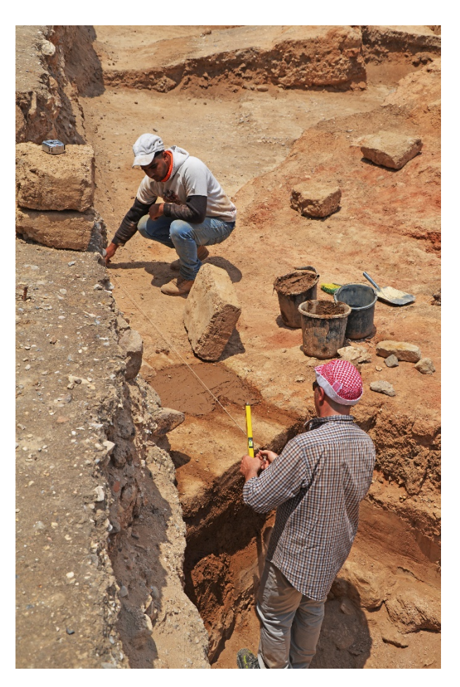
Fig.16 - Restorers preparing the mortar bed for the sacrifice layer of new bricks.