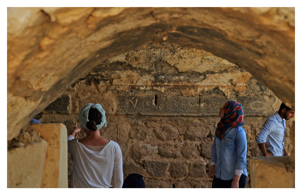
Fig. 4 - Students of the JOAP Guides School visiting Tawaheen es-Sukkar.