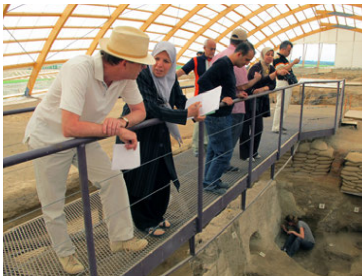
Babylon Committee members at the Neolithic site of Çatalhöyük, Turkey shared their concerns with its heritage managers.

management issues. SBAH and WMF were able to interact with site managers on an individual basis to understand the various assets and liabilities found at each site. Many sites were either recognized by UNESCO as a WHS or were in the process of getting WHS listing. At Çatalhöyük, Turkey the processing of identifying site significance was begun. This was continued in Beirut, Lebanon where both the SBAH and WMF worked together to compile a tentative list amendment and statement of significance for UNESCO based on the definition of Babylon as both a cultural landscape and archaeological city. In Northern Iraq efforts focused on transferring content generated during the planning process into GIS-based maps.