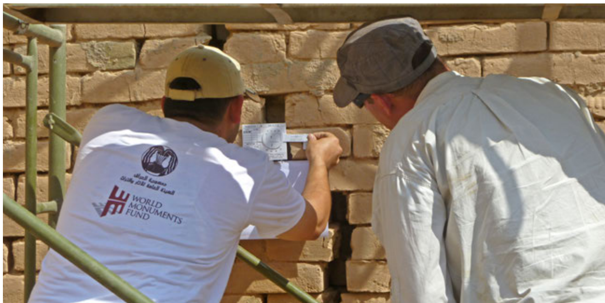
Installing crack monitors at the Ishtar Gate