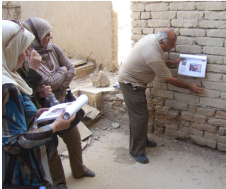
An Ishtar Gate condition assessment conducted by Babylon Committee members, frequent on-site visits by policymakers brought more informed management decisions.

Workshops were initially framed around regional archaeological sites with various site