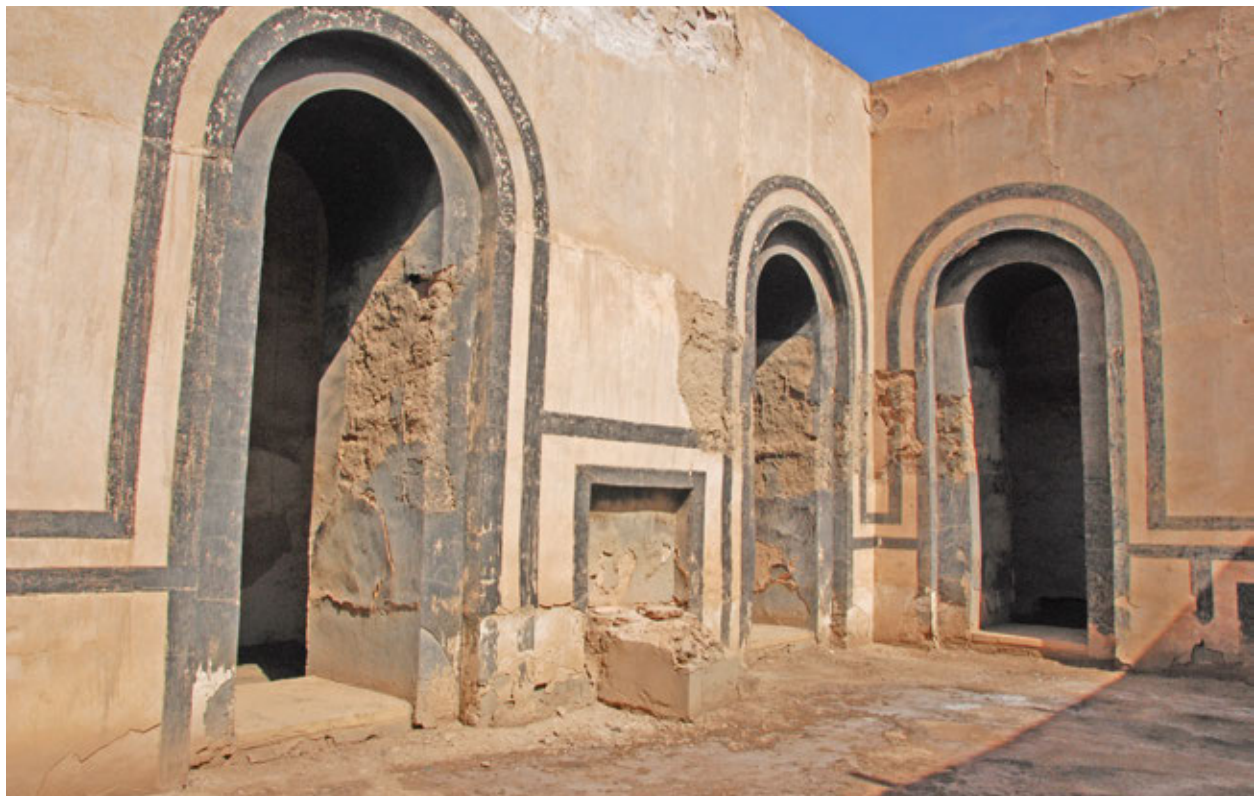
An interior courtyard at Nabu-sha-Hare Temple before the project initiated stabilization activities.

During Baath Party rule, Babylon was ostensibly the concern of the SOAH (the State Organization of Antiquities and Heritage, now the SBAH) but it was actually Saddam Hussein's direct domain. Babylon was pressed into the service of political propaganda to legitimize and promote his regime. Babylon became a backdrop for patriotic spectacle; Saddam's 'Babylon International Festival' billed as a culture event, was essentially intended to glorify the Iraqi President himself. 5