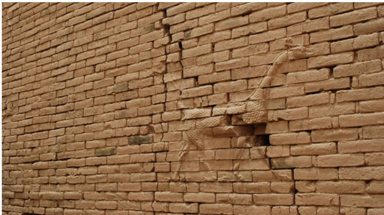
At Ishtar Gate masonry additions from the 1980s produced lateral forces that cracked a section of brickwork.

Years of professional isolation from international peers alongside decades of war account for the diminished skills and experience of many SBAH staff. Another aspect of Saddam's legacy is a fraught work environment, where decision-making has long been avoided since the wrong choice could mean a lost job or worse and teamwork has not been encouraged.