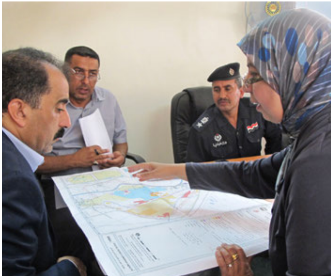
Babylon's survival depends on forging improved relations between national and regional government agencies.