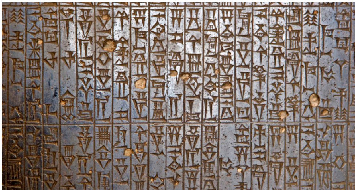
Detail from the Code of Hammurabi stela, (circa 1760 B.C.), Louvre, Paris.

An imperial capital, center of commerce, art and learning, Babylon was among the largest, early urban settlements in human history and is today one of the world's most significant archaeological sites. Located on the banks of the Euphrates River, 85 kilometers south of Baghdad, Babylon's material remains include portions of temples, palaces, fortification walls, monumental gateways and the ziggurat Etemenanki, the probable inspiration for the biblical Tower of Babel.