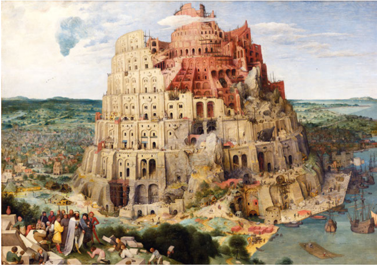
The Tower of Babel , Pieter Bruegel the Elder, 1563.

Babylon's legacy was enhanced by Akkadian and Sumerian cultural achievements, which included the cuneiform writing system, a significant tool for today's knowledge of the history and evolution of the region. The earliest known references to the city date to the third millennium B.C. 1 In the nineteenth century B.C. an Amorite leader founded the First Dynasty of Babylon. Its most famous king, Hammurabi (r 1792–1750 B.C.), renowned for his code of laws, made Babylon the capital of an empire stretching from the Arab Gulf to Syria. The Kassite kings who ruled Babylon in the mid-second millennium corresponded with Egypt's pharaoh, their cuneiform letters attesting to the interactions of ancient powers. Astronomy was first elaborated as a science in Babylon, alongside advances in mathematics that would inform all subsequent studies of the stars.