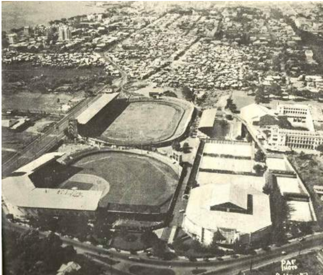
Fig.2: Rizal Memorial Sports Complex (circa 1960)

the sporting ideology by the United States in the region (Hübner, 2016). Such belief stemmed from the American rhetoric in which Asians would need to be taught to embody the "New Olympian", a man that believed in egalitarianism and peaceful internationalism. The Americans believed that this was an indicator of a tremendous progress, in line with the principles of modern time. The idea of the FECG was brought forward by YMCA physical educator, Elwood Brown who was influenced by American Protestant-Evangelical moral standards and work ethics of providing service to shape healthier and more