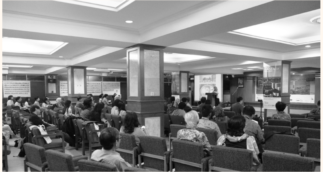
The 4th mASEANa Conference in Istiqlal Mosque