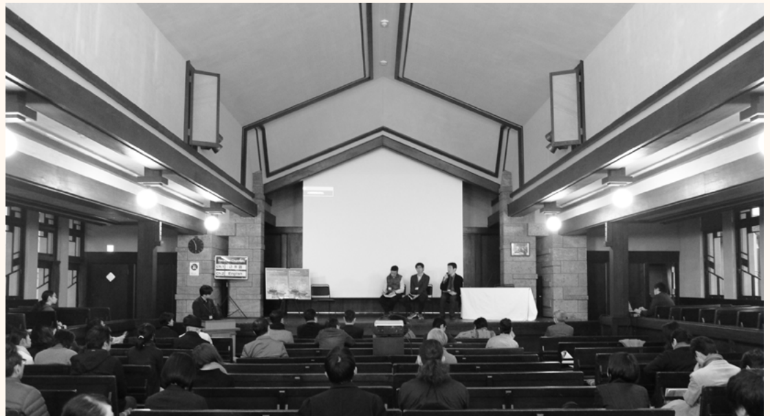
The 5th mASEANa Conference in Jiyu Gakuen Myonichikan