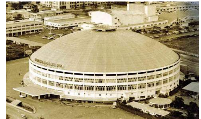
Fig.4: Araneta Coliseum aerial view (1960) The Araneta Coliseum is culturally significant because of several reasons, which will be described below