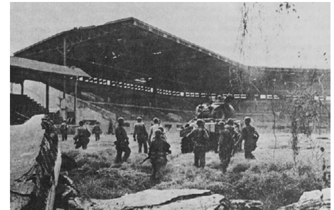
Fig.3: Destruction of RMSC during WWII (February 1946)