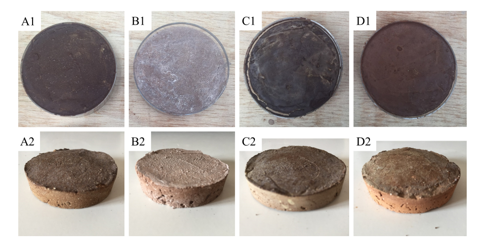
Figure 1. Appearance of prepared model samples.

intention of highlighting possible effects induced by different inorganic additives in lime-pozzolan mortars. Compositions of the pozzolana and opus signinum used in this paper are similar (Table 1), but pozzolana has slightly higher amounts of Al<sub>2</sub>O<sub>3</sub>, Fe<sub>2</sub>O<sub>3</sub>, CaO, SO<sub>3</sub>, and K<sub>2</sub>O and lower amounts of SiO2, MgO, and Na2O. It should be noted that the reactive silica as SiO<sub>2</sub> in pozzolana (38.6 %) is higher than in opus signinum (32.2 %), suggesting the higher pozzolanic reactivity of pozzolana. The amounts of the mortar ingredients were reduced according to the chosen recipe by proportion of weight, in order to cast the model samples in the plastic disc moulds with a volume of 25 cm<sup>3</sup>. The water amount in each mortar mix was determined after several tries in order to give each mortar mix its own appropriate consistency. The model samples were prepared by firstly homogeneously mixing the lime (quicklime/hydrated lime) and water (oxblood/water) together, then continuing to stir while adding the inorganic additives (pozzolana/opus signinum, iron powder) into the mixture until achieving a workable mortar paste. Each mixed mortar was then poured into a plastic disc mould and kept in laboratory conditions ( \sim 25\,^{\circ}\text{C} , \sim 50\,\% RH) for the final curing.