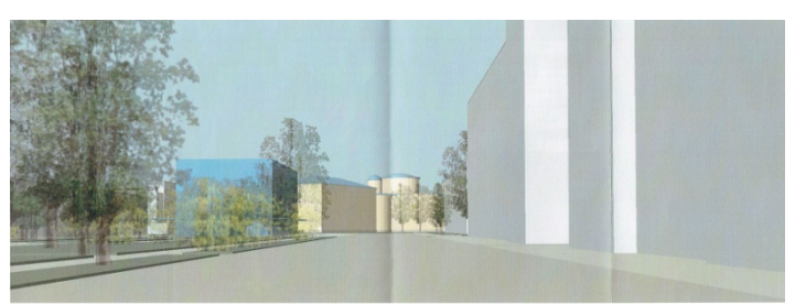
The view of the Chesma Palace with a volume of the demolished cinema.