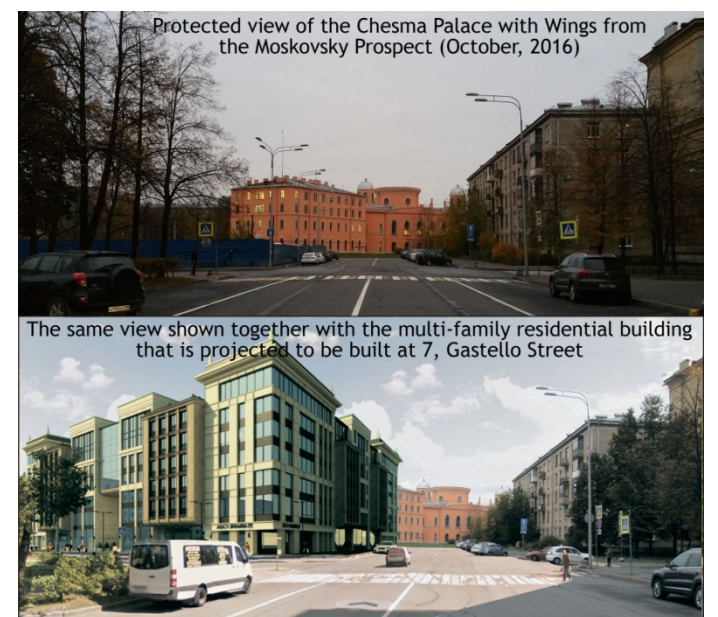
Fig.2- The 2015 project of the house blocking the view of the Chesma Palace from Moskovsky prospekt.

In 2015, a project of a new house with de-facto height of 25.9 meters (Fig.2) was developed for this land lot; a construction permit was issued. The project of the new house did not comply with the requirements of monuments' protection, because the project violated the city-planning legislation. In 2016, the land lot was bought by the Settle City Ltd. that replaced the project of 2015 for a more top-heavy structure. In comparison to the Zenith cinema, the square went up 3.66 times, and the volume 4.88 times. The project does not comply with the restrictions that are in effect in protection zones.