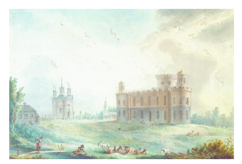
Fig.1- Watercolour by J.-B.deTraversay, 1770s.

Since its construction and by now, the Chesma Palace has been the spacial dominant of the locality opened up to the Moskovskaya Road (Fig.1), which is proved by many archival sources and maps.