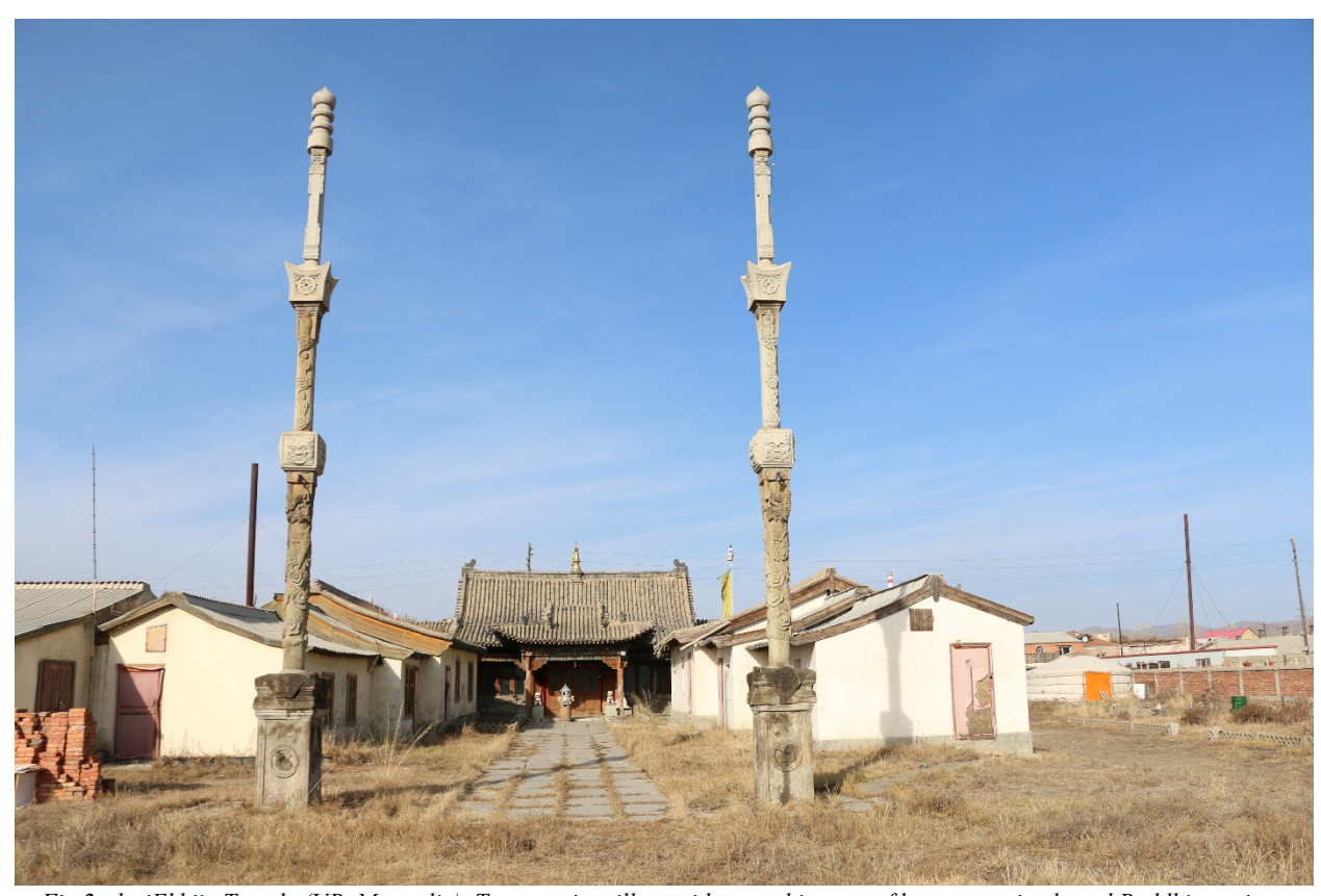
Fig.2- dariEkhiin Temple (UB, Mongolia). Two granite pillars with carved images of humans, animals and Buddhist scripts.

sites associated with "Great Tea Road" and life and deeds of D. Sukhbaatar, hero of National Freedom Revolution (1921).