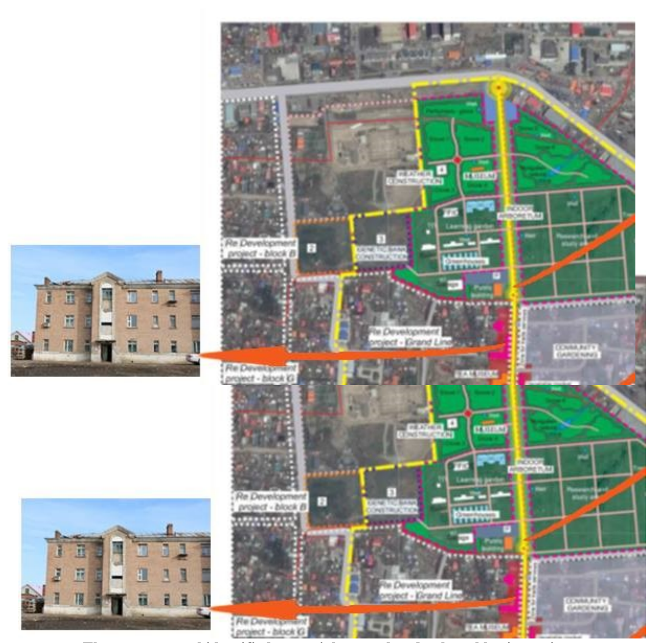
There are several identified potential natural and cultural heritage sites: Fig. 1- Map of the Package. Botanical Garden to Dari Ekhiin Temple Corridor. (UB, Mongolia).