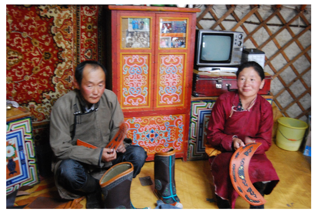
Fig.6- Family members who are bearers of traditional technique of making handcrafts.

• Providing infrastructure to Ger area neighbourhoods, including water, sewer and heat connections to monastery, park, Botanical garden and Ger community.