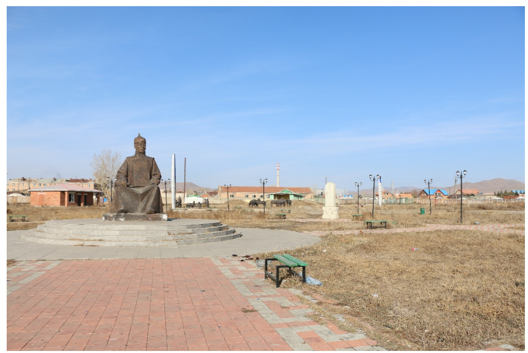
Fig.3- Memorial site of D. Sukhbaatar, Hero of National Revolution (UB, Mongolia).