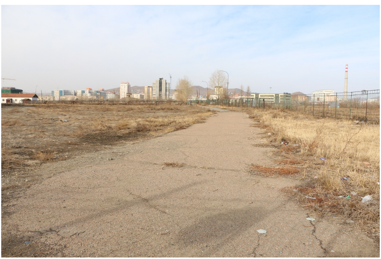
Fig.5- Connecting road from the Botanical Garden to the Temple