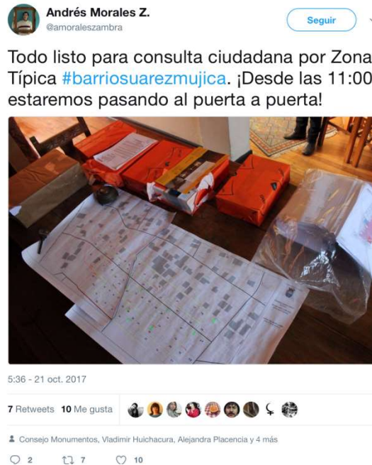
Fig.3– Material for citizen consultation on the declaration of Zona Típica (Barrio Suárez Mujica). 11

Another example is the Escuela Taller Fermín Vivaceta , <<a community initiative that aims to train skilled labour for the restoration of heritage buildings, through the rescue of traditional crafts such as woodworking, plasterwork, the recovery of traditional techniques such as adobe, quincha and mud, and