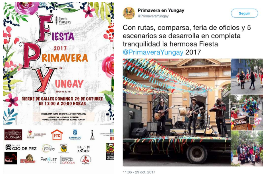
Fig.1– Spring fest promoted by community organisations at Barrio Yungay since 2014 7

The organisation partially achieved its mission, when 113.53 of the 170 hectares initially proposed to be protected were declared Zona Típica . Currently, Barrio Yungay is a focus for cultural development and for dissemination of heritage significance in Santiago, through numerous activities carried out every year (see Fig.1 for an example).