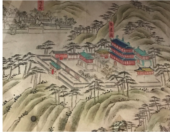
Fig.3– Pu Ren Si (The Mountain Resort Museum). Fig.4– An Yuan Miao (The Mountain Resort Museum).