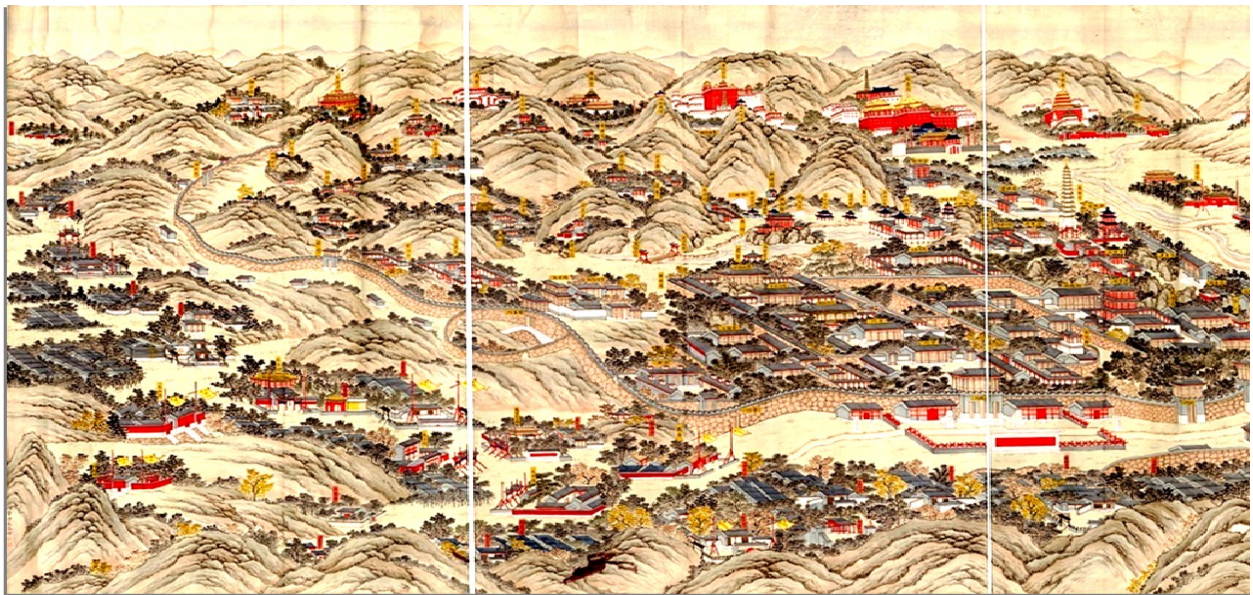
Fig.5 – The Mountain Resort with its Outlying Temples (Chengde, China. National Art Gallery of the United States.)

Since the beginning of the building the Mountain Resort by Kangxi to completing the construction of the twelve Tibetan style temples by Qianlong in the northeast of the garden, Emperor Qianlong also built a large number of Chinese temples, Taoist temples, and folk gods and other religious sites, and ordered the repair of the former dynasty folk temple. During the Republic of China, some of the data showed that there were more than one hundred and thirty temples in the Chengde area, except for the imperial temples. This respect and advocate the practice of multi-god worship, not only to balance the dominant position of the Huang Jiao, but also to promote the integration of all ethnic groups, and achieved the harmony between the gods and the people.