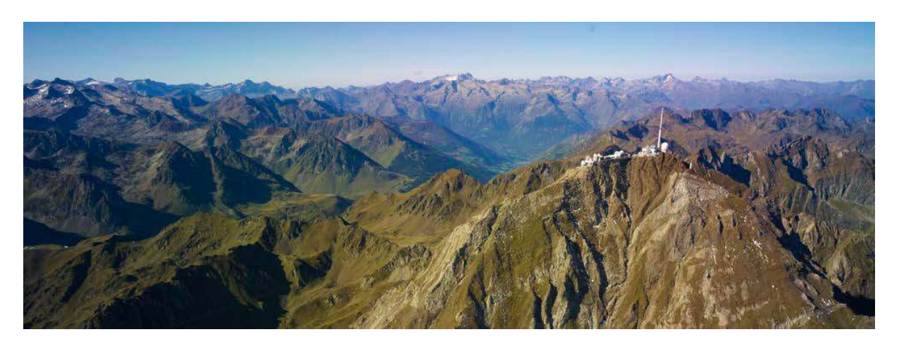
Fig.: Pic-du-Midi Observatory and Scientific Station: in regular use from 1883