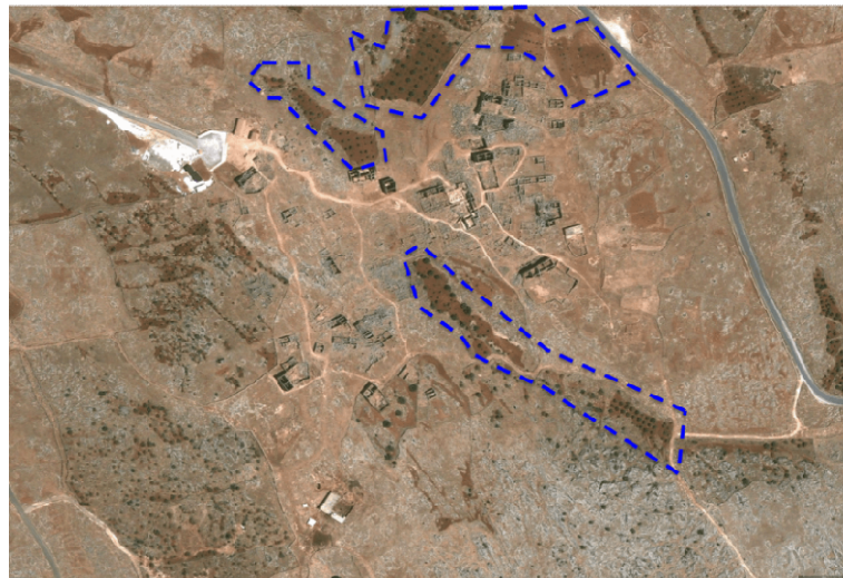
Fig.2- The impact of agriculture on Serjilla, Syria, 2010

Training will be delivered in different ways, including lectures and presentations, practical sessions with trainees on using Google Earth, record creation, and using the database, interactive sessions and discussions, site visits and on-site condition assessment, and case studies prepared by trainees as well as the training team. The project has also prepared manuals and tutorials that will be translated to Arabic.