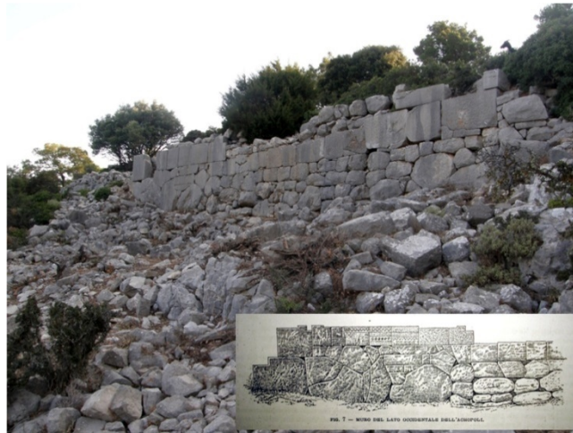
Fig.2– Hagios Phokas (Acropolis), fortifications (KARP. Drawing after Maiuri 1916, 290, fig. 7).

Within this framework of sites, the KARP has focused on three major sites so far: the hilltop of Hagios Phokas, the necropolis of Kymissala and the site of Vassilika. 4 The central necropolis of Kymissala is quite extensive. Excavation has been carried out in sectors I and III, bringing to light mainly chamber tombs dug in the rocky slopes of the hills of Hagios Phokas and Kymissala dating from the late seventh century BC to Late Antiquity. Some of them are quite large and elaborate, while grave monuments and inscribed pedestals have been cleaned and recorded in sector IV. 5