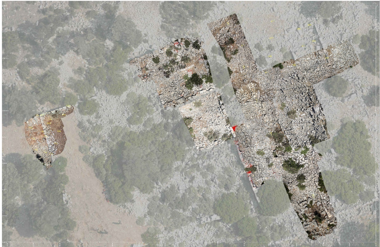
Fig.5– The orthophoto mosaic of the road network in the Vassilika area overlaid on the 1:200 orthophotos

and the products in the form of orthophotos at scales 1:2000 and 1:50 were given to the archaeologists in charge (Fig.5).