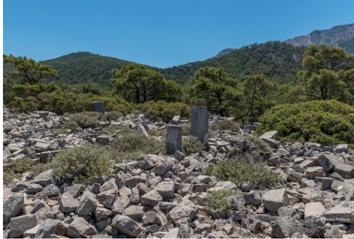
Fig.3– Vassilika, settlement (KARP).