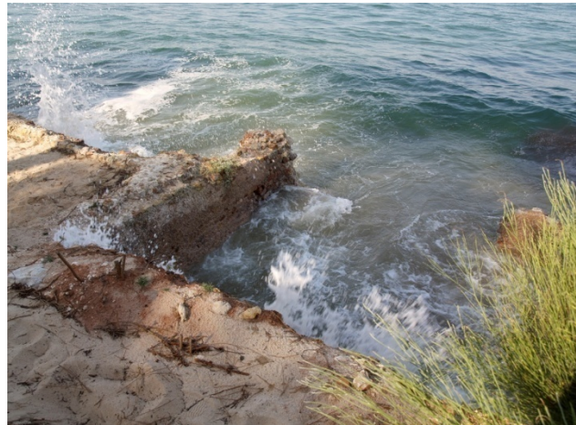
Fig.2– Example of destruction of fish-salting workshop by the high tide.

The Roman Ruins of Troia, the largest large fish-salting production centre so far known in the Roman Empire, present a number of fish-salting workshops, baths, houses, cemeteries, a mausoleum and a basilica. Located on the shoreline, many archaeological areas are exposed to tidal and river currents and sea waves and suffer a slow but progressive degradation, heightened by climate change (fig.2).