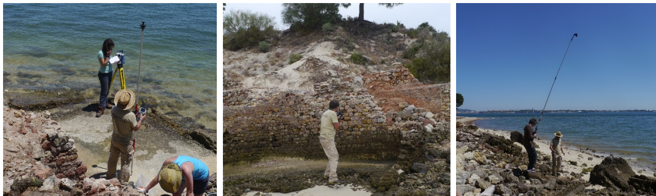
Fig.4— Photogrammetric survey in 2016 at Workshop 23.

The main goal is to capture the complete 2D plan of the masonry, allowing the generation of a 3D model, with texture and in a geo-referenced detailed model. This was done for the two case-studies selected on the shoreline, workshops 21 and 23, in June 2016 (fig.4), the first month of this project. A new survey was done in September 2017, to determine the rate of loss of the Roman vestiges via model comparison. This will furthermore allow its virtual reconstitution for research purposes and, eventually, for recreational models accessible to the general public.