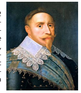
Gustavus II Adolphus

But the king's death at the battlefield of Lützen in 1632 dampened the former rhetoric, and Gothicism took a somewhat different path. Now linguistic aspects came into focus. So far no other assumption had been thought possible than that the primordial language must have been Hebrew, Adam's tongue. Now Georg Stiernhielm, one of the first antiquaries, with elaborate comparative studies of the Gothic language as it appeared in the newly discovered Silver Bible of bishop Ulphila tried to assert a theory evolving from analysis, that Swedish was instead that first language.