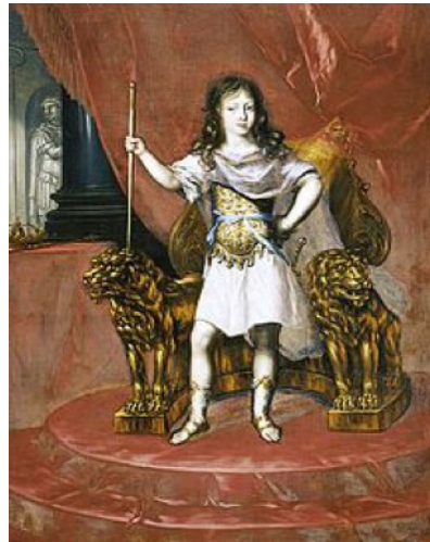
Charles X Gustavus 1622-1660