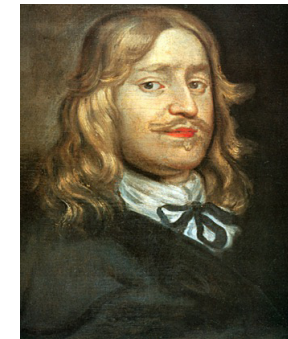
Magnus Gabriel De la Gardie 1622-1686

Already in 1654 he had become Chancellor of Uppsala University, a position he held for 32 years with vigour. He showed a great interest in arts and culture, particularly projects that would shed magnificence on the realm (and himself personally). One project of great importance to the heritage was the a collection of illustrations of new and old buildings, Svecia Antiqua et Hodierna , which was inaugurated at Magnus Gabriel's behest by the regency government in 1661 and conducted under the leadership of Erik Dahlberg. 2 Not always true to life, the painstakingly detailed etchings portrayed what official Sweden found most worthy of presentation and remains even today a much sought after publication, having appeared in many reprints. Another example of his commitment