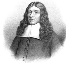
Johan Hadorph 1630-1693

The placat ends with an admonition to the clergy and governors to make inquiries into the state of the antiquities under their domain, and on 18 December 1666 the regency government followed through with special instructions to the same circle of officials. These instructions were accompanied by an "extract" of the placat, edited by Hadorph. But the extract is more than just a summary. It is more succinct and more detailed as to the protected objects. It adds literary sources as objects both to be collected and protected, such as "monkbooks", i.e. chronicles, letters and notes from monasteries and cloisters, books containing legal texts, collections of tales and songs.