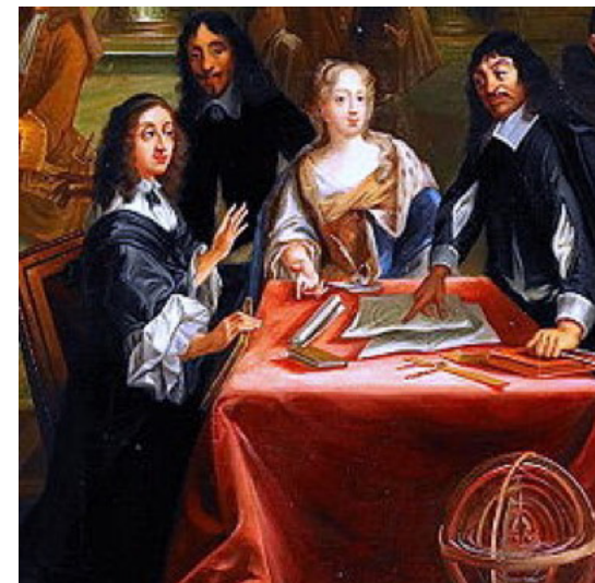
Queen Christina (left) with Descartes (right)

The Italian connection, however, is interesting from quite another viewpoint. Abdicated queen Christina, a cousin of the deceased Charles X Gustavus, had resided in Rome since 1655 after her conversion to Catholicism. There she developed tight and sometimes complicated relations with the popes and the Vatican administration. She kept a keen eye on what was going on in Sweden from where she would get the main source of income to maintain her court in exile. When news about her cousin the king’s death reached her in 1660 she decided she had better visit Sweden in order to look after her interests in person. Her entourage consisted of fifteen persons. Negotiations in Stockholm with representatives of the regency government were about finances, faith and succession, all touchy issues, where she would also have to meet the man she had once humiliated, Magnus Gabriel De la Gardie. 37 It seems unlikely