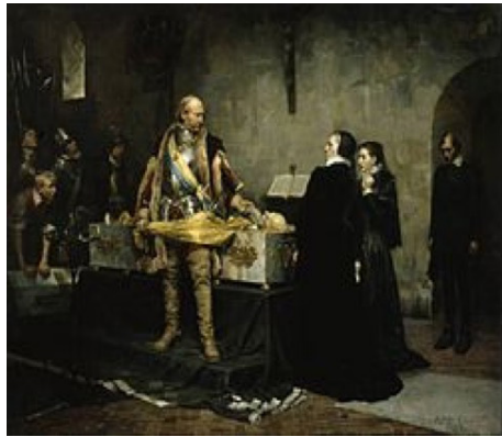
Charles IX defaming the corpse of his enemy Klas Fleming. Albert Edelfelt

Orkneys into Iceland and Greenland, in nine gigantic sheets, the Carta Marina . It has remarkably vivid illustrations of people and fauna, ships and crafts, and mythical animals. His Historia de gentibus septentrionalibus was published in 1555. It was a work of great originality, describing not just the history of the Goths but also the nature and environment. It told tales of climate, mountains, rivers and lakes, of religion and superstition, of Finns and Lapps, and of Amazons, and the everyday lives and crafts of the population. Its aim was to portray a people living in a land of great natural beauty, but also containing enormous challenges during dark and cold winters, all of which had contributed to the fostering of a nation of heroes. 16