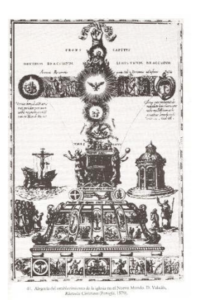
Figure 1. Allegory of the stablishment of the Church in the New World by D. Valadéz 1579

We speak then, about the art of memory through the mnemonic symbols but also through an art of oblivion , as we can infer this is frankly a social manipulation by means of symbols.