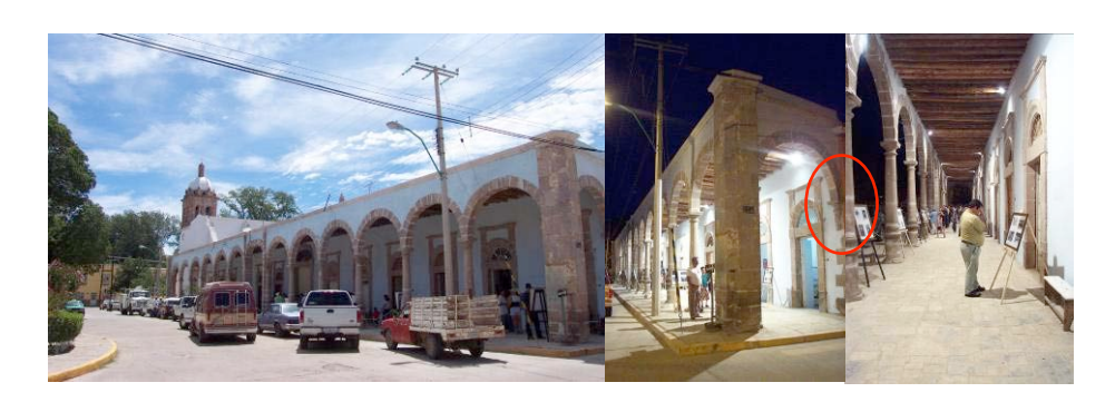
Figure 6. Left: North (main) front of Consistorial house; right: location of hand marked in red

However, this element that very well can be related with a whole system developed during the mentioned Golden Century, is not found in any other place in the State of Chihuahua, Mexico, or even Spain, according to the conversations held with Dr. Gomez Piñol (2001). It is a completely local representation that gives another dimension to the place's spirit, but it bonds it to a macrovision at the moment of its creation.