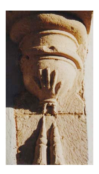
Figure 2. Hand on bracket in Consistorial House

meditation, and in there, a mute language in concordance with the diverse divisions framed in them, is generally enclosed (RODRIGUEZ, 1995)