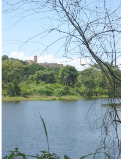
Small lagoon to the south east of the abbey

According to this, we can consider as determinant factors of the disposition of the programme and the morphological character of the monastery, to the singularities of the zone, the topographic, climatological and sunning conditionings. In this sense, the implantation of the edification generates an ineludible link with the landscape.