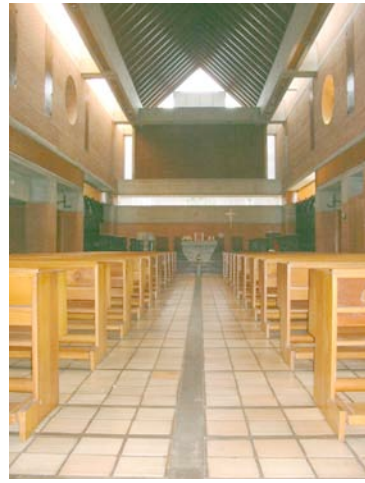
Inside the church

The hospice area refers to one of the ancient benedictine activities, the hospitality. The Rule persuades to receive the guest like they receive Jesus Christ, but it is also clear, that it does not have to disturb the monks' life; therefore, the spaces occupied by ones or the others are explicitly marked. (San Benito's Rule, p. 150). This aspect is also registered in our case of study because the hospice is apart from the areas designated to the exclusive use of the monks.