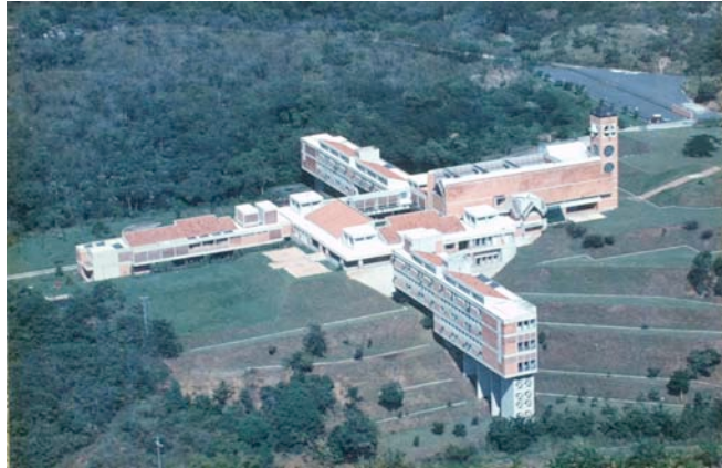
Panoramic view of the abbey from the southeast

From the monastic and Benedictine constructive tradition, the conception of the cloister is kept as a unifying element of the monastery, around it are located the other dependencies, but the innovation of the Abbey of San José strives in the way these dependencies are distributed from the centre.