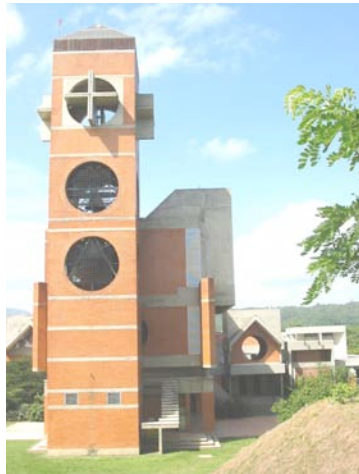
Bell tower. North view

The church occupies the most important place inside the Abbey, its function and the expressive individuality outstands in the architectonic ensemble show it this way. The conceptions of the dwelling of God and the assembly of guests come to a third conception which reveals the church as “the place of the new theophany” (Plazaola, 1995, p. 121). The liturgical acts held there by the monks and the christian assembly are a signal of it ( Opus Dei and Eucharist).