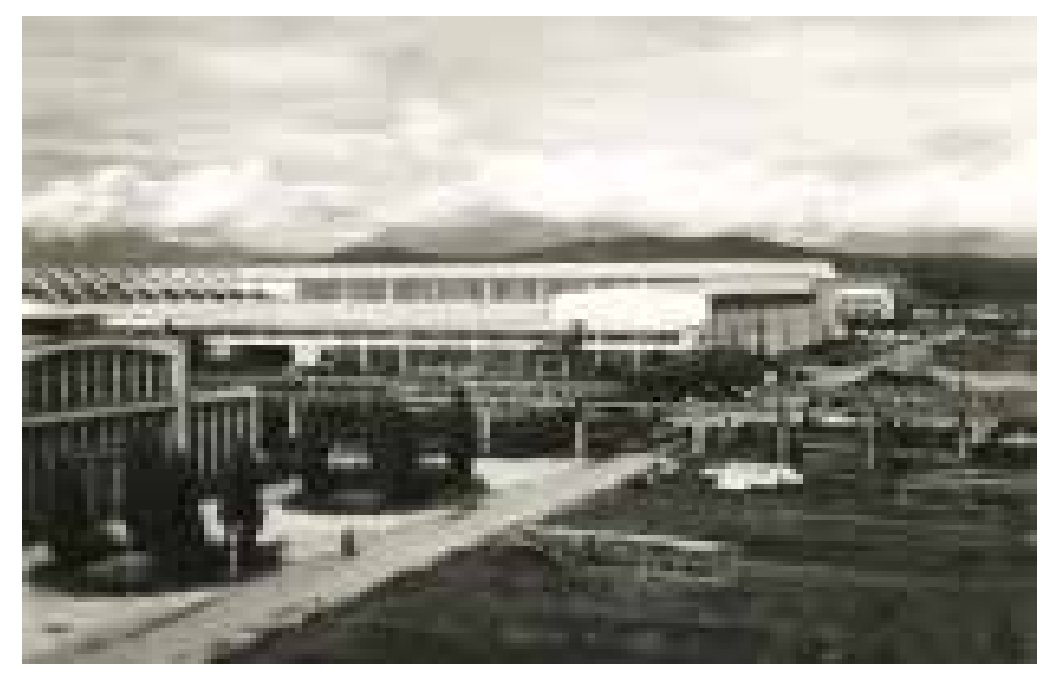
Fig 3: Litostroj was designed as factory complex in the green.

The industrial facilities testify to the great deal of innovation and design sensibility, which should be given some attention in the paper. This is a complex of major dimensions;