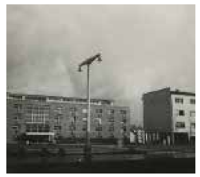
Fig 2: Main street of the area, named Litostroj Avenue at the beginning, now Litostroj Street.

The project that left a distinct mark on the early post-war development of Ljubljana was the building of the Litostroj factory. Extensive structures provided an important witness to the conditions that guided the architectural and spatial development and, last but not least, became part of the lives of many inhabitants of Ljubljana (Ifko, 2011, p. 36-39). The Litostroj City, as named by factory workers in post-war newsletters (Pet let Litostroja, 1952, p. 1), is not only a group of production structures, but an autonomous urban