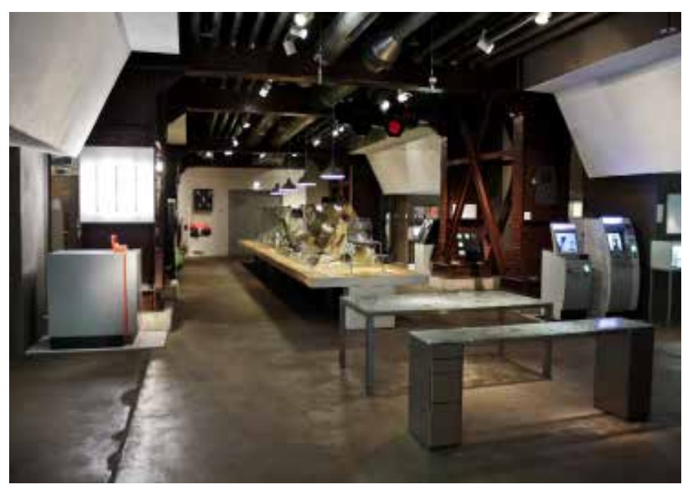
Fig 1: Design Museum in former Zeche Zollverein coal-mine complex in Essen.

Industrial tourism has been on a constant rise, which undoubtedly opens the possibilities for the representation of the 'recent heritage', i.e. the heritage of industrial complexes built during the era of socialism, irrespective of whether the structures have been abandoned or are still operating; an integrated inclusion into development processes is one of the key conditions of their preservation.