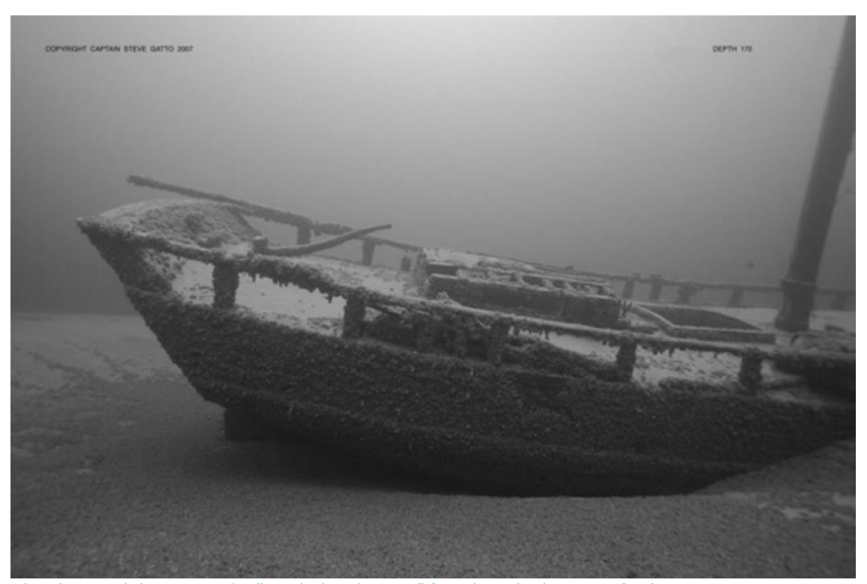
The shipwreck known as the "Dunkirk Schooner" found on the bottom of Lake Erie.