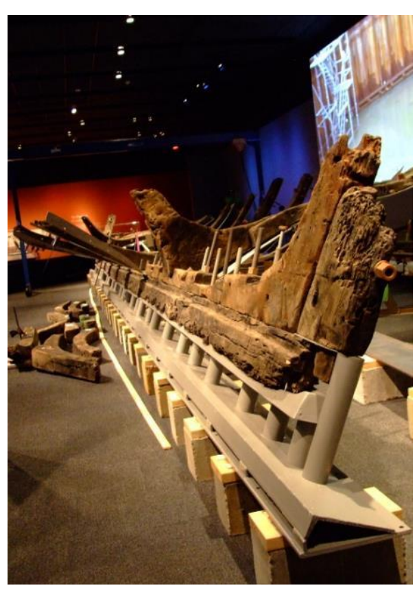
View from the stern of the hull of La Belle undergoing reassembly in Austin, December 2014, Yamplos, distributed under a CC BY-SA 4.0 license.

The U.S. has also entered into agreements with France to manage and protect the sunken warships CSS Alabama and La Belle , and with Japan on the Kohyoteki midget submarines.<sup>5</sup> These agreements recognized the ownership and sovereign immunity of the respective sunken warships and, more generally, that coastal states hold jurisdiction and authority over foreign sunken warships located within their territorial seas.