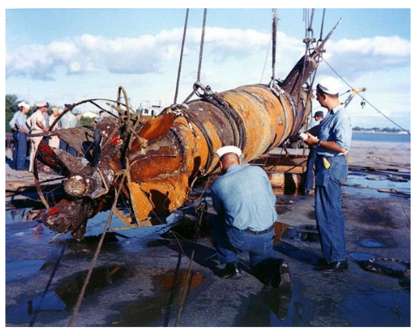
Japanese Type A midget submarine recovered in 1960 off Pearl Harbor, HI