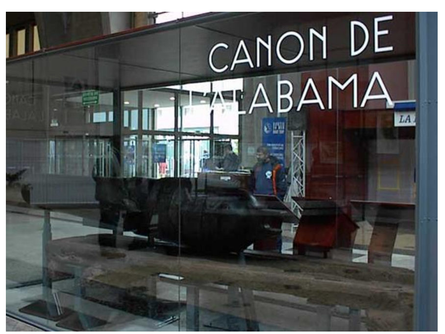
One of the canons from the CSS Alabama on display at La Cite De La Mer, CSS Alabama 2005 Project Photo Album, n.d. Web 19 Oct 2017, www.superiortrips.com.