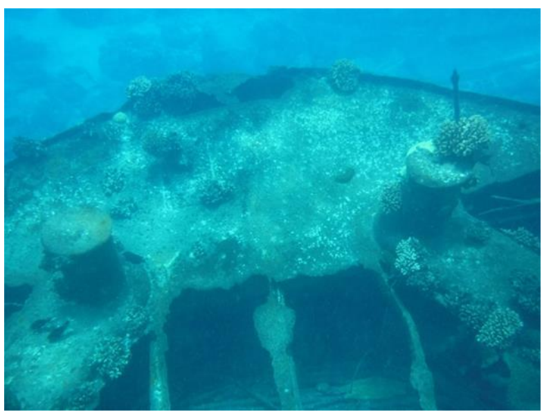
One of the Wake Island shipwrecks just outside the channel to the marina.

The Antiquities Act, passed by the United States Congress and signed into law by President Theodore Roosevelt in 1906, gives the President authority to proclaim national monuments on lands owned or controlled by the United States and to protect "historic landmarks, historic and prehistoric structures, and other objects of historic or scientific interest."6 While most monuments are on land, there are several marine national monuments managed by the National Oceanographic and Atmospheric Administration (NOAA).<sup>7</sup> The most notable marine national monuments include the Marianas Trench, Papahānaumokuākea, and Northeast Canyons and Seamounts. Beyond designation, research and recovery of antiquities on such lands requires permits. The Antiquities Act, has been used to protect cultural property in a marine environment managed by the U.S. National Park Service, the Canaveral National Seashore.8 Yet, while designating marine national monuments to protect natural and cultural heritage within the EEZ/OCS is clearly within the U.S. government's authority, it is unclear whether and to what extent the U.S. will use its authority to enforce the permit process on lands outside designated Marine National Monuments.