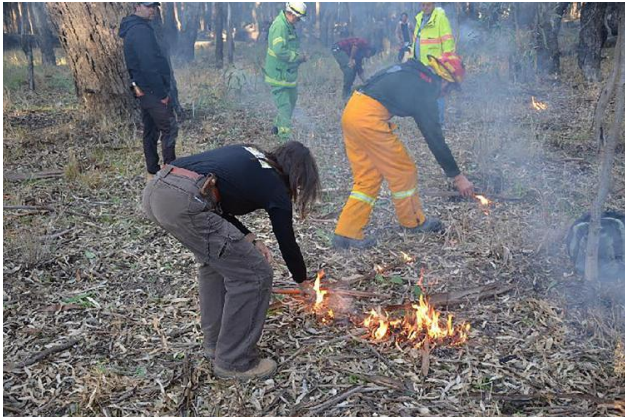
Plate 1. Cultural Burning Courtesy of Country Fire Authority (cfa.vic.gov.au) The importance of cultural burning to CFA - CFA News and Media National Indigenous Fire Workshop Dhungala 2019