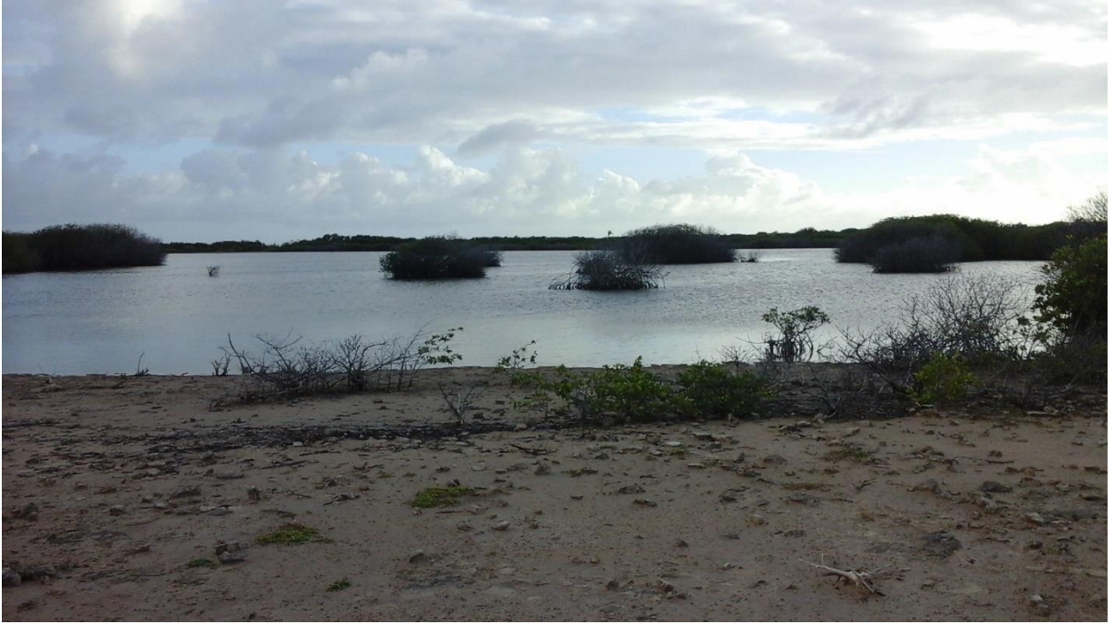
Plate 2. Mangroves.