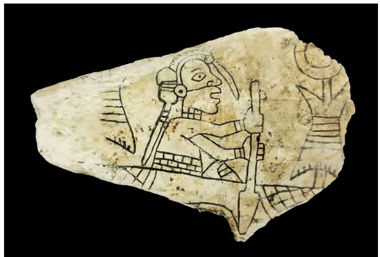
Engraved shell cup fragment of figure canoeing. Craig style. Le Flore County, Oklahoma, Spiro site, AD 1200–1450. Marine shell.

Craig A also sets the stage for later Craig subjects and themes, including T-Bar (albeit only in a single small cameo of uncertain significance), Wedgemouth, and that figure's many guises: Birdman (who remains absent from the Braden tradition at Spiro), the range of entities bearing the one-prong truncate, one-prong wavy eye surround, the serpent staff, and by extension, the forked pole (especially in treatments like gorget 141). It also provides a metaphorical basis for understanding Craig iconography, both through its depictions of powerful beings emerging through and from the rites performed by celebrants (e.g., gorgets 126, 127, 128, and 132) and—through cups like 160, which depicts canoeists bearing iconographic standards plying unnamed waters—the spread of Mississippian cosmologies and cosmogonies to the geographic margins of the Mississippian world.