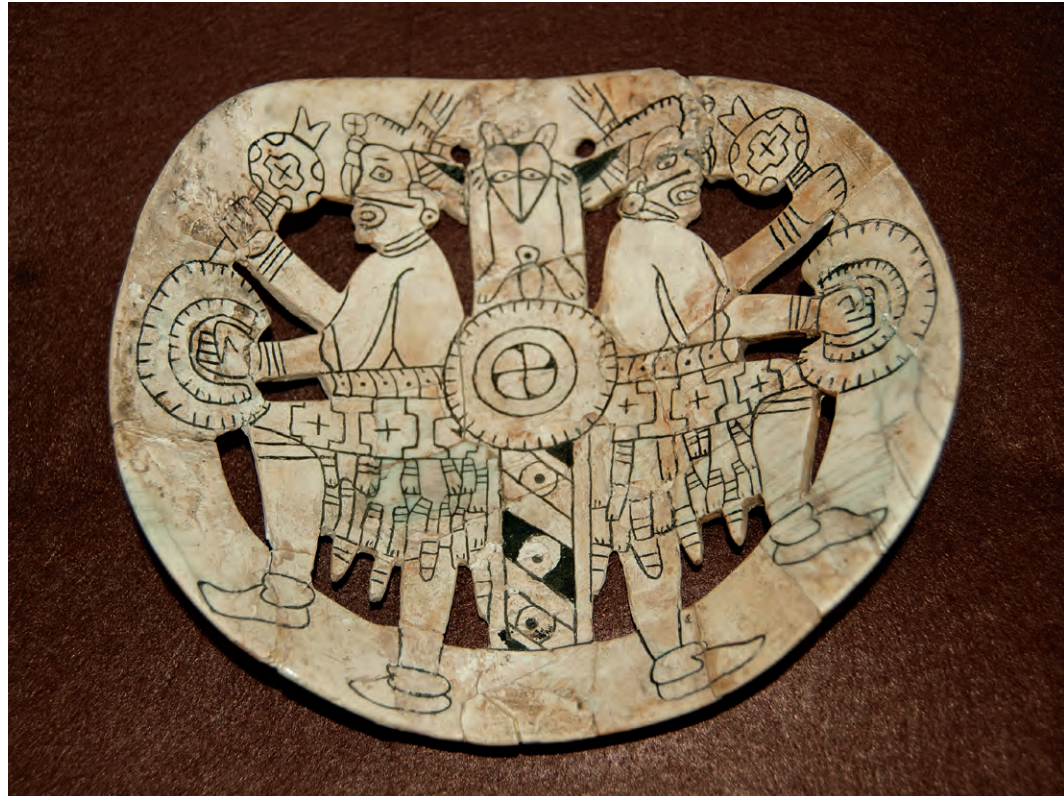
Engraved gorget with two dancing figures holding rattles and drums. Craig style. Le Flore County, Oklahoma, Spiro site, AD 1200–1450. Marine shell.

cup 286.1, where Wedgemouth occupies the right side of the cup, holding a bow as a central axial element and facing three Wedgemouth heads in vertical register on the left side. More generally, the paired figures holding bows presage Craig C gorgets 336 and 337, which depict two Wedgemouth figures and are compositionally identical. These overlapping themes are subsumed within the Hamilton and Rhoden “styles” as defined by Brain and Phillips. 7