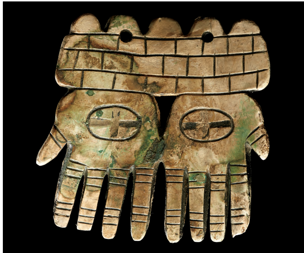
Engraved shell gorget of human hands. Craig style. Le Flore County, Oklahoma, Spiro site, AD 1250–1400. Marine shell. Gilcrease Museum, Tulsa Oklahoma.