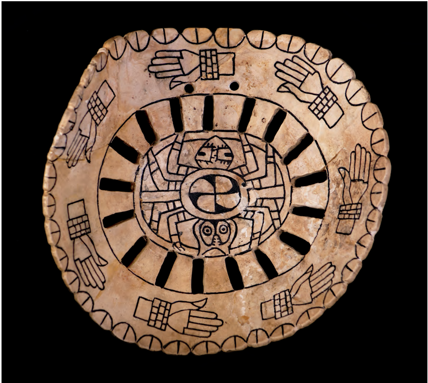
Engraved shell gorget with hands and spider. Craig style. Craig style. Le Flore County, Oklahoma, Spiro site, AD 1250–1400. Marine shell.

to recapitulate pottery types such as Spiro Engraved (cup 261), Haley Engraved (cup 260), and Crockett Curvilinear Incised (cup 259). Cups also depict individual motifs, including the bilobed arrow (cups 271, 271.I, and 272A and B), arrows (cup 270), bows (cup 269), the pear-shaped appendage (cups 266–268), and the petaloid cross (cup 263).