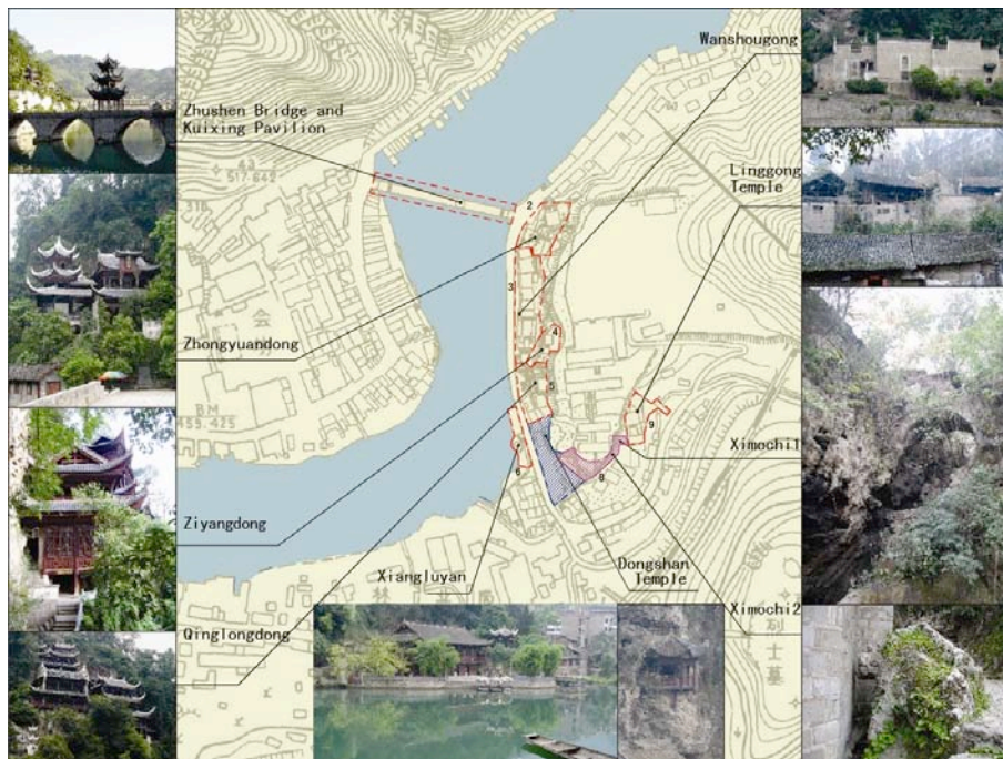
Figure 2. Building groups of Qinglongdong.