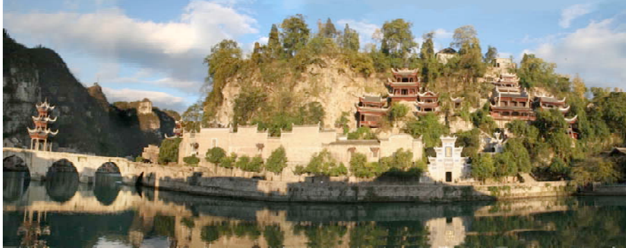
Figure 1. Panorama of Qinglongdong.

Qinglongdong describe historic scene of the development of politics, economy, art, education and technique in a certain extent (Figure 1).