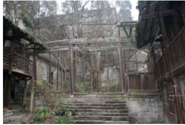
Figure 3. Actual conditions of Linggong Temple.