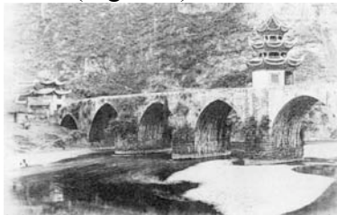
Figure 4. Yonggutongjin City Pavilion.

Taken example of Yonggutongjin City Pavilion: they will be rebuilt based on old photos and archaeological information and will be used as the ticket office and safeguard office. In addition, the sign tablet will be set to be identified (Figure 4)