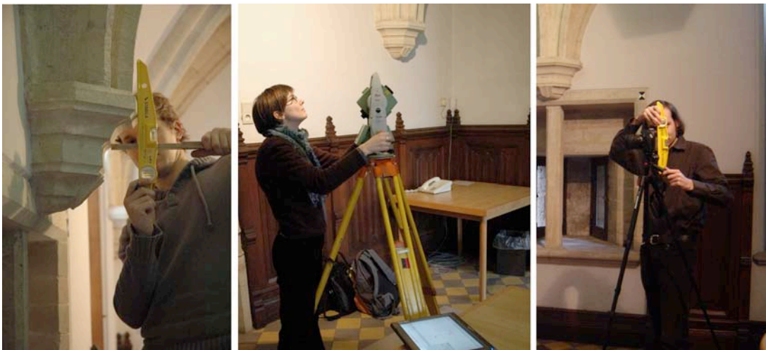
Figure 3: students measuring with different techniques, author.

Divided into teams, the students are instructed in the tools they will have available for the session and the conservation constraints on the information capture outcomes. Metric photography and scale drawings are emphasized as the required deliverables to be prepared with the assistance of the instructors.