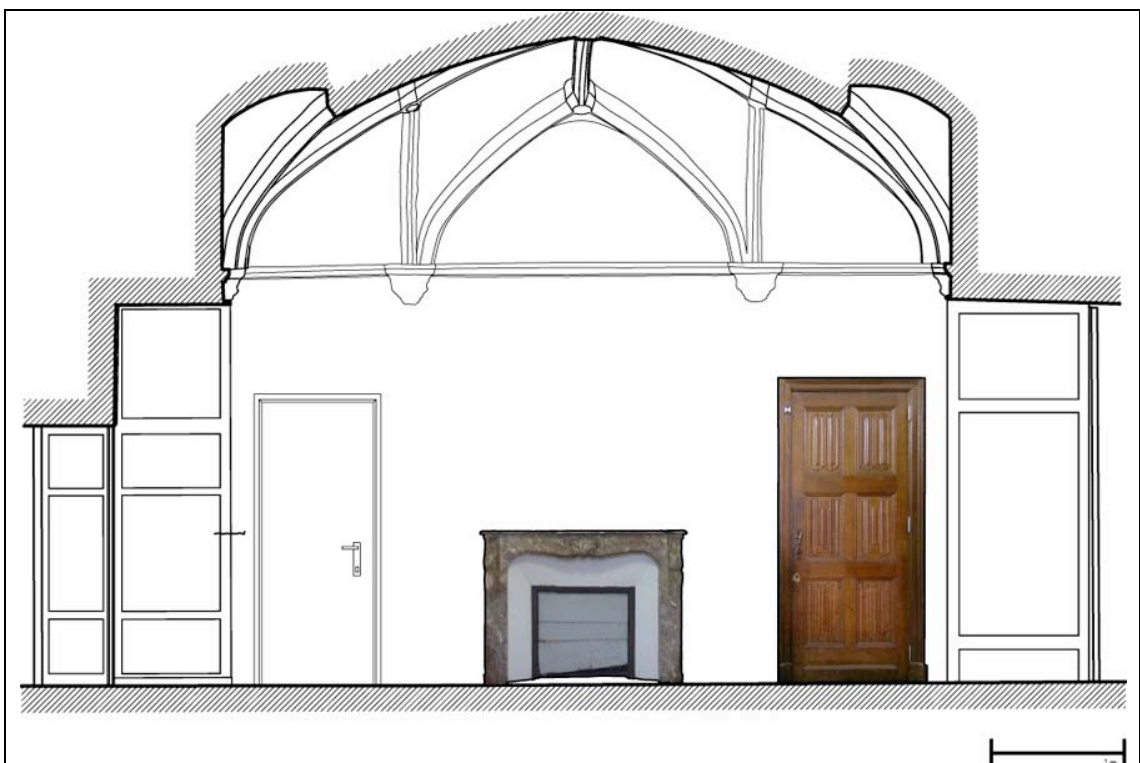
Figure 5: section prepared by participants during the course, group at the Tower 2008.