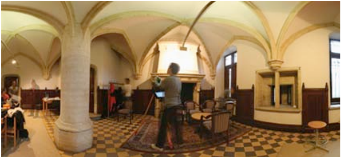
Figure 1: student measuring an historic building during a course, author.

material including the dissemination of model briefs and specifications for metric survey .