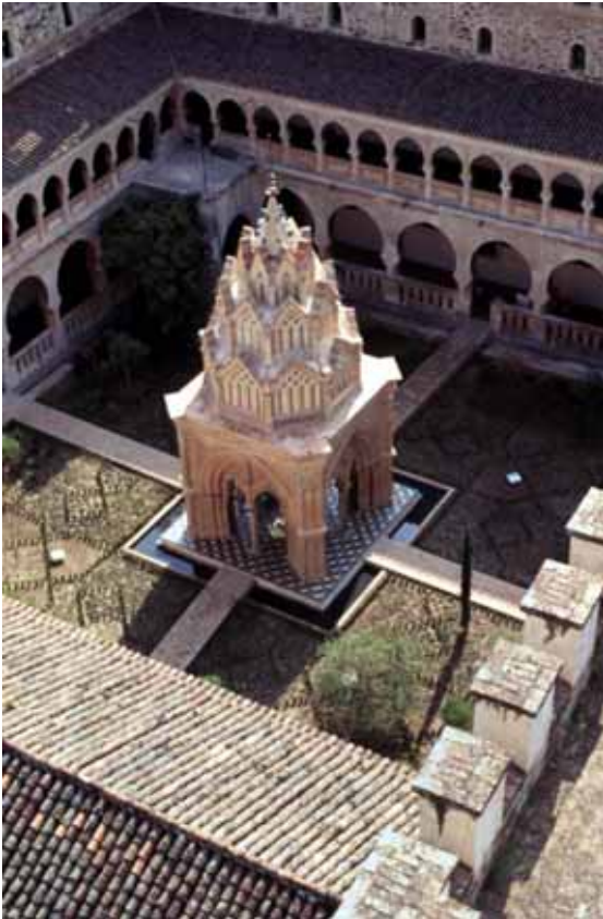
Illus. 1. The scope of restoration work in the 14th century Mudéjar Cloister of the Royal Monastery of Guadalupe (Spain) began with the templete structure and was enlarged to include restoration of its surrounding garden, and cloister facades that enframe the ensemble.

Vice President for Field Projects ,World Monuments Fund