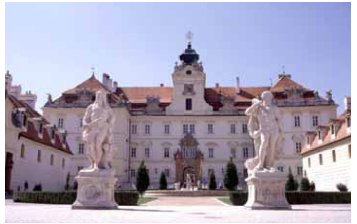
Illus. 2 Valtice Castle in southern Moravia (Czech Republic) proved to be the just first item of attention in the determination of a cultural resource that included and even bigger castle (Lednice), eighteen sizable picturesque landscape follies, all within a 160 square kilometer cultural landscape. One result was the listing of Lednice-Valtice as a UNESCO World Heritage Site.