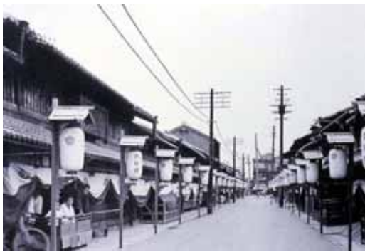
Fig.1 A streetscape in the central area in 1930.

Professor of Ritsumeikan University, Department of Architecture and Urban Design