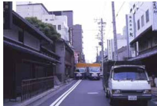
Fig.2 Today's streetscape of the same place as Fig.1