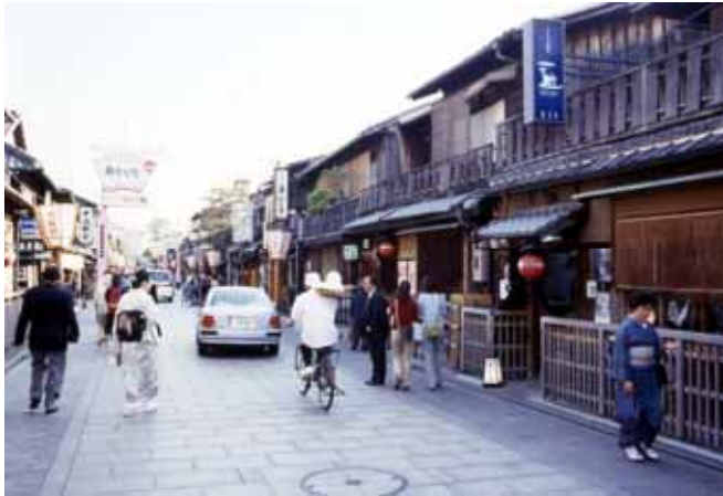
Fig.6 Streetscape of Gion-minamigawa district, where the building of three story is allowed.

Fig.5 A building of Fig.4 was demolished and rebuilt into two storied building with traditional façade design.