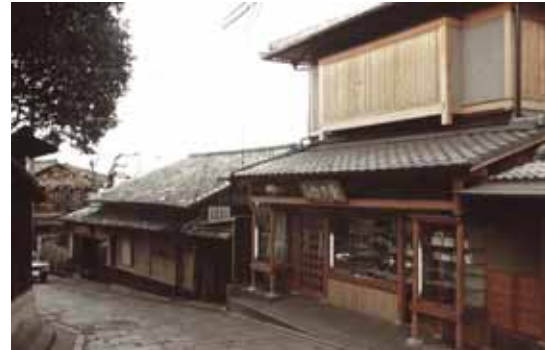
Fig.4 Streetscape in the preservation district of Sanneizaka.