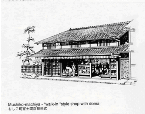
Mushiko-machiya - "walk-in" style shop with doma むしこ町家土間店舗形式