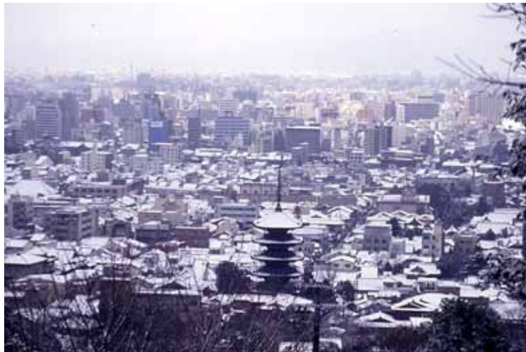
Fig.8 Commanding view of Kyoto covered with snow