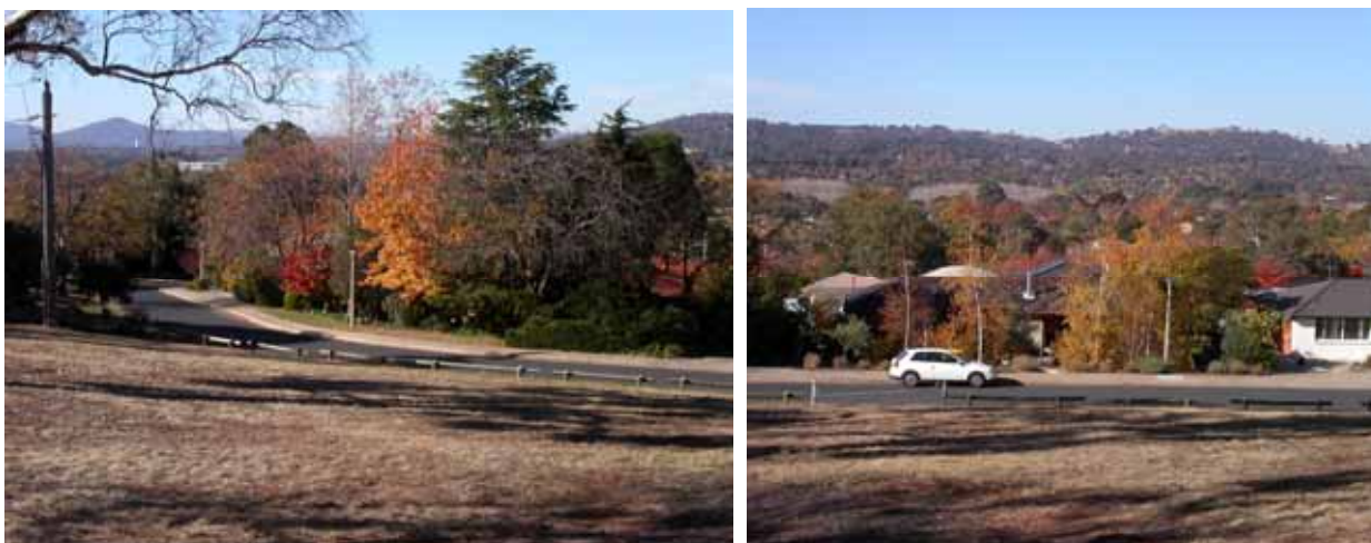
Fig.3 Setting of Curtin a 1960s Canberra suburb