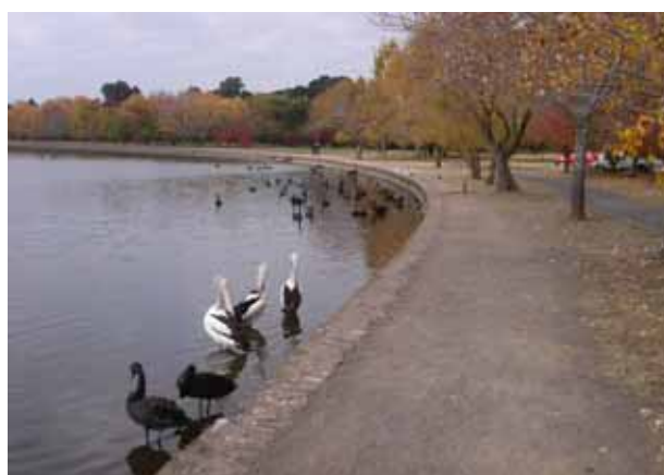
Fig.4 Nature in the city: lake Burley Griffin