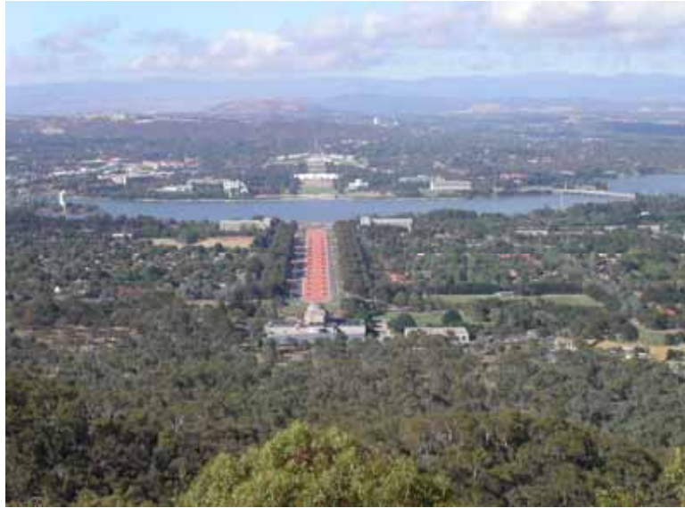
Fig.1 Panorama of landscape setting of Canberra

Emeritus Professor Visiting Fellow, Humanities Research Centre, The Australian National University, Canberra