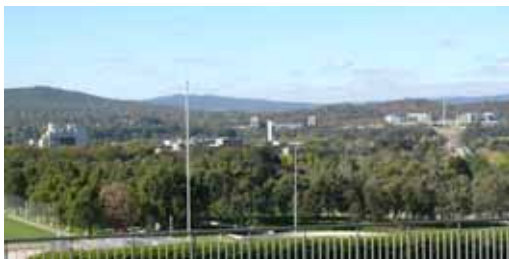
Fig.2 View from Parliament House