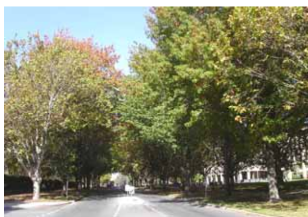
Fig. 5 King Edward Terrace street planting: Platanus acerifolia and Quercus palustris