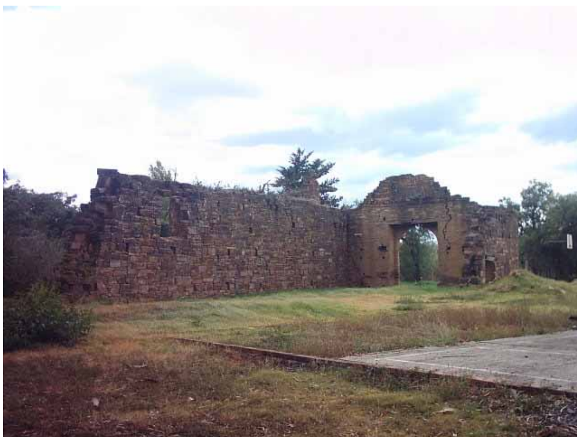
Fig. 3 Indian Town monquiRA