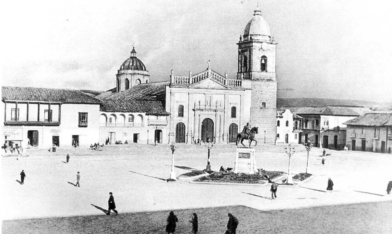
Fig. 2 Colonial city. TunJA