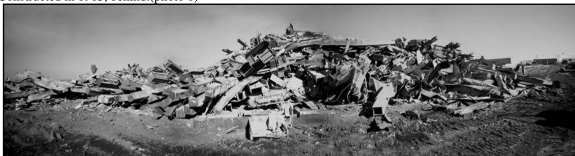
Steel from the World Trade Towers stacked for scrap at Fresh Kills Landfil (photo w (photo 2)