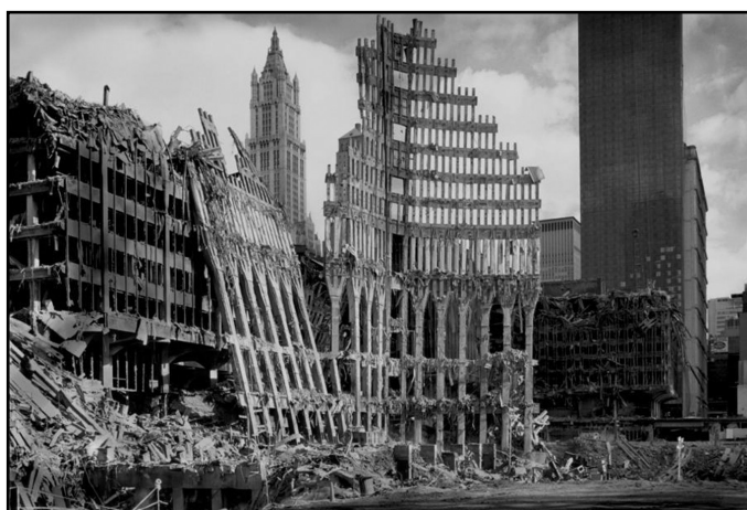
Ruins of North Tower Façade with the Woolworth Building Constructed in 1913, behind.(photo 1)

older buildings can teach us the importance of what Cass Gilbert posted on his office wall – humility. Just when one is convinced that what we do now must be better than anything that preceded us, we often discover that our predecessors have been there before – and we discover that, with fewer materials at their disposal, they accomplished more. The thousands of pancake-collapsed buildings in recent earthquakes standing next to both ancient monuments and older vernacular buildings – all still standing – should provide reason enough to look more carefully at archaic structures, and to give them the same measure of respect that we give to the architecture they support. It should also motivate us to insist on conserving them as an integral part of the historic buildings that we work to save for our children.