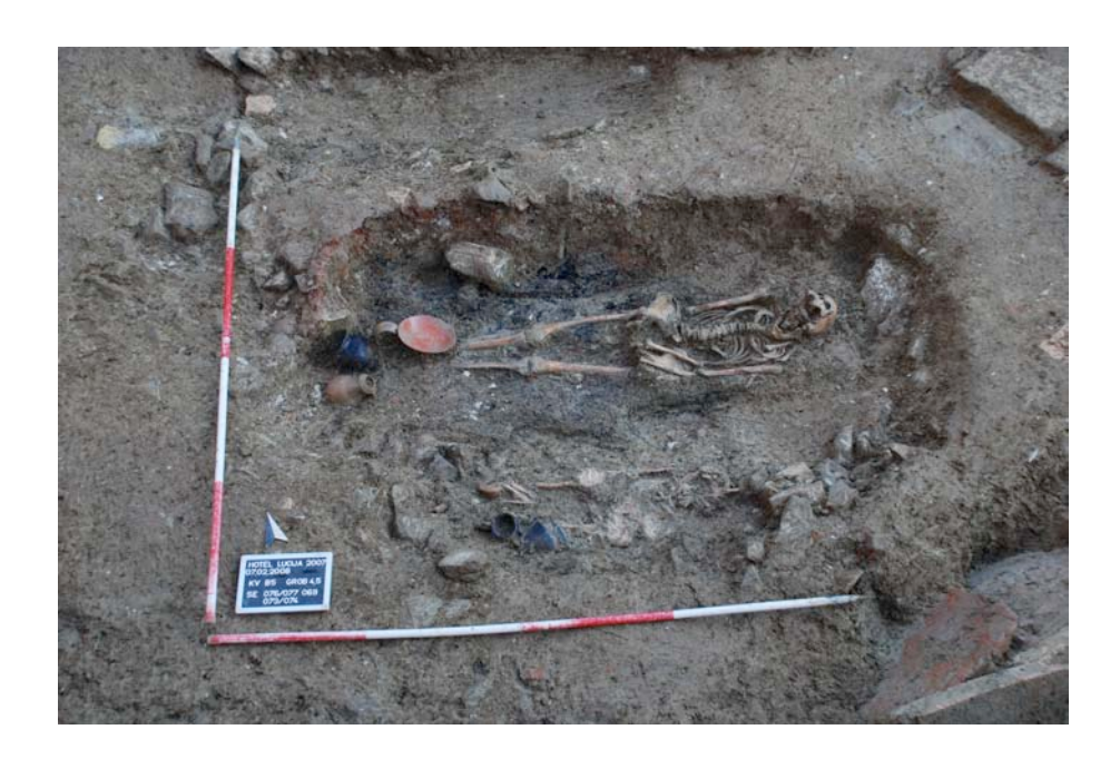
Figure 3. Late Roman grave

It is important to mention that the remains of church foundations were partly excavated near by the villa in 1995, but their interpretation is difficult because of the extremely limited excavated area. In spite of the limited research in the sv. Lovrenc area, a large amount of data has been gained about the place, the cemetery, the roads and the extent of the settlement, not only for archaeological research, but also for other sciences. The interpretation of the site can be undertaken from different angles, but without the hypothesis and speculations we can never re-create the past as it actually was.