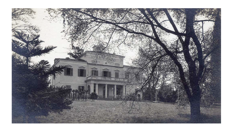
Figure 3 . Villa San Lorenzo

The large neoclassical style villa is adorned with Corinthian columns at the main entrance and has rich interior decoration, parks, paths, the extant church of sv. Lovrenc and gardens. Rigetti sold the villa to the tourist trust of Piran at the beginning of the 20 Century, with very rich library, more than hundred pictures and rich furniture. Once a centre of elite society, music, cultural and spiritual events was lost. They transformed the villa into the Frediani Hotel. The new decorated villa became a luxurious hotel with tennis courts, garage, parks (Hoyer 1999). At the same time the large new Palace Hotel was opened in the vicinity and this was a start of the tourism industry in Portoro. Portoro became the most famous resort and spa centre for elite society in the north Adriatic until the end of the First World War. The villa was destroyed and replaced by a large massive hotel building (hotel Metropol) during the 1970s. The same fate was suffered by many others small villas, landscapes in the bay of Portoro.