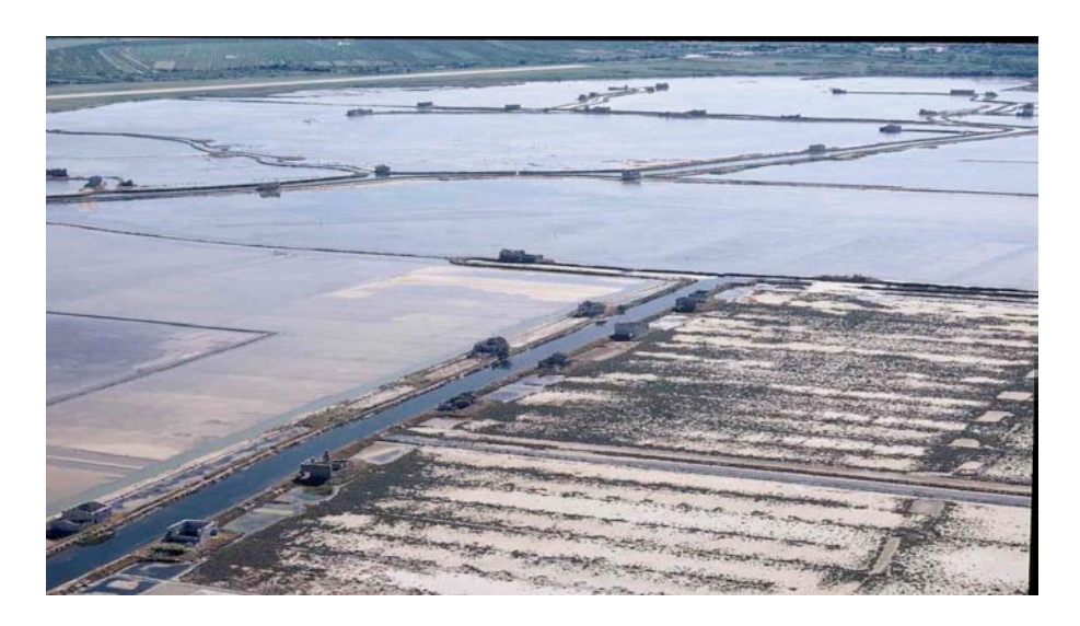
Figure 1. Salt-pans

ancient origins, were demolished by new building interventions and today in the period of "reconstruction" of religious feasts, festivals, traditional production of the salt and presentation of rare historical building as "theatre curtain" as some small remains of archaeological sites are just a memory of the lost of the spirit from the past. The public interest and is becoming important but is still divided by individual, economic and probably by ideological interests?