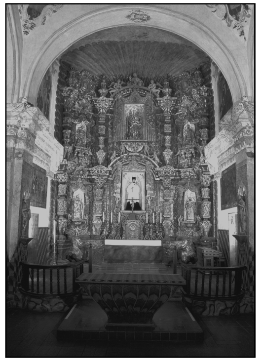
Main Altar, San Xavier del Bac