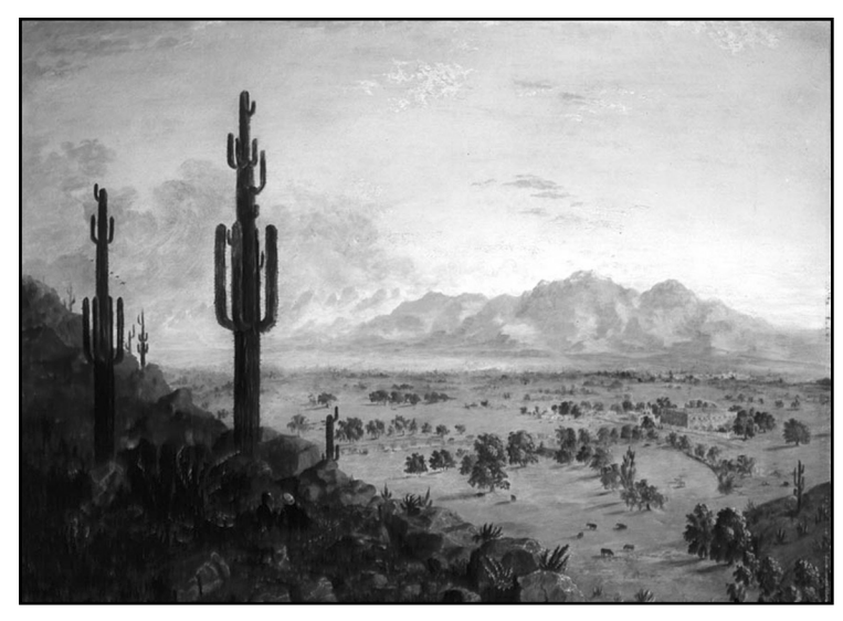
Mission San Agustín circa 1855