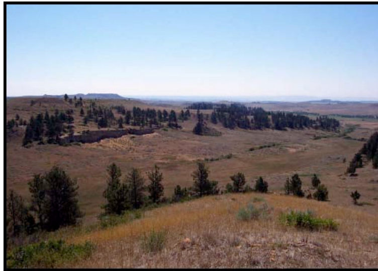
Figure 2. “The Gap” at Rosebud Battlefield. (Jenks 2007)

A study by the National Park Service and Western History Association (2002) under a Clash of Cultures theme identified a number of sites along the Great Sioux Wars trail deserving of far greater recognition and protection than is currently in place.