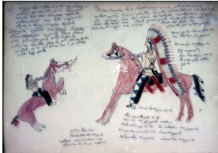
Figure 3. Drawing of Rosebud Battle by Joseph White Bull, Lakota. (White Bull 1931)

not always shared, nor understood by non-native agency personnel with little background in the history of these places.