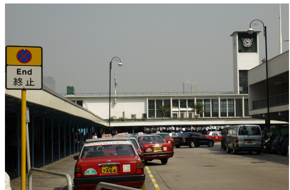
Figure 2. The Central Star Ferry Pier (top) and the public protest (bottom)

Prior to 2006, there was no centralized avenue for addressing the public’s rising concern over Hong Kong’s development at the expense of conservation. However, when the government decided to tear down two iconic, yet ordinary, ferry piers from the 1950s (the Central Star Ferry Pier and the adjacent Queen’s Pier), the public began to vehemently voice their disapproval and staged one of the largest heritage protests in Hong Kong’s history ( Figure 2 ).