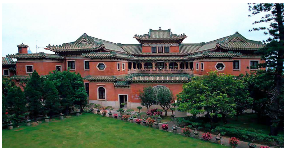
Figure 6. King Yin Lei.

for doing so are protracted and difficult; particularly in a place like Hong Kong where land in sought-after areas is costly and discussions between government and private developers are perceived with suspicion. One such success is the preservation of King Yin Lei (Figure 6), achieved through a land swap where the site offered for exchange was made available through rezoning, following a public town planning process. Clearly, such economic incentives can only be used sparingly – and strategically.