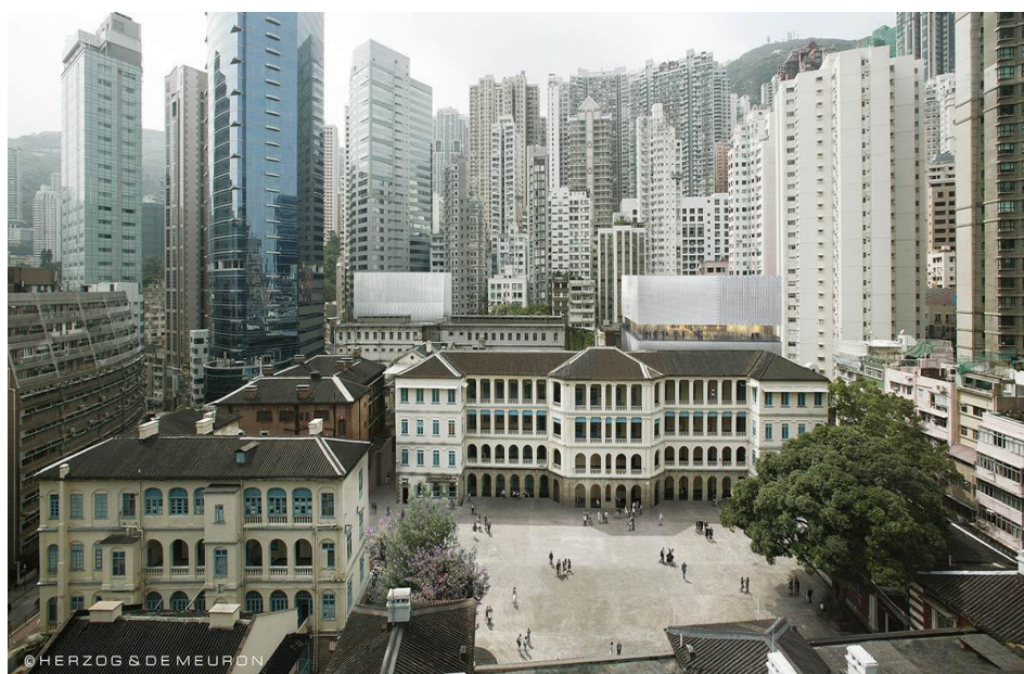
Figure 9. Central Police Station Compound, one of the heritage building clusters in “Conserving Central.”