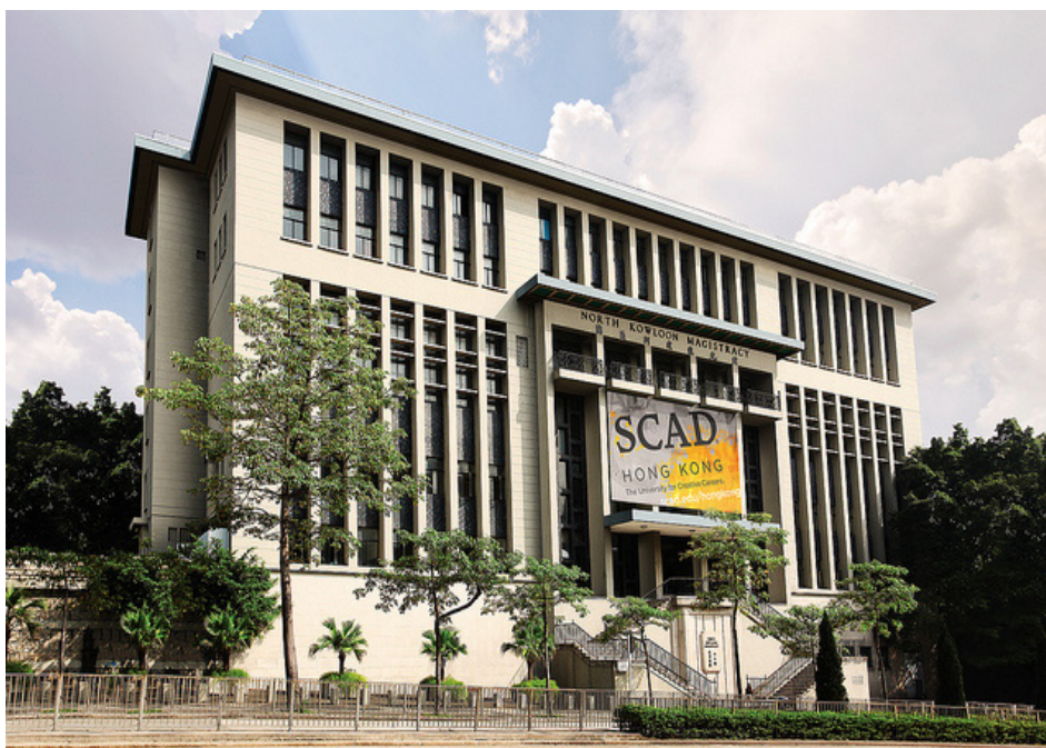
Figure 5. The former North Kowloon Magistracy was revitalized as an art college. In 2011, the project received a UNESCO Asia-Pacific Award for Culture Heritage Conservation in recognition of its successful adaptive reuse for the greater Hong Kong community.