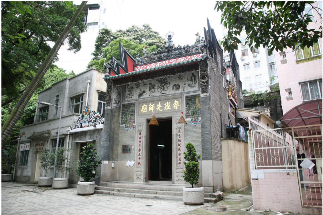
Figure 7. Lo Pan Temple, which has benefitted from the “Financial Assistance for Maintenance Scheme” for its repair work.

Less challenging and more feasible, is the initiative “Financial Assistance for Maintenance Scheme” (Figure 7). This scheme is intended to help reduce the deterioration of privately-owned graded historic buildings due to lack of maintenance by providing financial assistance in the form of grants to their owners. In exchange for this assistance, a degree of public access is requested, in order to give back to the community. As with the “Economic Incentives for Preservation of Privately-owned Historic Buildings,” this programme is an effective means of controlling and supporting development in what can be called “sensitive” historic areas.