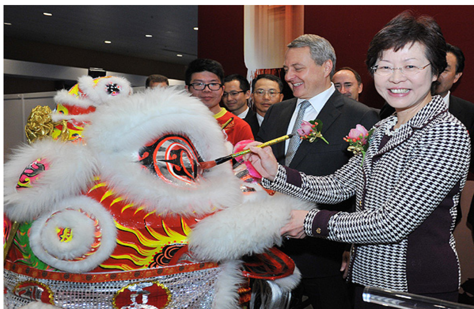
Figure 3. Secretary for Development, Mrs. Carrie Lam.

The responsibility for implementing the Chief Executive's policies for development-related heritage conservation was assigned to a new bureau: the Development Bureau, headed by the Secretary for Development ( Figure 3 ), who sits directly under the Financial Secretary, who, in turn, sits directly under the Chief Executive. Almost all pre-existing departments with responsibilities related to the conservation of heritage resources were gathered together (development-related or not) under the newly-formed Development Bureau.