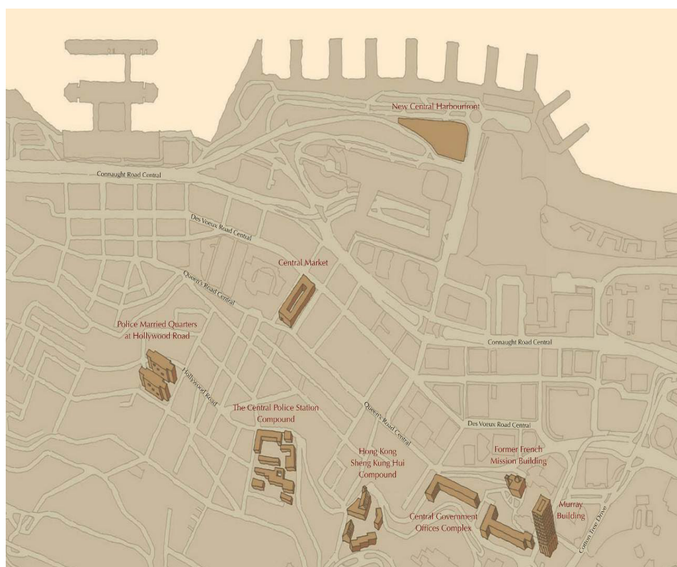
Figure 8. The heritage building clusters in “Conserving Central.”

Whether as an expansive site (such as the Central Police Station Compound, Figure 9 ) or as a series of clusters distributed within a district (“Conserving Central”), such heritage resources are touchstones for future development and evocative anchors in a dynamic and changing urban environment.*