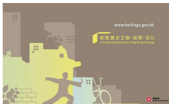
Figure 4. Public Awareness Campaign on Heritage Conservation (top) and Liberal Studies Teaching Kit on Heritage Conservation (bottom).