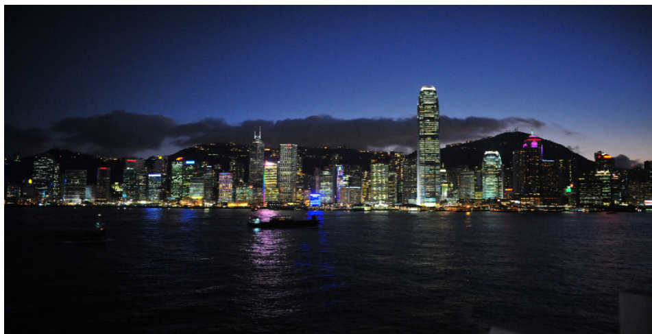
Figure 1. Hong Kong's "harbourscape."

Yet, Hong Kong is more than its harbour and more than a sea of high rises. Hong Kong's main island, what is properly called Hong Kong Island, is one of some 200 islands and one of three distinct parts of the Hong Kong Special Administrative Region. Hong Kong Island was leased to the British as a treaty port in 1841. From the beginning, the City of Victoria (the settlement area along the north shore