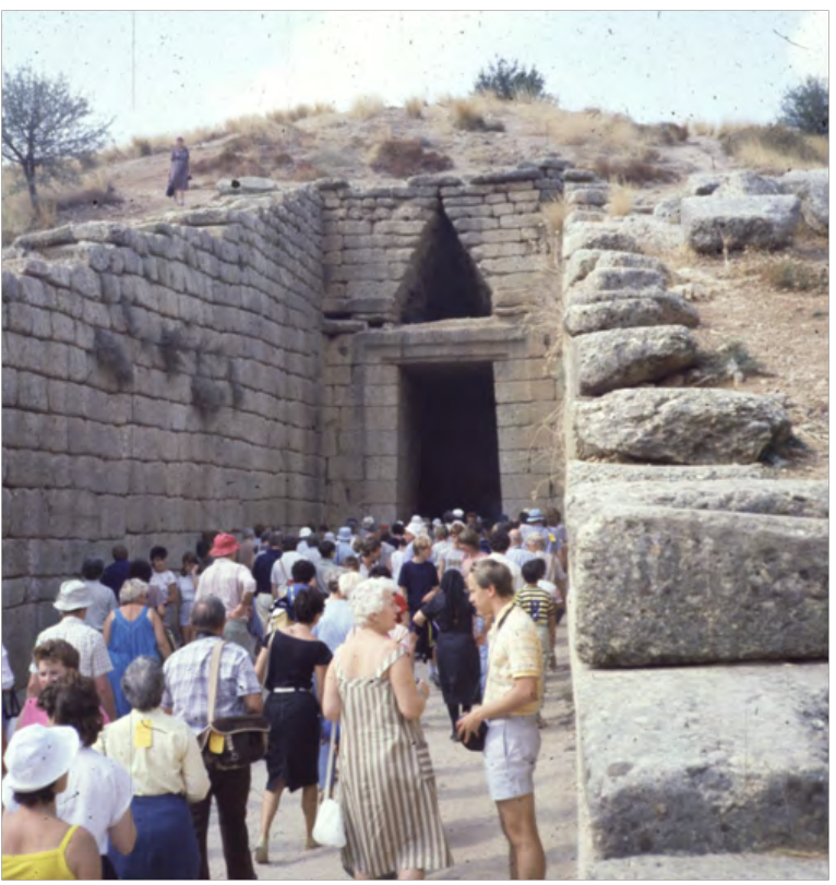
Figure 1 Mycenae: Treasury of Atreus in summer

some kind of "heritage Disneyland" in which their organic growth is smoothed over and neutralized. I have powerful memories of my first visit (in 1963) to Alberobello (Italy) and its extraordinary domestic buildings, known locally as trulli . At that time this was an active and viably community where most of the buildings served to house traditional crafts and also to meet the needs of the contemporary