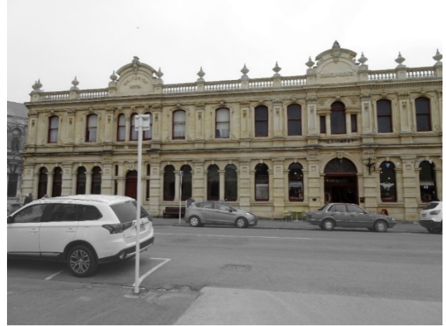
Visible colour variation in Oamaru limestone parapet, indicating recent reconstruction works

where the original parapet finials were removed from the building, the parapet was readdressed during the 1990s conservation scheme. Archived working drawings reveal a process of dismantling the original and constructing a bond beam and stone parapet, that is perceptible from street level visual inspection (Fig. 4a).<sup>28</sup> The procedure of works entailed reinstating new parapet finials with concealed carbon fibre rods, and fixed with epoxy resin grout.<sup>29</sup> The parapet demanded full reconstruction, potentially reusing any remaining good stone.<sup>30</sup> This procedure related to the 1993 ICOMOS Charter's process of reconstruction.<sup>31</sup> Partial reconstruction is addressed, although clarification of whether this process involves additional new stone or other remaining materials lie outside the Charter scope, remaining to be defined on a case-by-case basis.<sup>32</sup> Similarly, the subject of workmanship is addressed through the use of surviving evidence or knowledge of form, design, technology and craftsmanship for the purpose of reconstruction.<sup>33</sup> Authenticity is defined for the first time in the 2010 Charter.<sup>34</sup>