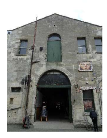
(d) Harbour Street Elevation