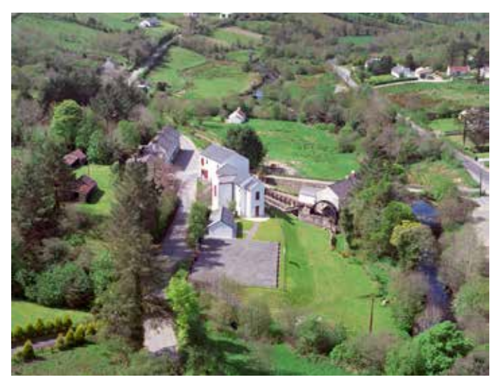
Fig. 1: Newmills Corn and Flax Milling Complex, County Donegal: Declared a National Monuments in 1987 and is in the care of the State's National Monuments Service.

The 1930 National Monument Act has been hugely significant in the protection of our heritage, particularly our archaeological sites and monuments. The Act is the basis for our present National Monuments Service, and subsequent revisions have strengthened its provisions. Under the 1930 Act the term 'monument' included all man-made structures whether of archaeological, architectural or of historical interest.