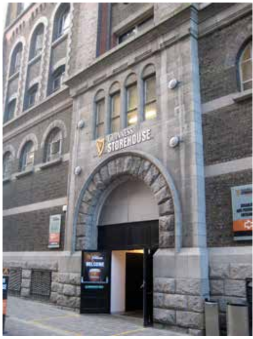
Fig. 7: Guinness Storehouse, St. James's Gate Brewery Dublin: This former fermentation plant, constructed in 1902, now houses Europe's top visitor attraction.