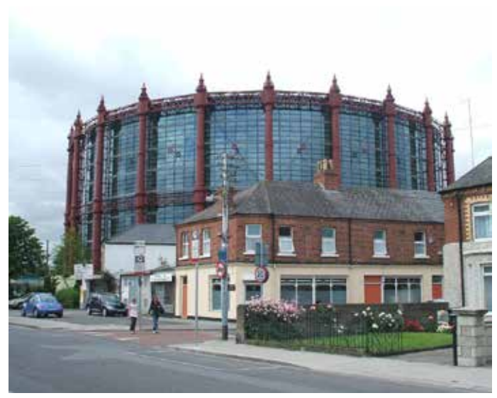
Fig. 4: Dublin Gasworks: Late nineteenth century gas holder was converted into a multi-storeyed apartment building in 2006.

resources required however, the NIAH surveys a representative example in each county and as a result, although coverage has increased and many structures of industrial interest are included, a comprehensive inventory of our industrial heritage stock is not yet available.