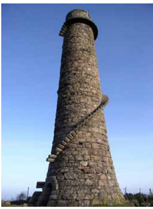
Fig. 6: Ballycorus Lead Mines, County Dublin: The flue chimney is the most prominent surviving feature of the leadworks which opened in 1807 and operated for over a hundred years. Protected by Preservation Order under the National Monuments Act whereby the owner is legally obliged to preserve it.

The Department of Arts, Heritage, Regional, Rural and Gaeltacht Affairs has recently undertaken a review of the Act. An expert advisory committee was established to carry out the review and consisted of a range of experts from the public and private sector, including members of ICOMOS Ireland and its Industrial Heritage National Scientific Committee (IHNSC). The review examined in detail the implementation of the Planning and Development Act since 2001 and the draft report which included some proposed legislative amendments was circularised in December 2016 for comment before the recommendations are implemented.